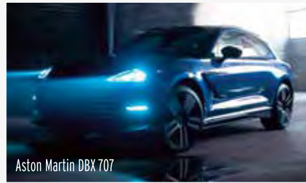
Aston Martin DBX 707