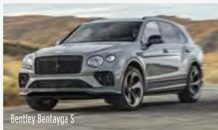
Bentley Bentayga S