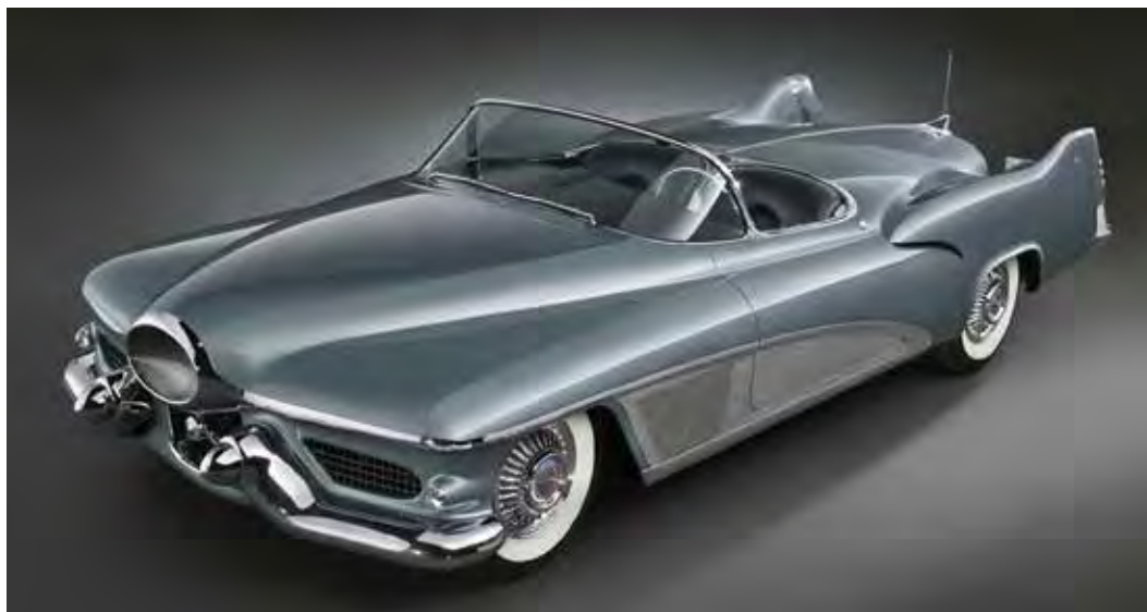
The Le Sabre Dream Car of 1951 (left) featured jet-inspired tailfins that would appear on Cadillacs throughout the 1950s.

The next year, Cadillac's comparatively small, bullet-shaped front bumpers grew into large projectiles, colloquially labeled "Dagmars," inspired by television star Virginia Ruth Egnor, whose professional name was Dagmar. For the first time, the Eldorado got its own rear bodywork, with prominent tailfins, twin round taillamps on each side faired into a long spear down the rear fender, no fender skirts, decorative vertical chrome bars between the trunklid and the rear bumper, shiny trim panels along the belt line, the first Sabre spoke wheels, and standard whitewall tires. The price jumped back up to $6286, but Cadillac still sold 3950 Eldorado convertibles.