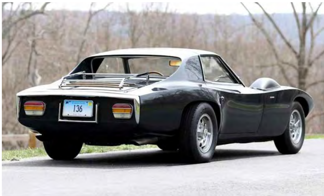
The American racer John Fitch designed the Phoenix sports car using a Chevrolet Corvair as its foundation. An air-cooled engine at the rear provided power.

Fitch refunded every deposit and maintained ownership of the one and only Phoenix ever constructed until his death in 2012. //