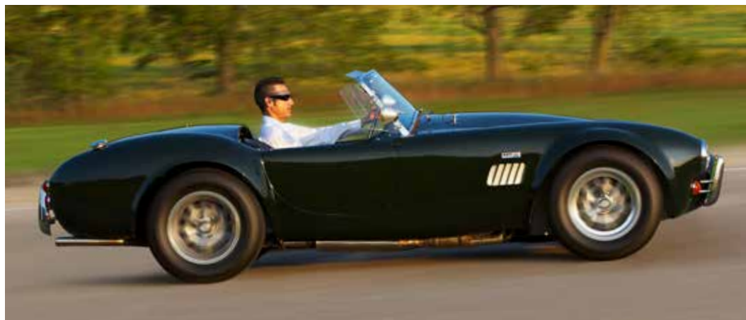
Carroll Shelby used the age-old formula of a huge engine stuffed into a small car; the legendary Cobra was the result.

Production ceased in 1954, with a total of 506