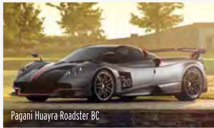
Pagani Huayra Roadster BC