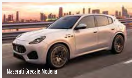
Maserati Grecale Modena