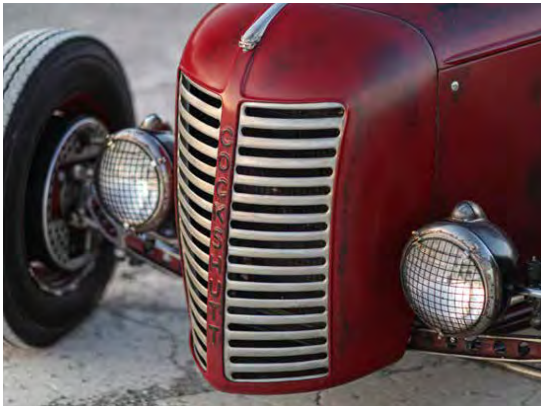
The interior of Dick DeLuna's '34 Ford 5-window coupe boasts bomber seats and a Bell racing steering wheel. It has a grille from a rare Canadian Cockshutt tractor.