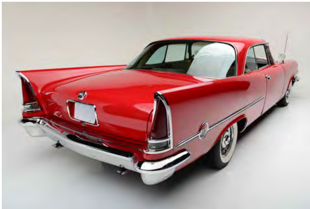
The 1957–59 models represented the pinnacle of midcentury automotive design and won the prestigious “Excellence in Automotive Design” award.

Chrysler went on to invoke the 300 name in various forms, most significantly with a dedicated rear-drive model launched in 2005. With a stonking 470-hp SRT-8 version available, the 300 again harkened back to an era when Chrysler led the auto industry with its highly specialized performance cars. //