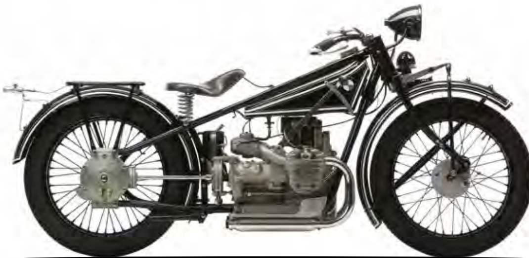
The 1926 R42 featured a stronger engine more suitable for sidecar usage. This was the final incarnation of the original Max Friz design.

As the 1950s ended, BMW had to concede that it would not be as competitive in the solo classes as the Japanese, who entered the arena with a seemingly unlimited budget. Instead, BMW concentrated on building some of the best touring machines in the world. The R69S, at 594 cc, offered