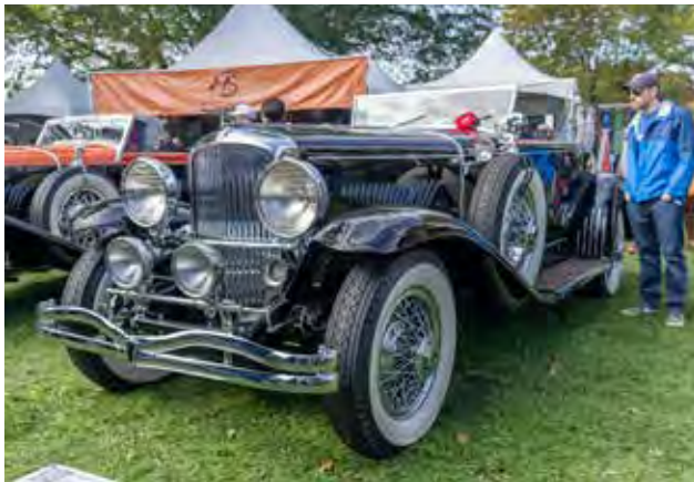
Class Awards (Award of Speed & Style) Featured Class — 100th Anniversary of Duesenberg 1929 Duesenberg J Murphy Rare Precious Metals