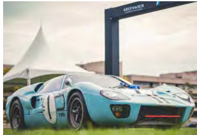
Best in Class Featured Class – Ford 1966 Ford GT40 Mk II-B Miles Collier