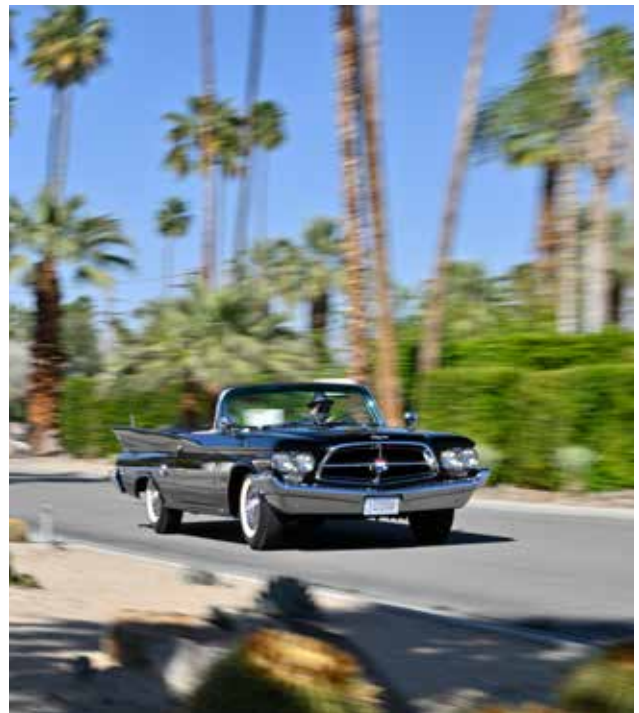
This 1960 300F is packed with contemporary technology, including push-button transmission controls and the AstraDome gauge package with electroluminescent lighting.

Since the introduction of the Hemi, Chrysler had partnered with racers such as Briggs Cunningham and Carl Kiekhaefer to help develop its potential. By the launch of the 1955 C-300, its output had been increased to a