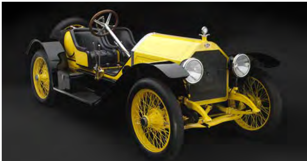
This racy 1916 Stutz Bearcat was highly coveted in the Brass Era—and remains so today.

Cars with enclosed bodywork were rare; most automobiles had open bodies, often with a folding canvas