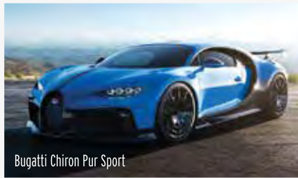
Bugatti Chiron Pur Sport