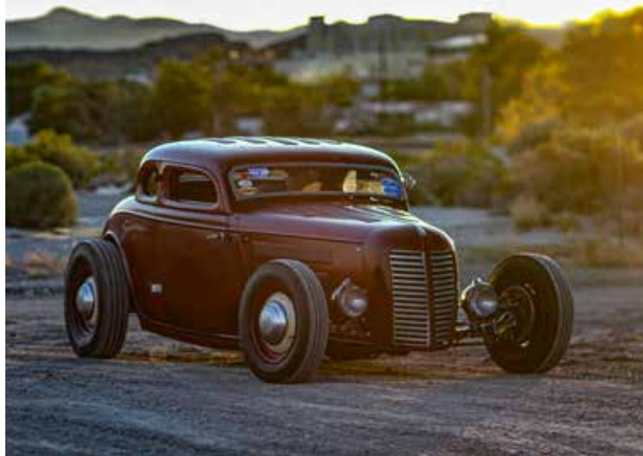
From top: Dick DeLuna's '34 Ford has all the Rolling Bones features, including a hot Navarro-equipped flathead with a Vertex mag, plus louvers everywhere, including the roof and the decklid. The crust of salt adds an extra touch of authenticity.