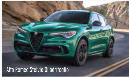
Alfa Romeo Stelvio Quadrifoglio

PROUD SUPPORTER OF THE GREENWICH CONCOURS