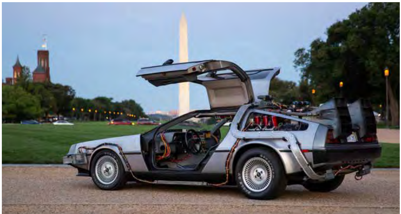
Hagerty Drivers Foundation

The mission: to shape the future of car culture, while preserving and celebrating automotive history.