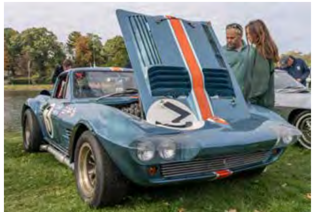
Class Awards (Award of Speed & Style) Featured Class — GM 1963 Chevrolet Corvette Grand Sport Teddy Freund