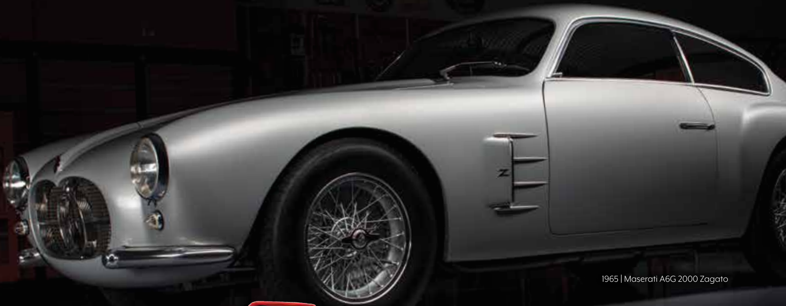
1965 | Maserati A6G 2000 Zagato