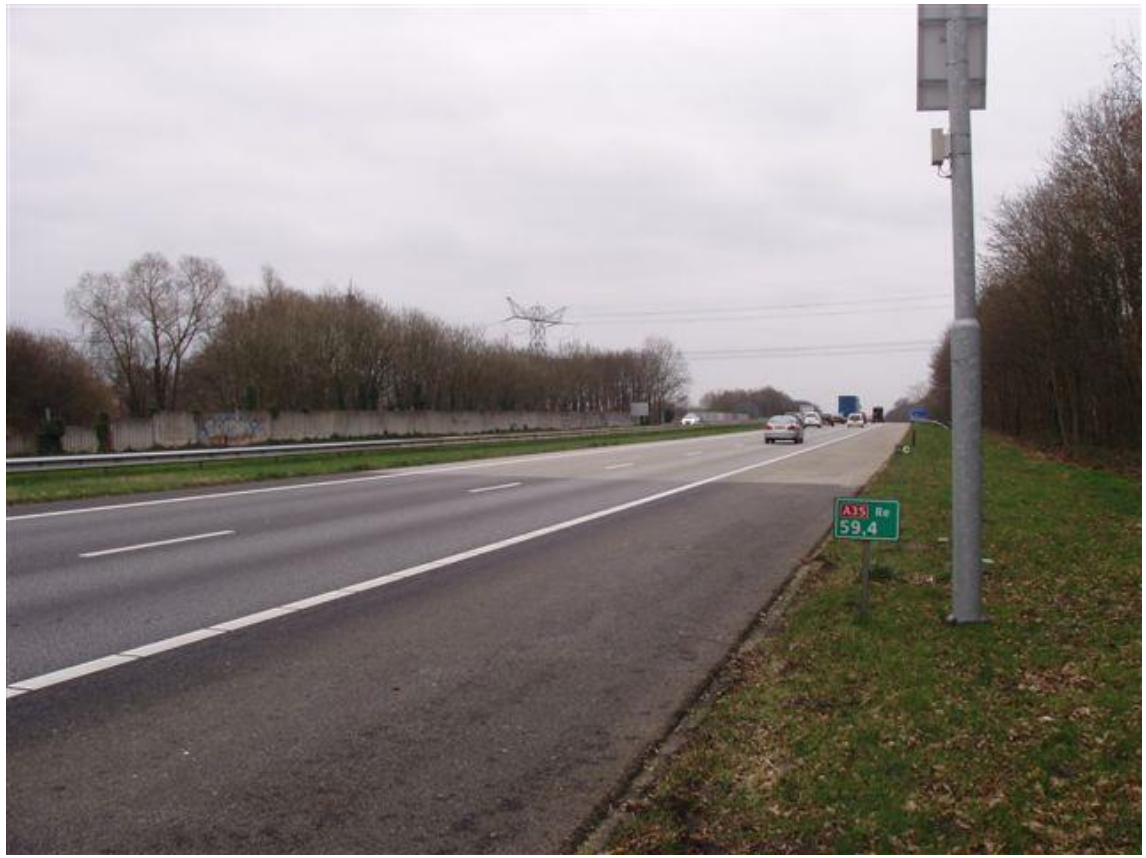
Figure 11: Transition between section B and C, February 2014