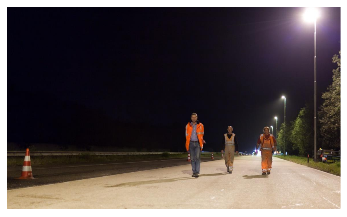
Figure 3: Visibility of standard (left) and light coloured asphalt