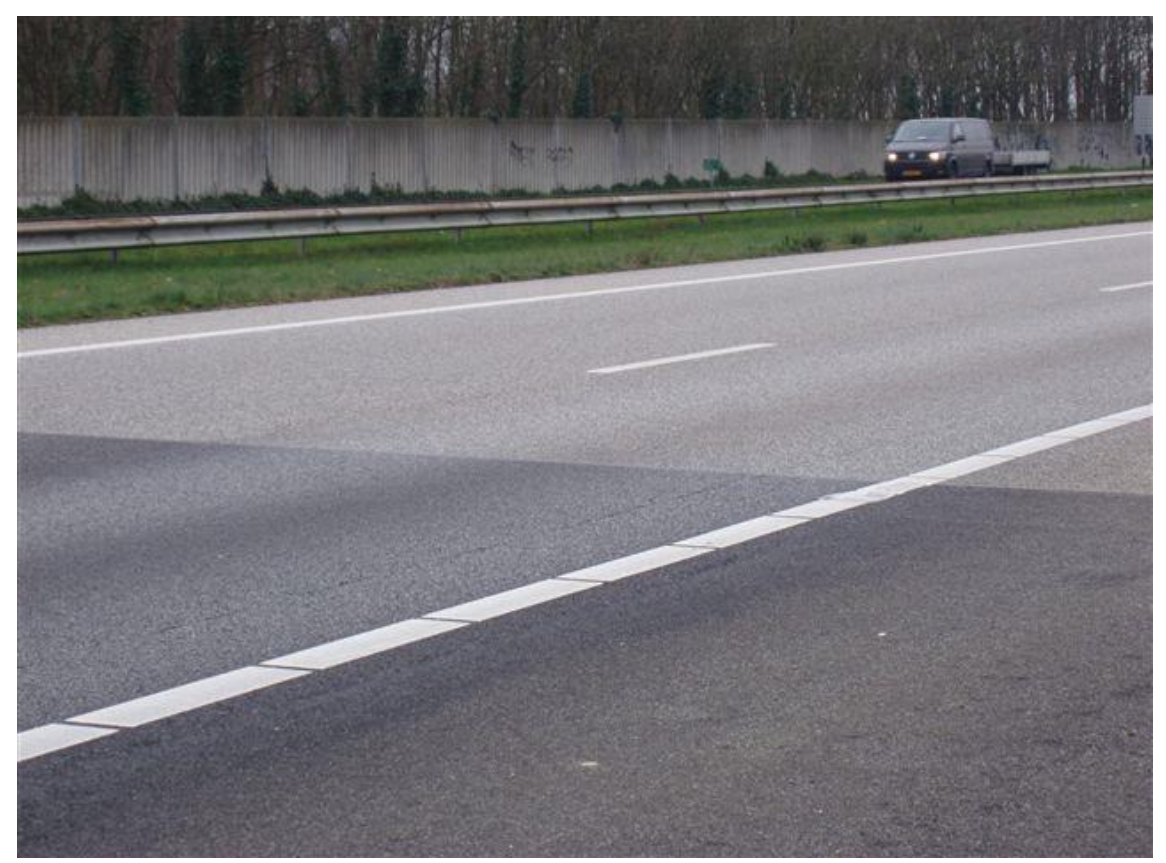
Figure 12: Detail transition between section B and C, February 2014