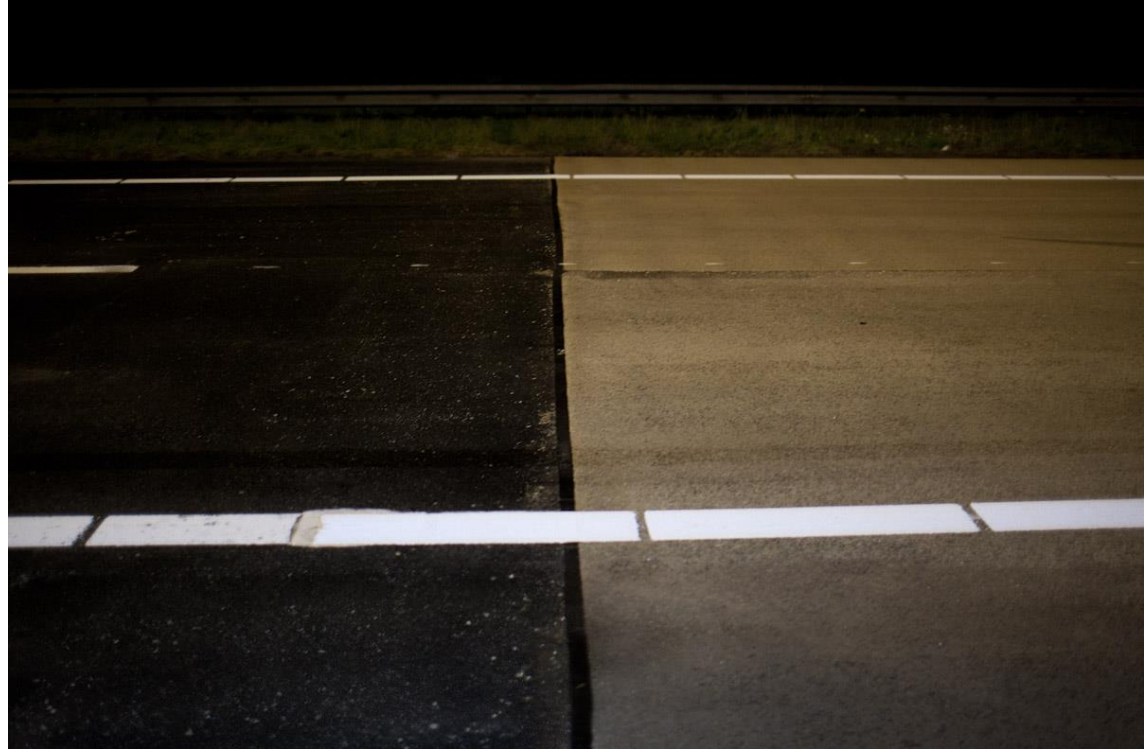
Figure 5: Transition between sections B and C