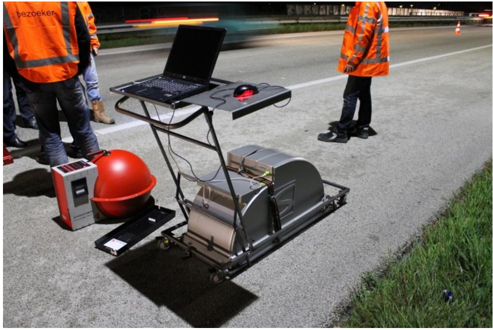
Figure 10: Night visibility at public lighting (average luminance coefficient Q0-S1-S2)