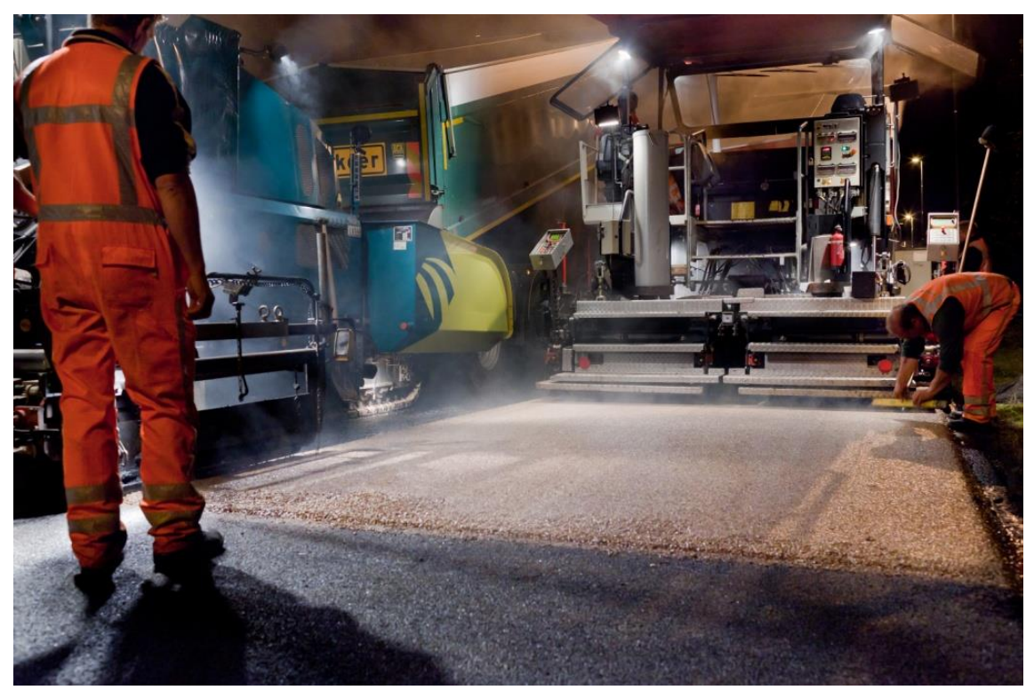
Figure 2: The first metres with clear binder (section C) on A35

The length of the first three sections is approximately 175 m per section. The fourth section is located on a bridge deck having a length of approximately 100 m. Samples of the four mixtures were taken during production to make gyratory specimen and slabs in the laboratory. After construction cores were drilled. In order to get a visual indication of the end result the bitumen skin on a few square meters of the emergency lane has been removed by planing. The first civil engineering measurements and the first lighting research took place on Thursday night and Friday night (September 29<sup>th</sup> and 30<sup>th</sup> 2011) just before opening of the test section for traffic.