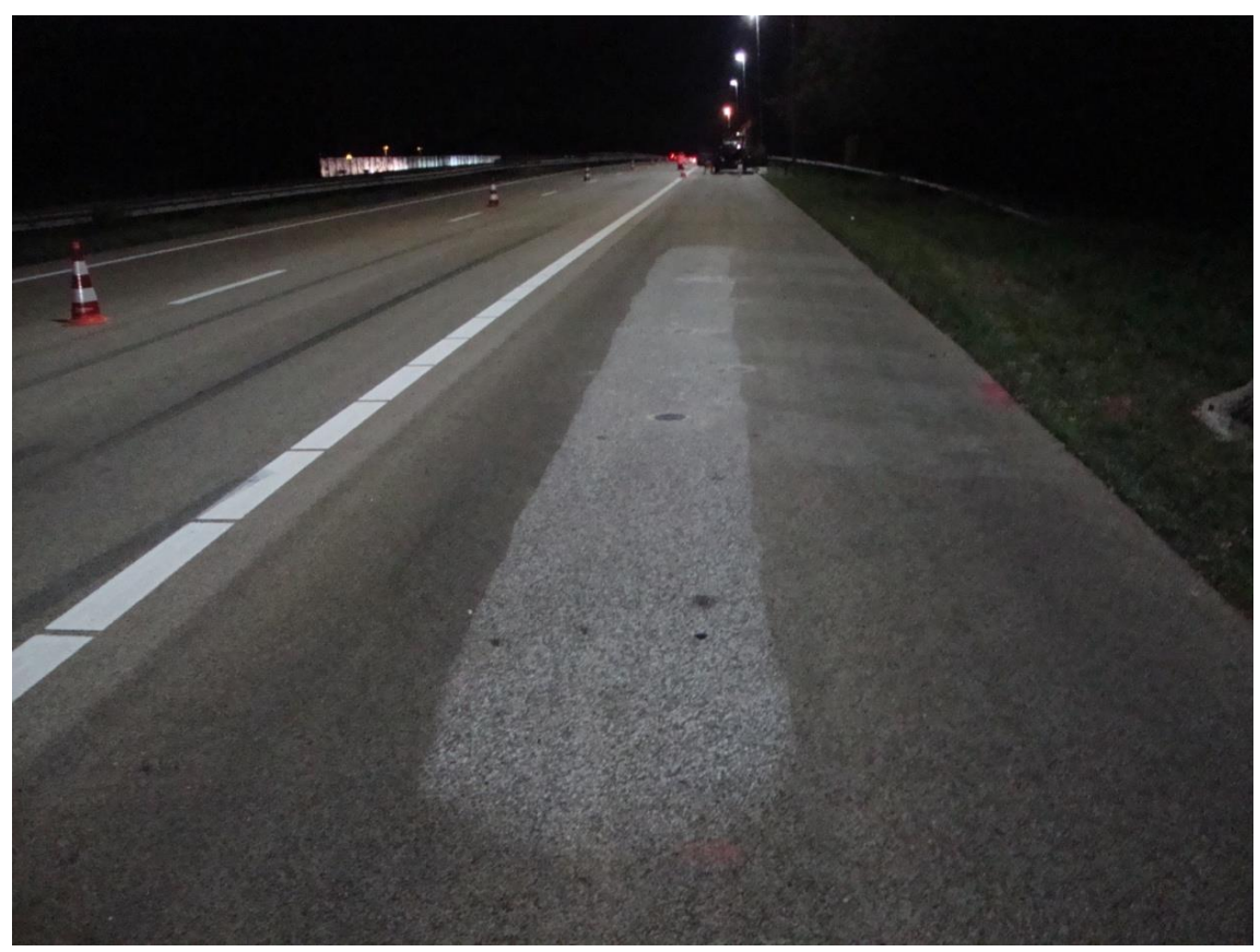
Figure 6: Planed small section for indication of end result