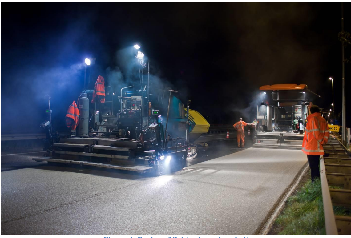
Figure 4: Paving of light coloured asphalt