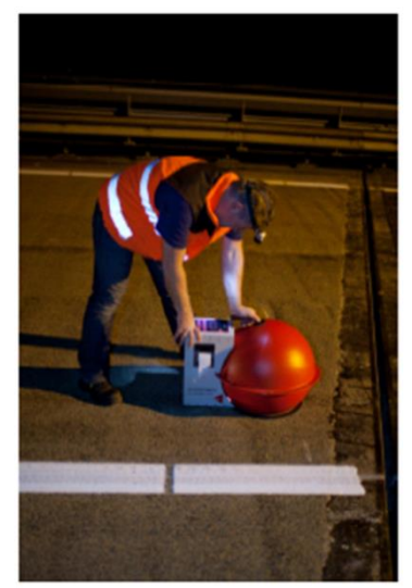
Figure 8: Day-night visibility at sky light (Qd)