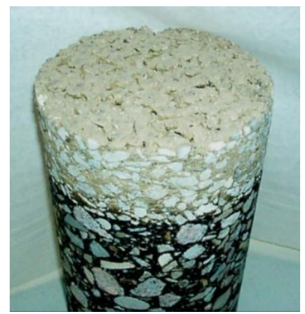
Figure 1: Light coloured asphalt

Dura Vermeer has developed their own light coloured asphalt named Luminumpave. On a Dutch innovation event in 2009 it has won the award for 'Best innovation of tomorrow'. It was decided to make a proposal for the Innovation Test Centre (ITC) of Rijkswaterstaat. This publication describes the construction of the test section followed by an overview of the tests including some results.