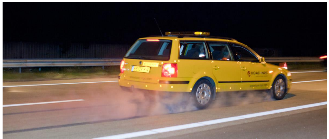
Figure 7: Brake deceleration test

The required brake deceleration of the reference section A was not directly met, the second measurement few months later did. All other civil engineering properties met the expectations and requirements. This paper addresses the skid resistance and the resistance to ravelling because these are possibly affected by the different special constituents. It also describes the warming- and cooling properties because that is the only 'non-standard' research.