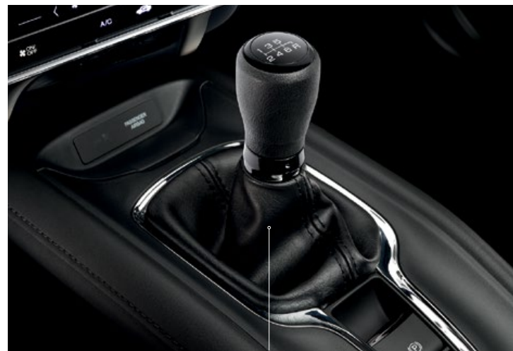
AVAILABLE LEATHER SHIFT KNOB