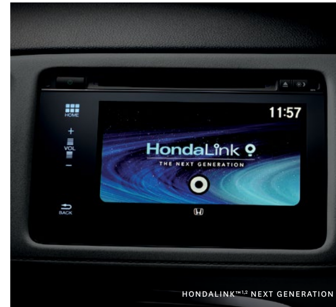
HONDALINK™ 1,2 NEXT GENERATION