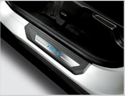
ILLUMINATED DOOR SILL TRIMS