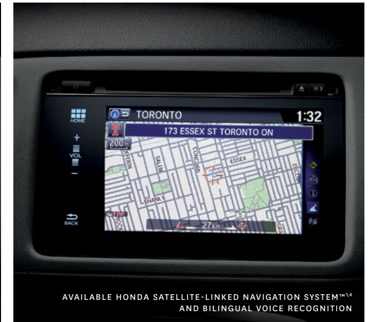
AVAILABLE HONDA SATELLITE-LINKED NAVIGATION SYSTEM™ 1,4 AND BILINGUAL VOICE RECOGNITION