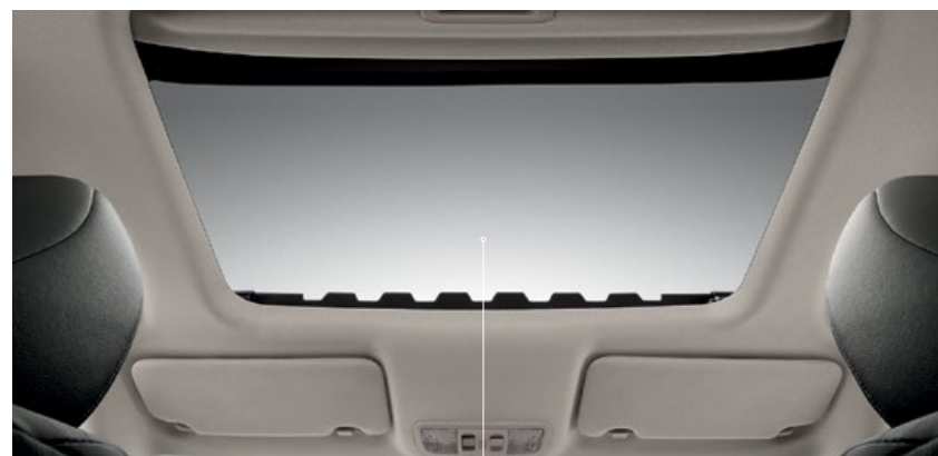
AVAILABLE ONE-TOUCH POWER MOONROOF WITH TILT FEATURE