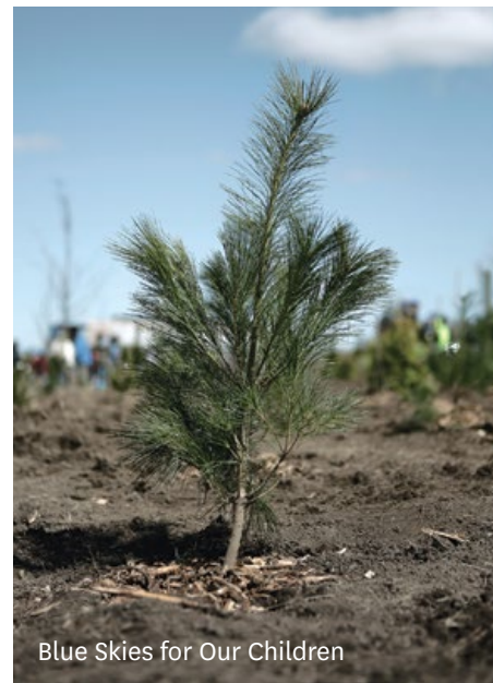
Blue Skies for Our Children