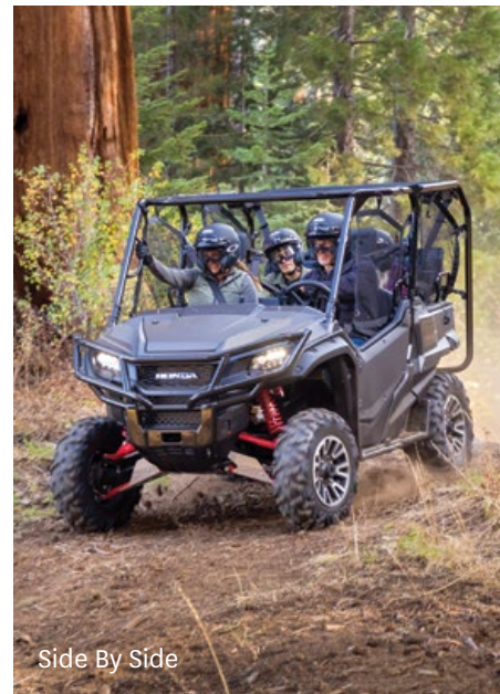
Side By Side