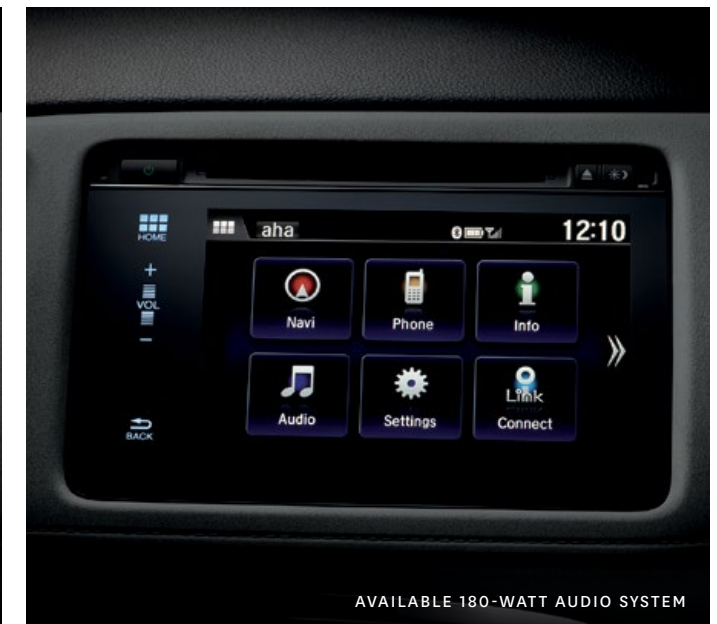
AVAILABLE 180-WATT AUDIO SYSTEM