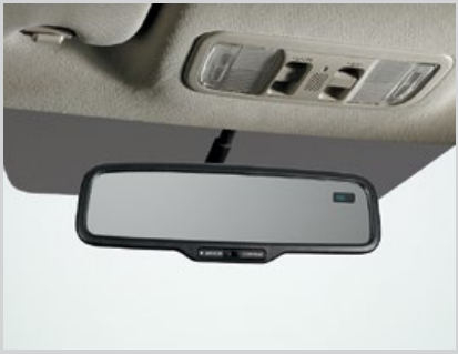
AUTO DAY/NIGHT MIRROR