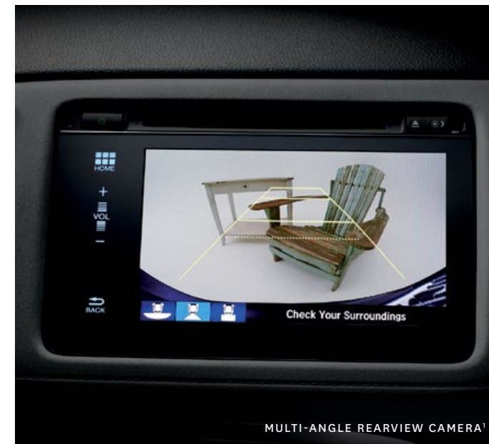
MULTI-ANGLE REARVIEW CAMERA 1