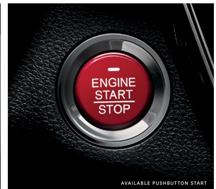
AVAILABLE PUSHBUTTON START