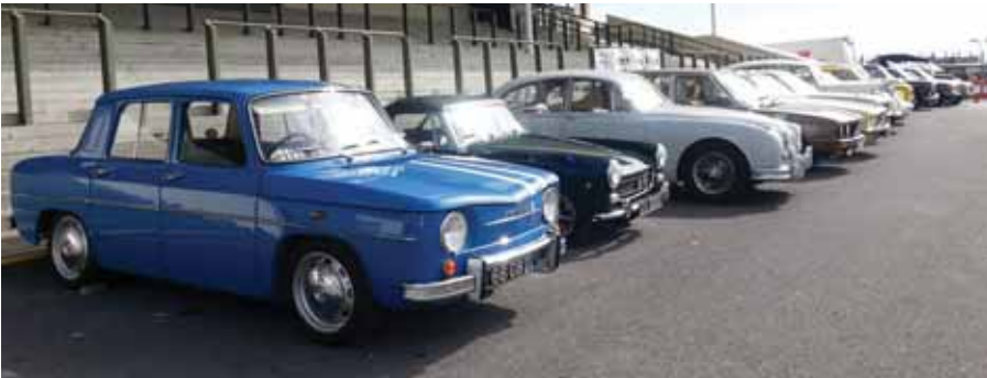
Photos featured are from the pre-1955 Run and the West Run

Nowadays the Club has a membership of around 200 from all over Ireland and indeed has a few members in the UK. The aim is still to promote an interest in Veteran, Vintage and Classic Cars through the organising of runs, static displays, and participation in parades and festivals with a very diverse range of cars, as our Club founders did.