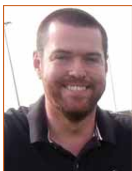
By KEVIN HERRON

It was with great disgust that I recently ripped the most loathsome of all car accessories off my Rolls-Royce, the SU electric fuel pump! I had to tap it one too many times for my liking, I had to adjust it once too often and a few weeks ago it gave a very weak fluttering sound, so I had enough and installed a 'pointless' modern type pump. I'm usually a stickler for originality of this type, but this upgrade instantly transformed the car.