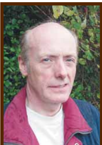
By COLM O'NEILL

Behind the DKW is another more familiar German, a Volkswagen 1200 with a 1957 Co. Limerick number CIU 608, among the last before the rear window and windscreen were enlarged for 1958. Finally, parked under a street lamp is a Ford 10 cwt. E83W pick-up. Once a very common sight on Irish roads, these were also produced in van form and enjoyed a long production run from 1938 to 1957 with very few changes.