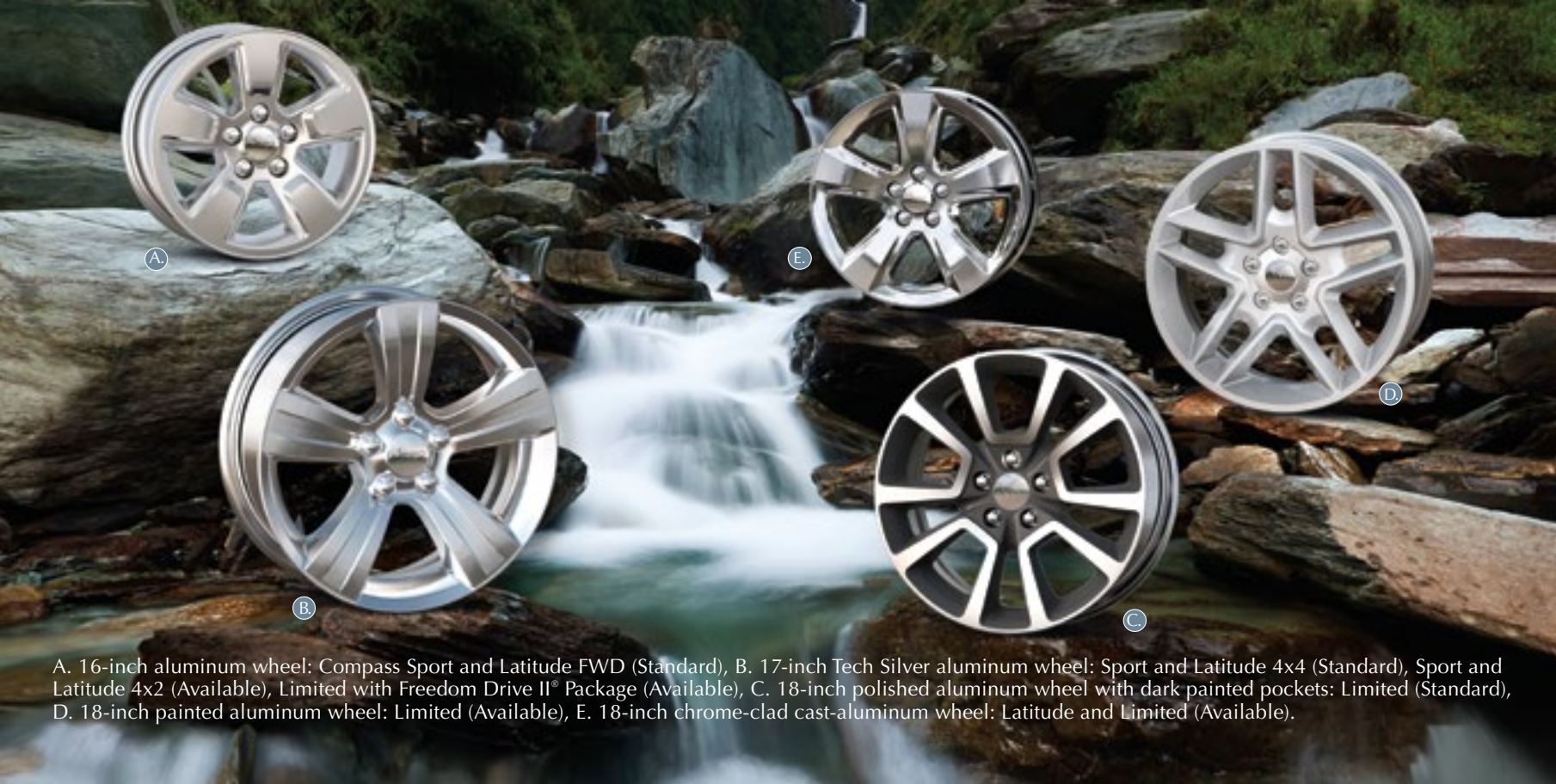
A. 16-inch aluminum wheel: Compass Sport and Latitude FWD (Standard), B. 17-inch Tech Silver aluminum wheel: Sport and Latitude 4x4 (Standard), Sport and Latitude 4x2 (Available), Limited with Freedom Drive II® Package (Available), C. 18-inch polished aluminum wheel with dark painted pockets: Limited (Standard), D. 18-inch painted aluminum wheel: Limited (Available), E. 18-inch chrome-clad cast-aluminum wheel: Latitude and Limited (Available).