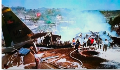
The accident scene of Shark-32 after skidding off runway 02 at Toncontin International Airport.