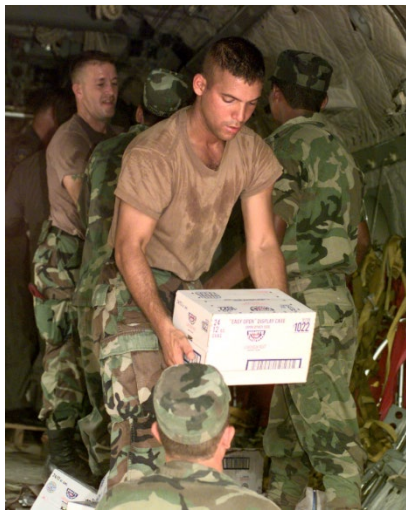
A U.S. Army soldier delivers relief supplies in Mocerón, Honduras in the days following Hurricane Mitch in 1998

In the end, the medical team saw over 10,000 patients in what was described by Col. Jacoby at the time as a very complex mission that “only the United States military could have accomplished.” 63 Nevertheless, when one strips away the complex logistics and utter size of the undertaking, it was essentially a MEDRETE, not particularly different than any other. It still required a site survey ahead of time to determine logistics and requirements before any doctors arrived on the ground; it still afforded valuable training to medical professionals, ultimately improving their readiness for future contingency operations; and it still built valuable relationships with medical and host-government