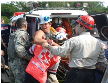
A Costa Rican man is loaded into an ambulance after being rescued by JTF-Bravo personnel via Blackhawk helicopter in 2010.

“For the first time in more than three years, United States servicemembers from Joint Task Force-Bravo deployed to Costa Rica for a Medical Readiness Training Exercise ...” begins a Dec. 21, 2007, article about the start of training operations in Piedra Mesa. 92 The U.S. Ambassador to Costa Rica at the time noted that the mission, which was at least a year in the making by the time of its execution, showed that Costa Ricans had been unaware of what the U.S. had been doing in the