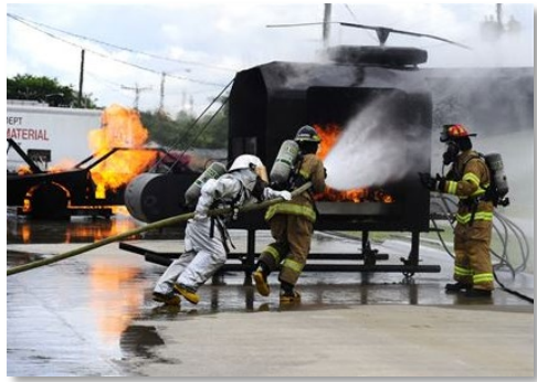
JTF-Bravo hosts a CENTAM SMOKE exercise in 2013.

Regular operations for JTF-Bravo such as training missions continued in the new decade. In August 2013, all Central American countries participated in the Sharing Mutual Operational Knowledge and Experiences exercise—CENTAM SMOKE, as it is called—for the first time since its inception six years prior. The series of exercises is a biannual event intended to “foster a strong professional relationship with partner-nation firefighting personnel by promoting dialogue, improving information sharing as well as refining existing tactics, techniques, and procedures.” 99