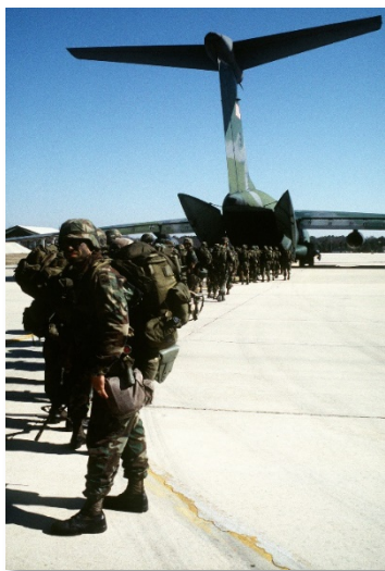
Members of the 82nd Airborne Division prepare to board C-141B Starlifter for transport to Honduras.

The aptly named Operation Golden Pheasant truly was a game of chicken, with President Ortega issuing threats to "combat and liquidate" U.S. forces in the