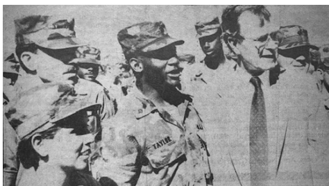
Vice President George H.W. Bush poses with members of JTF-Bravo during a stop at Palmerola AB in January 1986.

For the rest of the decade and beyond, such exercises, big and small, would be conducted with much the same intent: build interoperability for combined participants while increasing partner-nation capacity. Though a focus on ‘nation-building’ within Honduras would not become an explicitly stated objective of the U.S. presence in the country until nearer the end of the decade, it is clear that it was at least an area of interest for American leadership even in the middle of the decade.