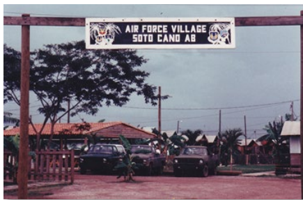
A view of part of Soto Cano Air Base around the time of its re-naming in 1989.

Up to this point in its history, JTF-Bravo had been almost entirely focused on operations within Honduras. Though it was understood that the effects of a U.S. presence in Central America would be necessarily regional, the vast majority of operations had taken place internal to the borders of the task force's host nation. The end of 1989 was a reminder of its broader role in enabling operations in Central