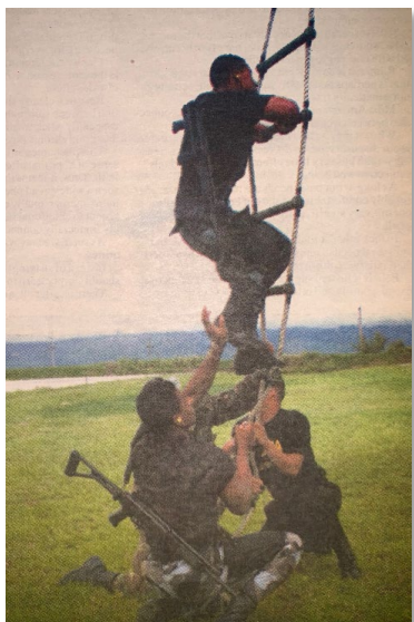
Members of the Honduran Police and Counter-drug Force climb up a Jacob's Ladder to a CH-47 Chinook helicopter hovering overhead

Chief among these, and by far the most dramatic in terms of shifting day-to-day operations, was the long-awaited fruition of the counterdrug mission set. What had previously been, at least publicly, a more subsumed, tertiary responsibility for JTF-Bravo in supporting other agencies' activities in Central America rapidly became the central focus of much of its public-facing content. This change manifested most broadly in March of 2000 with the announcement of a successful mission in conjunction with the Costa Rican counternarcotic police in which a task force, dubbed 'Enabler,' was responsible for the eradication of more than 1.2 million marijuana plants. 73 While the U.S. service members were not conducting the eradication themselves, they were training their Central American partners in tactics and techniques, as well as providing the lift capability.