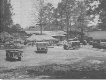
The remains of Camp Castle in June 1989.

But by the end of the first iteration of Fuertes Caminos in June, the final rotation of Task Force-16 soldiers began the poignant task of dismantling the facilities they had put so much work into building in the first place. Though the lifespan of Camp Castle was shorter than many of its counterparts, its story is indicative of the nature of these remote, truly temporary pieces of JTF-Bravo's history. The historical record indicates at least eleven