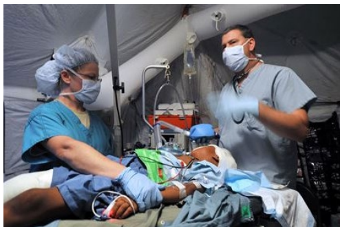
Members of JTF-Bravo's Medical Element care for a five-year old Haitian boy during Operation Unified Response in 2010.

magnitude worse than originally feared with 100,000 or more 96 killed in the disaster.