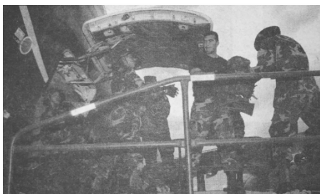
Members of JTF-Bravo help Honduran soldiers as they prepare to deploy to Iraq in 2003.

Perhaps the best example from this period that highlights cooperative security—and one that also shows the collective value of the more than 20 years of U.S. work with military-to-military training and institutional development in Honduras—was the August 2003 deployment of more than 300 Honduran soldiers to the Middle East. Aided by members of JTF-Bravo during the pre-deployment process, the contingent departed from Soto Cano AB to become part of a Central American task force that contributed to coalition activities in Operation Iraqi Freedom. 82 Five years down the road, the task force would provide similar support to a contingent of Salvadoran soldiers deploying in support of the same fight. U.S. service members similarly provided their Salvadoran counterparts with familiarization on U.S. equipment, tactics, techniques and procedures prior to their departure. 83