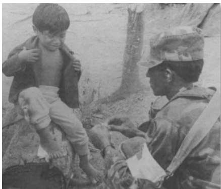
A U.S. Soldier provides medical care to a Nicaraguan child during Operation Amigo in 1990.

The effects manifested quickly. A few months later in April 1990, JTF-Bravo was called upon to help when the U.N. secretary-general requested assistance with an international effort to repatriate displaced Nicaraguans and resistance noncombatants. Over the course of five days, members of JTF-Bravo flew thirty-eight sorties to move more than 1,500 people to prepositioned locations to help them repatriate. The operation also required the movements of 68,000 lbs. of cargo. The aircrew