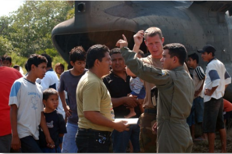
Members of the 1-228th Aviation Regiment and Joint Task Force-Bravo arrive in Guatemala to help airlift relief supplies to those affected by Hurricane Stan in 2005.

Had 2005 not seen the destruction wrought by Hurricane Katrina in the United States, it would still be remembered as a destructive year with a series of back-to-back storms striking Central America at the end of the year. At the beginning of October, Hurricane Stan struck the region. Though the eye of the storm made its way across the Yucatan Peninsula, its effects were widespread, especially in Guatemala, which had already seen heavy rains that amplified the destruction of the