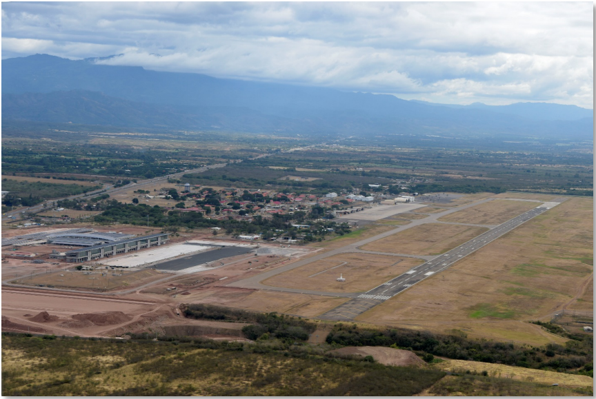
The airfield at Soto Cano AB as viewed from a UH-60 Blackhawk in 2020. Construction on the future Palmerola International Airport is visible in the foreground.