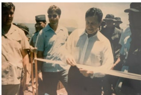
Secretary of Defense Casper Weinberger cuts the ribbon at the opening of the 41st Combat Support Hospital in 1983 (MEDEL History)

At Palmerola specifically, the military construction training was critical to establishing what was intended to be a 'semi-permanent' presence. More than $280,000 was spent on laying the groundwork for facilities at the base, including cantonment areas and personnel facilities such as showers. 17 It was also during this time, in September 1983, that the construction began in what one observer described as "nothing but a mud-filled, insect-infested field" 18 to build the 41st Combat Support Hospital. From site selection to construction of the mobile unit's facilities took only two days, with the resulting hospital capable of handling "everything except heart, neuro and eye surgery." Then-Secretary of Defense Casper Weinberger visited JTF-11 himself for the dedication of the hospital and road dubbed 'Weinberger Way.' Almost immediately, the staff of the hospital got to work conducting medical readiness events around Honduras that have become a staple of America's enduring presence in Central America.