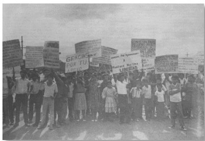
Honduran citizens gather outside Palmerola AB to express their gratitude for U.S. support during Operation Golden Pheasant in 1988.

While American troops were being deployed to four locations far away from battle zones, Honduran warplanes were bombing Nicaraguan positions in response to the Sandinistas placing down landmines as they withdrew toward the border ... In previous U.S. military exercises staged here in Honduras, U.S. troops were kept clear of border of Nicaragua by a 20-mile limit, but this time there is no 20-mile limit ... And the reason is clear, with these maneuvers designed to intimidate the Sandinistas, U.S. commanders here continue to insist they're prepared to do anything asked of them. 31