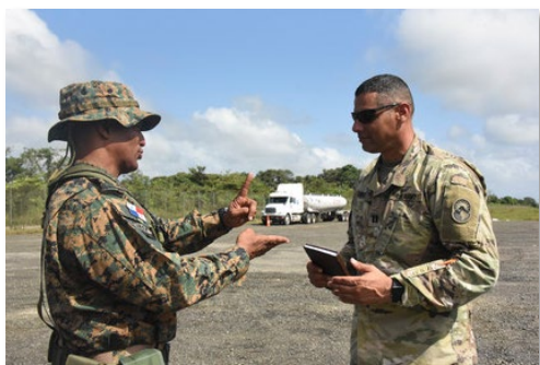
A member of JTF-Bravo’s S-SAT works alongside a host-nation exercise participant during Exercise Mercury in Panama in 2019.

One of the earliest employments of the S-SAT proper was for a capability demonstration in Managua, Nicaragua in May 2016. The event was designed to validate the ability of the ad-hoc team to rapidly deploy and provide critical, self-sustained response in coordination with partner nations. A smaller, eight-person version of the team worked alongside the Nicaraguan Civil Defense as well as more than a dozen members of the U.S. Embassy in Managua.