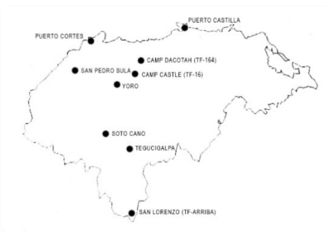
A map from 1988 showing the locations of several encampments for task forces in support of JTF-Bravo. (The Iguana)

training, the members of Task Force-16 (the provisional name given to members of Army National Guard and Reserve soldiers out of Columbus, Ohio, participating in the exercise) set about building their base camp: Camp Castle. Their work was supported by members of Task Force-Dacotah to the north.