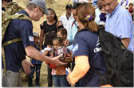
Volunteers from JTF-Bravo participate in the 80th iteration of the Chapel Hike in the mountains around Soto Cano AB in 2019.

By 2007, the event had grown to a partnership between the Soto Cano Fire Department and the chaplain's office, even starting to elicit volunteers to attend. This was a turbulent time for the task force operationally. That year saw disaster relief and medical assistance operations in Pisco, Peru following an earthquake that struck the region Aug. 15, as well as a response to the devastation left by Hurricane Felix in Puerto Cabezas, Nicaragua.