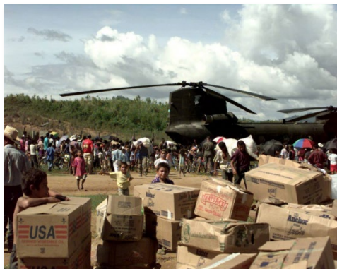
JTF-Bravo provides disaster relief in the aftermath of Hurricane Mitch in 1998

In his next (but still not final) editorial, Col. Jacoby reviewed the herculean lift of the task force, calling it JTF-Bravo's "most heroic mission." He added the total-team effort was "probably the most unprecedented active-duty, joint engineering effort that's been conducted anywhere anytime." 60 Not only did the task force's response to the hurricane validate its new mission set, it also highlighted the value of the Soto Cano airfield in enabling