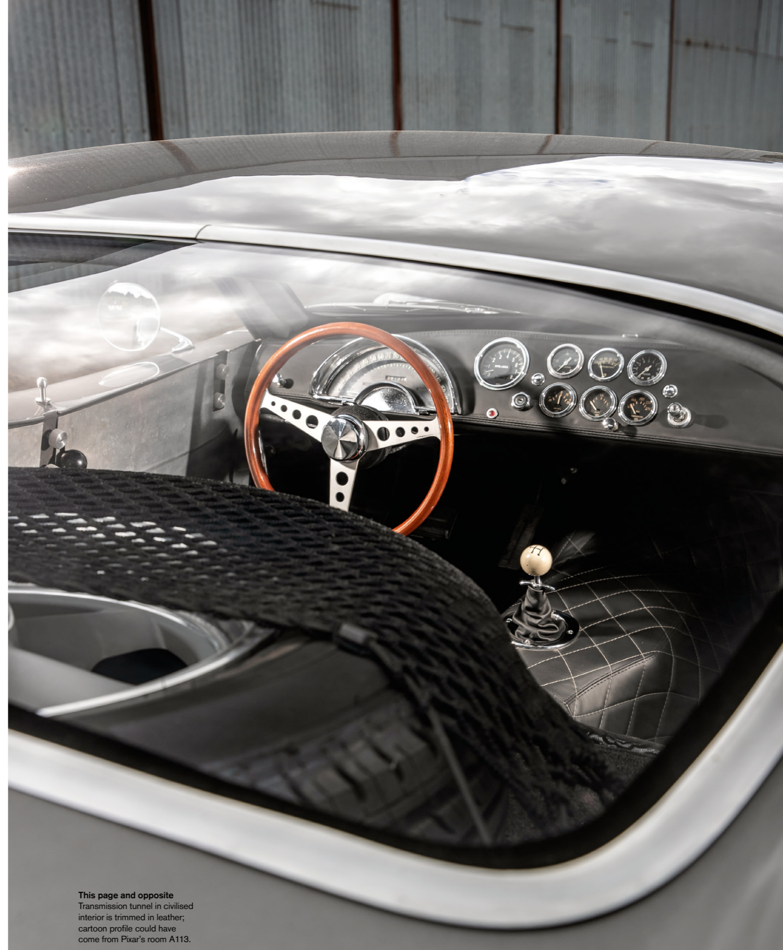
This page and opposite Transmission tunnel in civilised interior is trimmed in leather; cartoon profile could have come from Pixar's room A113.