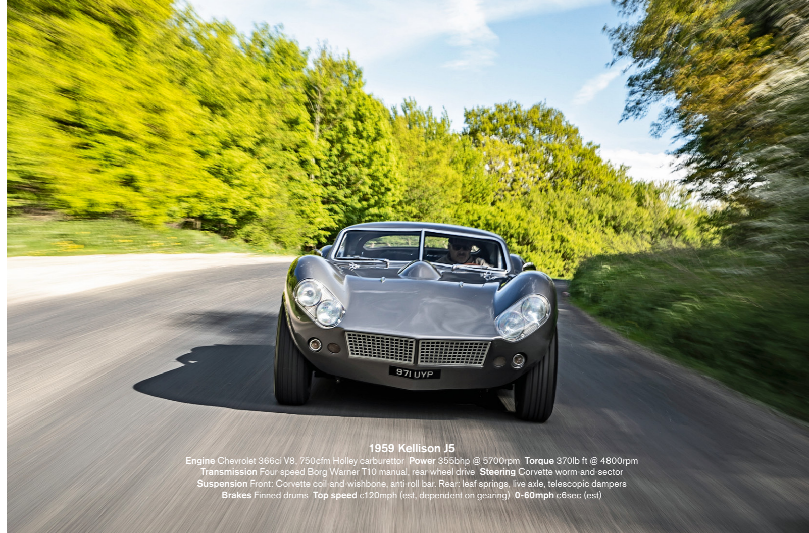
1959 Kellison J5

Right and below right From the driver's seat there's a voluptuous view and big decibels on the move; ample power comes from mighty 366ci Chevrolet V8.