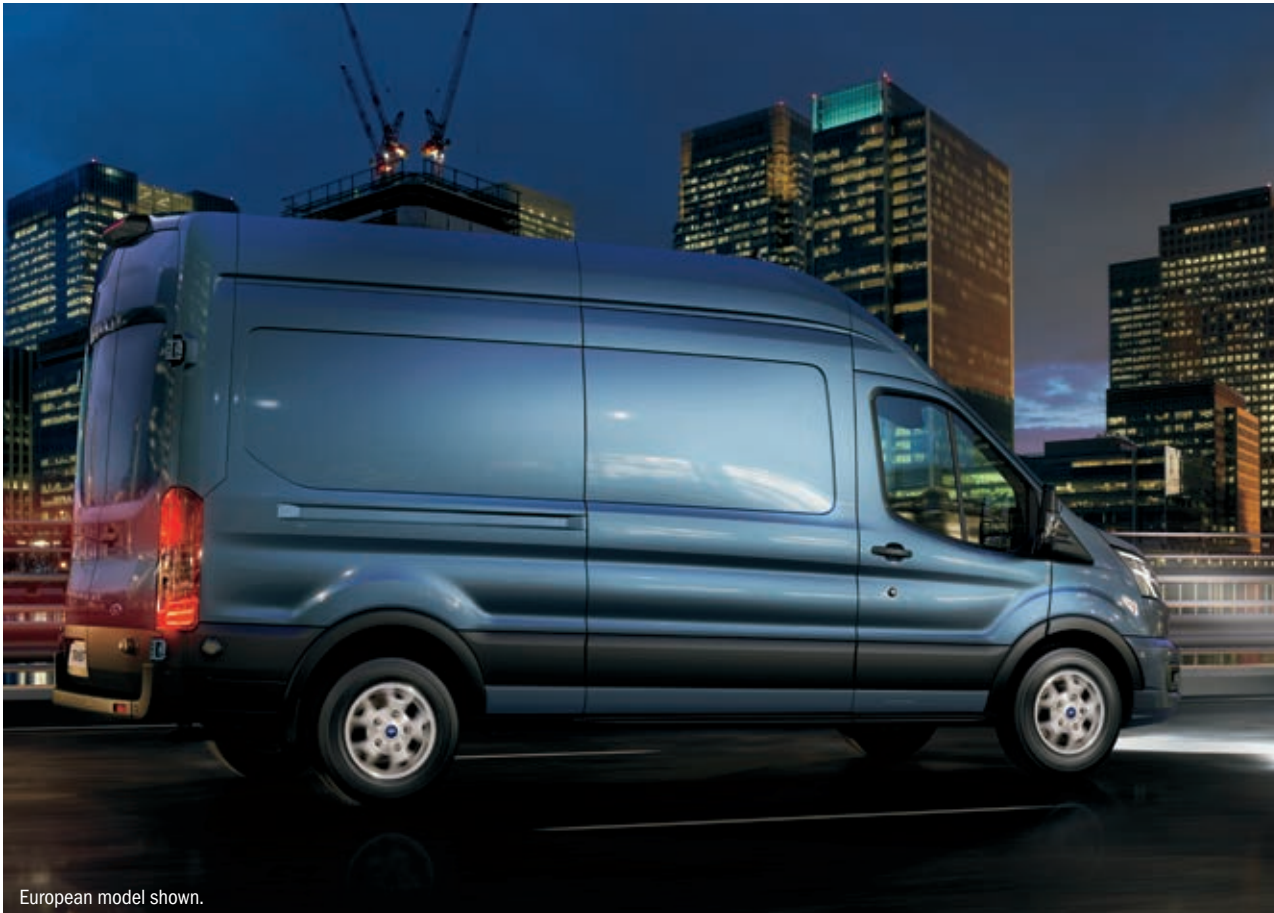
European model shown.