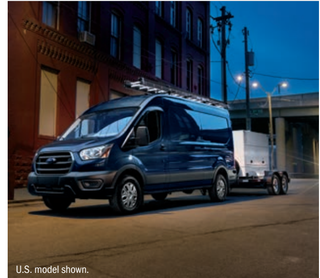
U.S. model shown.