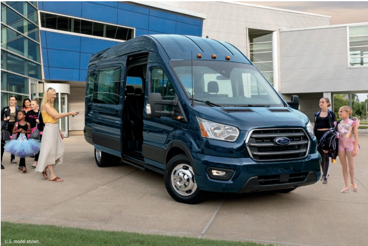
U.S. model shown.