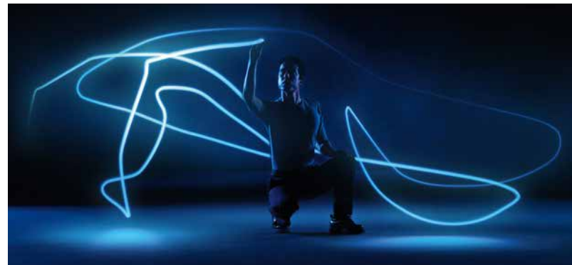
THE APPRENTICE Lexus mapped the painting motions of a master craftsman in order to duplicate the technique with robots