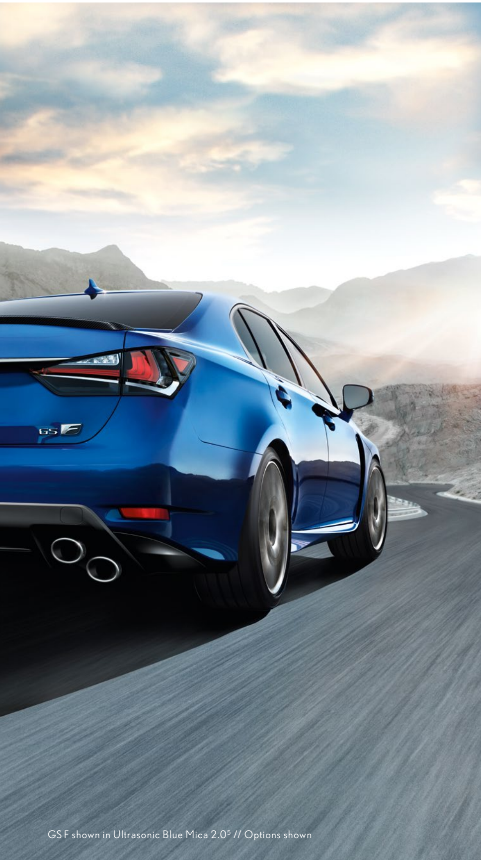
GSF shown in Ultrasonic Blue Mica 2.0 5 // Options shown