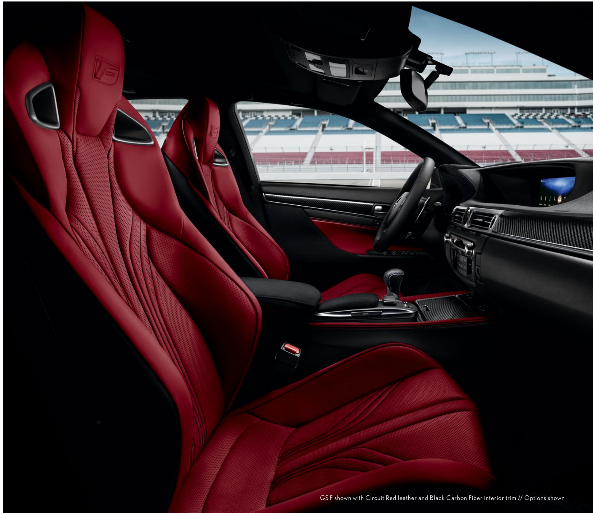
GSF shown with Circuit Red leather and Black Carbon Fiber interior trim // Options shown