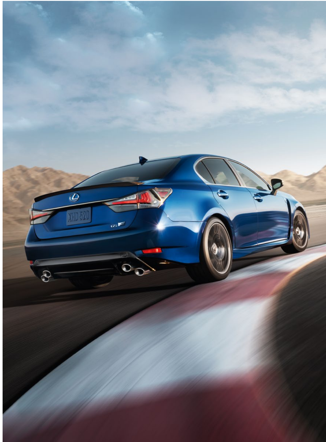
GSF shown in Ultrasonic Blue Mica 2.0 5 // Options shown

Born on the racetrack, built for the road.