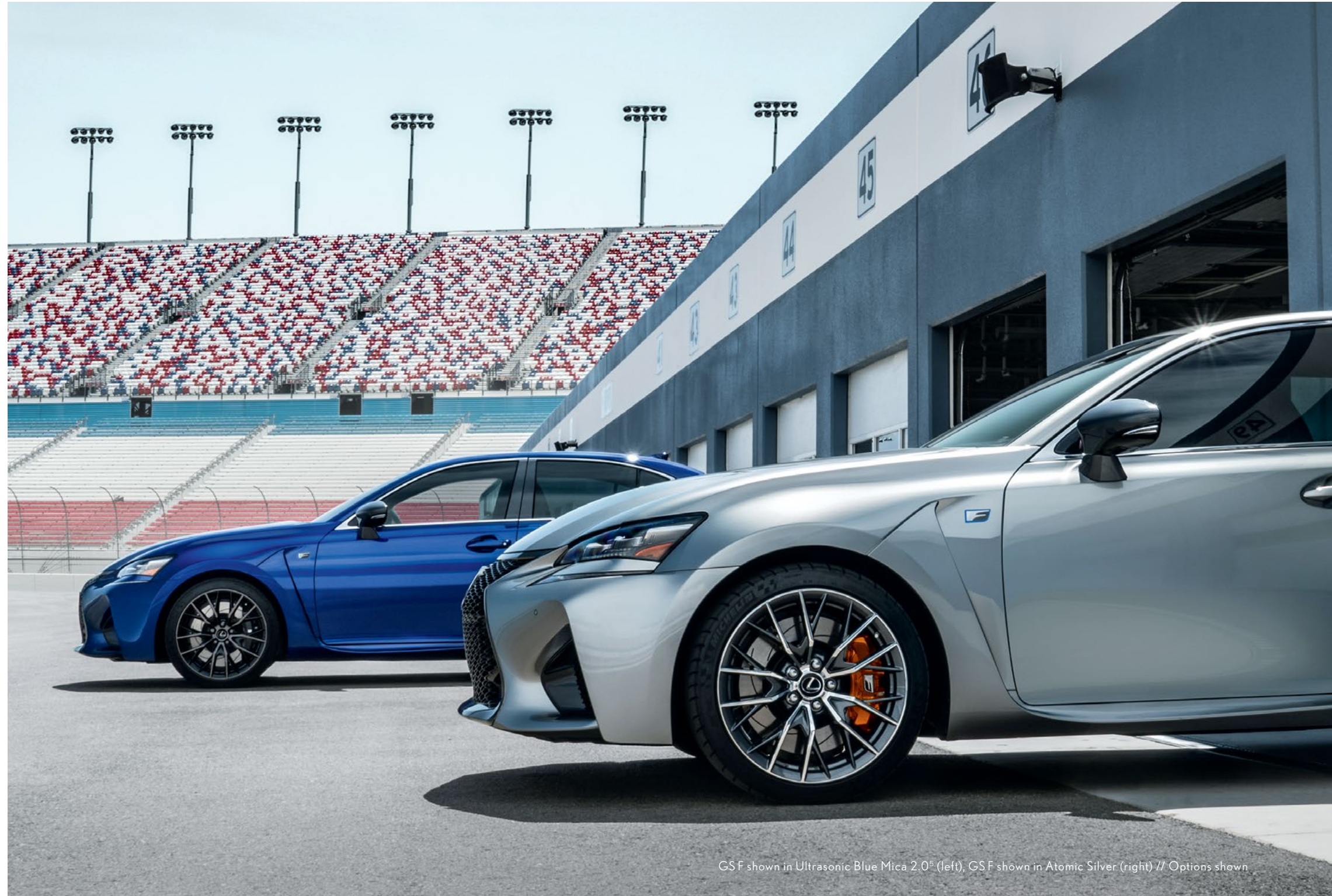
GS-F shown in Ultrasonic Blue Mica 2.0 3 (left), GS-F shown in Atomic Silver (right) // Options shown

Hand-polished split-10-spoke forged alloy wheels 4 OPTIONAL