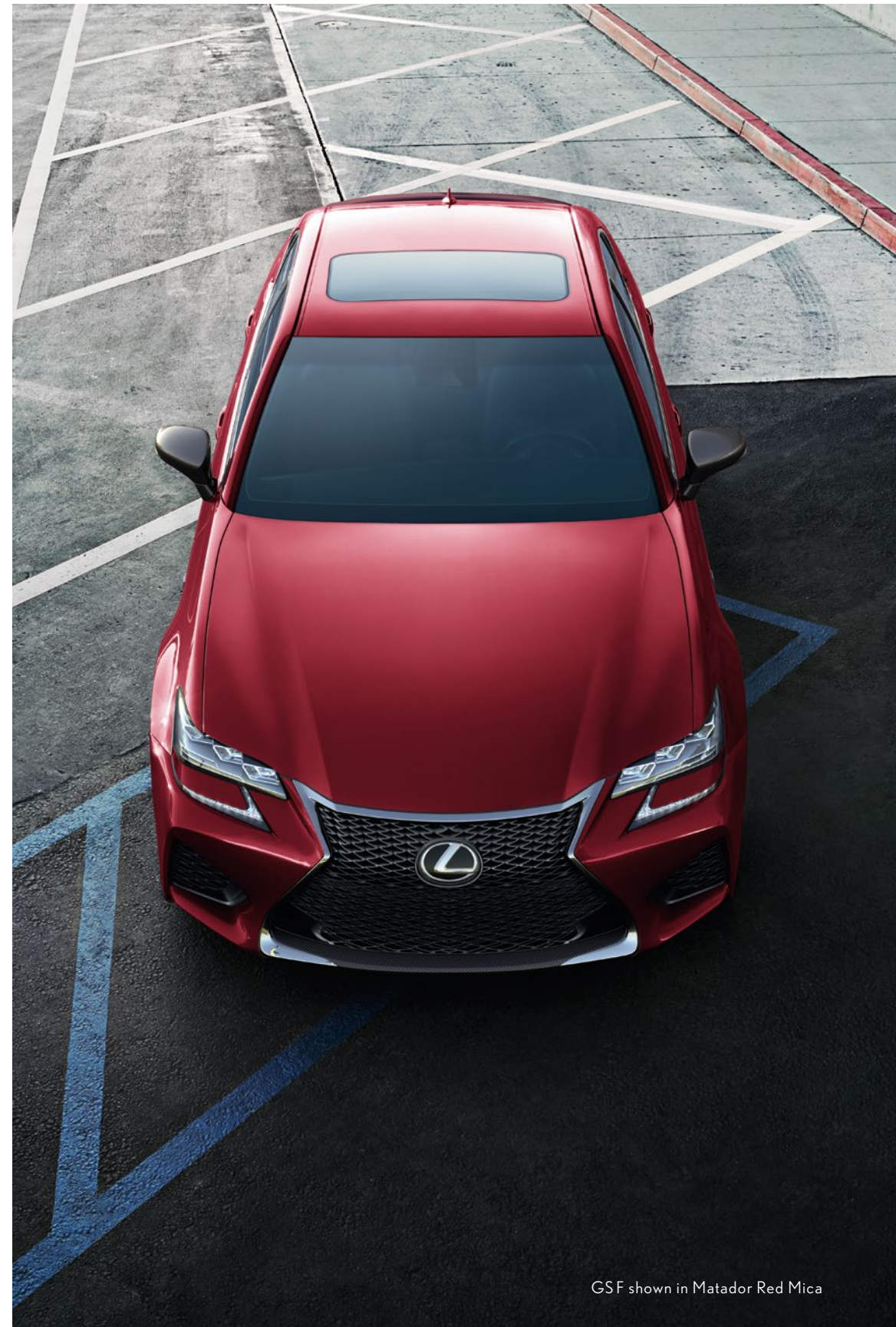
GSF shown in Matador Red Mica