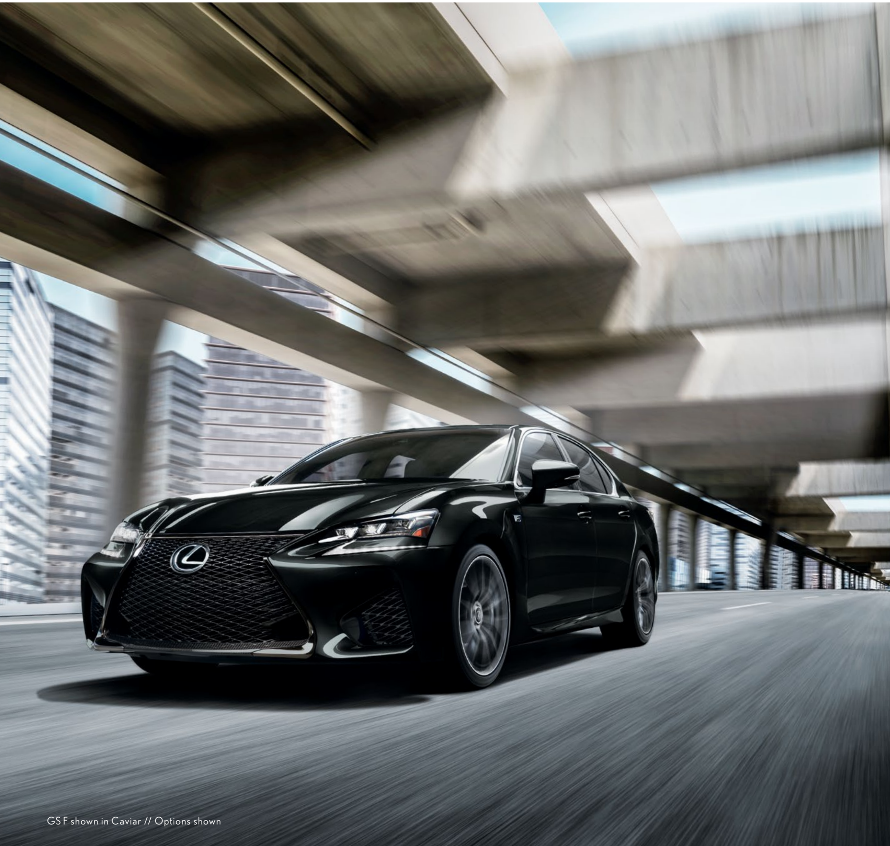
GSF shown in Caviar // Options shown