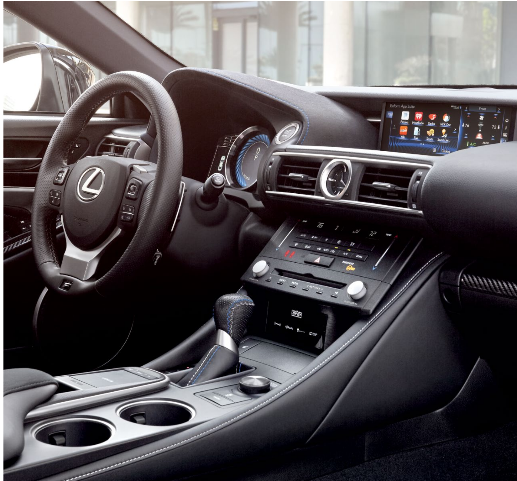
RC F shown with Black leather and Black Carbon Fiber interior trim // Options shown

Lexus Enform Service Connect 19 offers remote access to information about your vehicle's status and maintenance needs. Easily accessed through LexusDrivers.com or the Lexus Drivers mobile app, you can get information on everything from your vehicle's fuel level and mileage to maintenance alerts and Vehicle Health Reports. Service Connect is complimentary for the first 10 years of ownership.