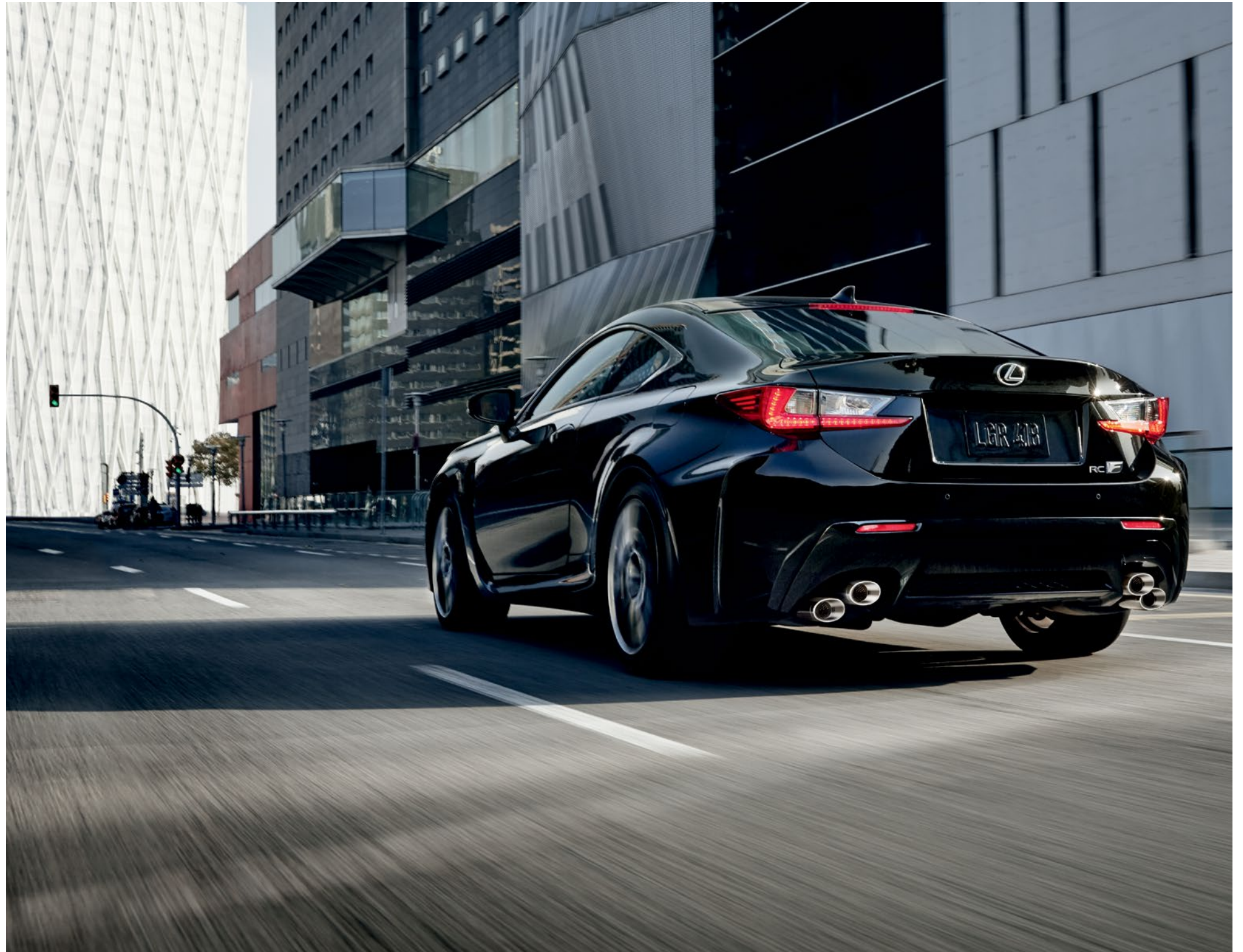
RC F shown in Caviar // Options shown