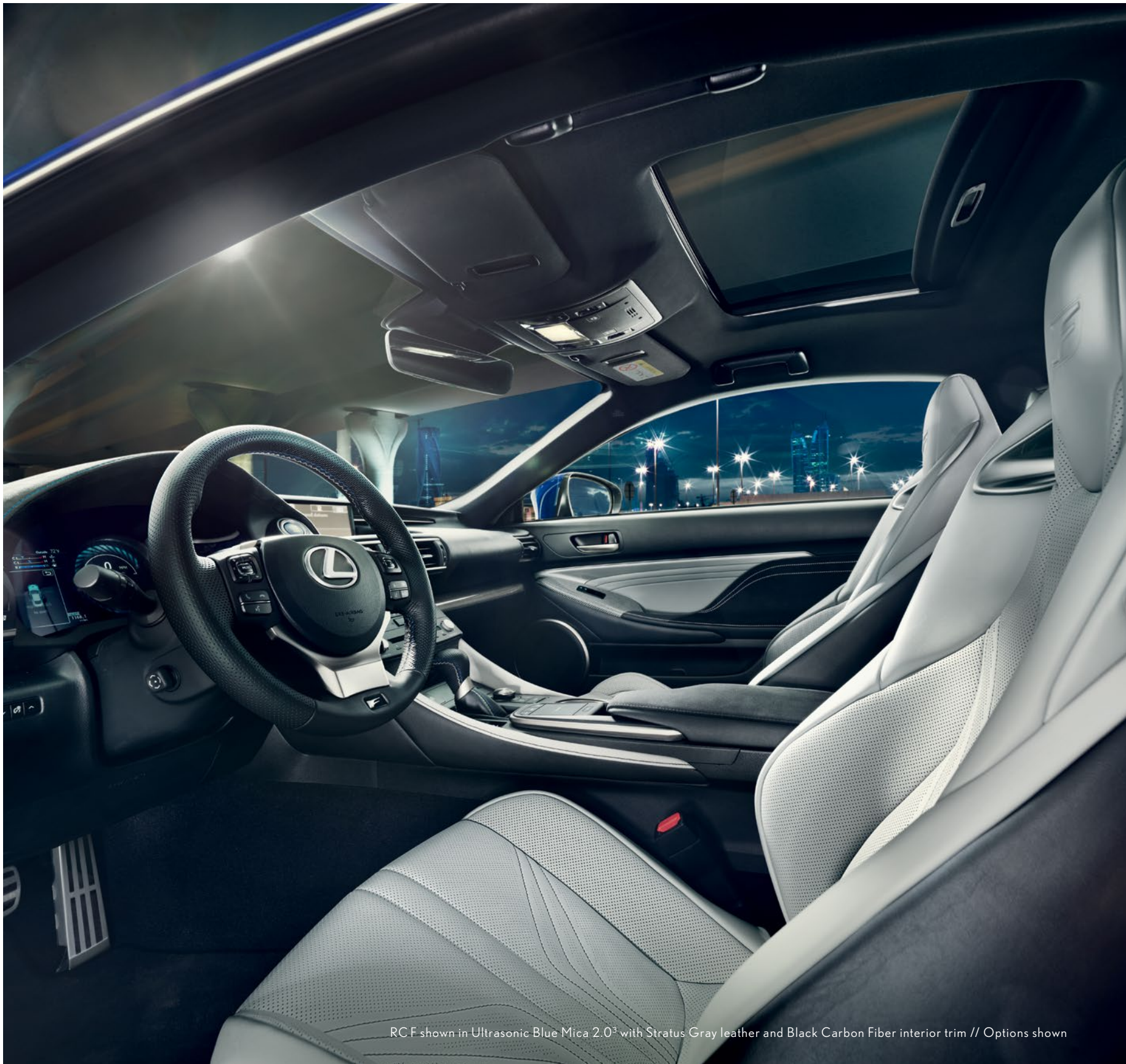
RC F shown in Ultrasonic Blue Mica 2.0 3 with Stratus Gray leather and Black Carbon Fiber interior trim // Options shown