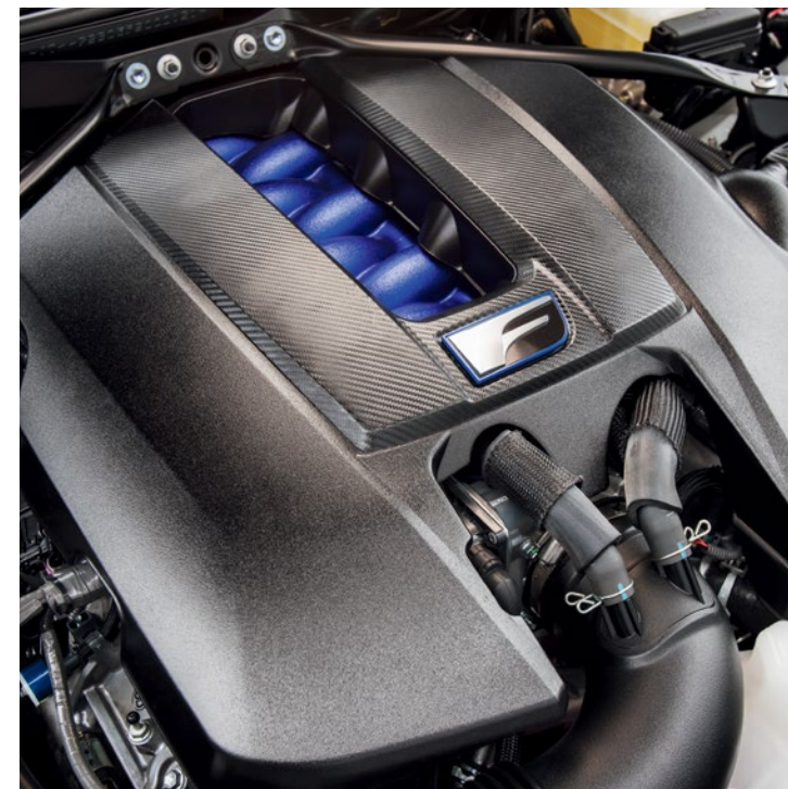
RC F shown in Ultrasonic Blue Mica 2.0 3 // Options shown

— Demands respect on the circuit. Inspires off of it.