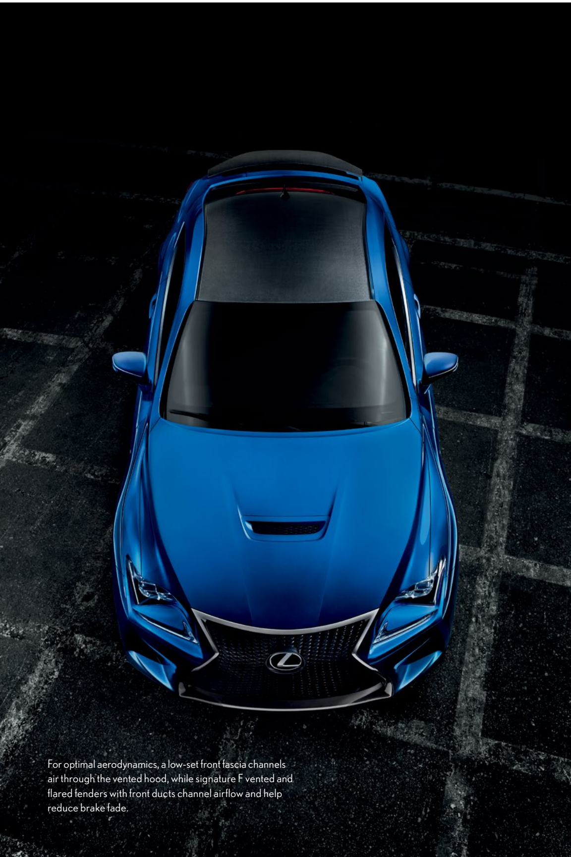
For optimal aerodynamics, a low-set front fascia channels air through the vented hood, while signature F vented and flared fenders with front ducts channel airflow and help reduce brake fade.