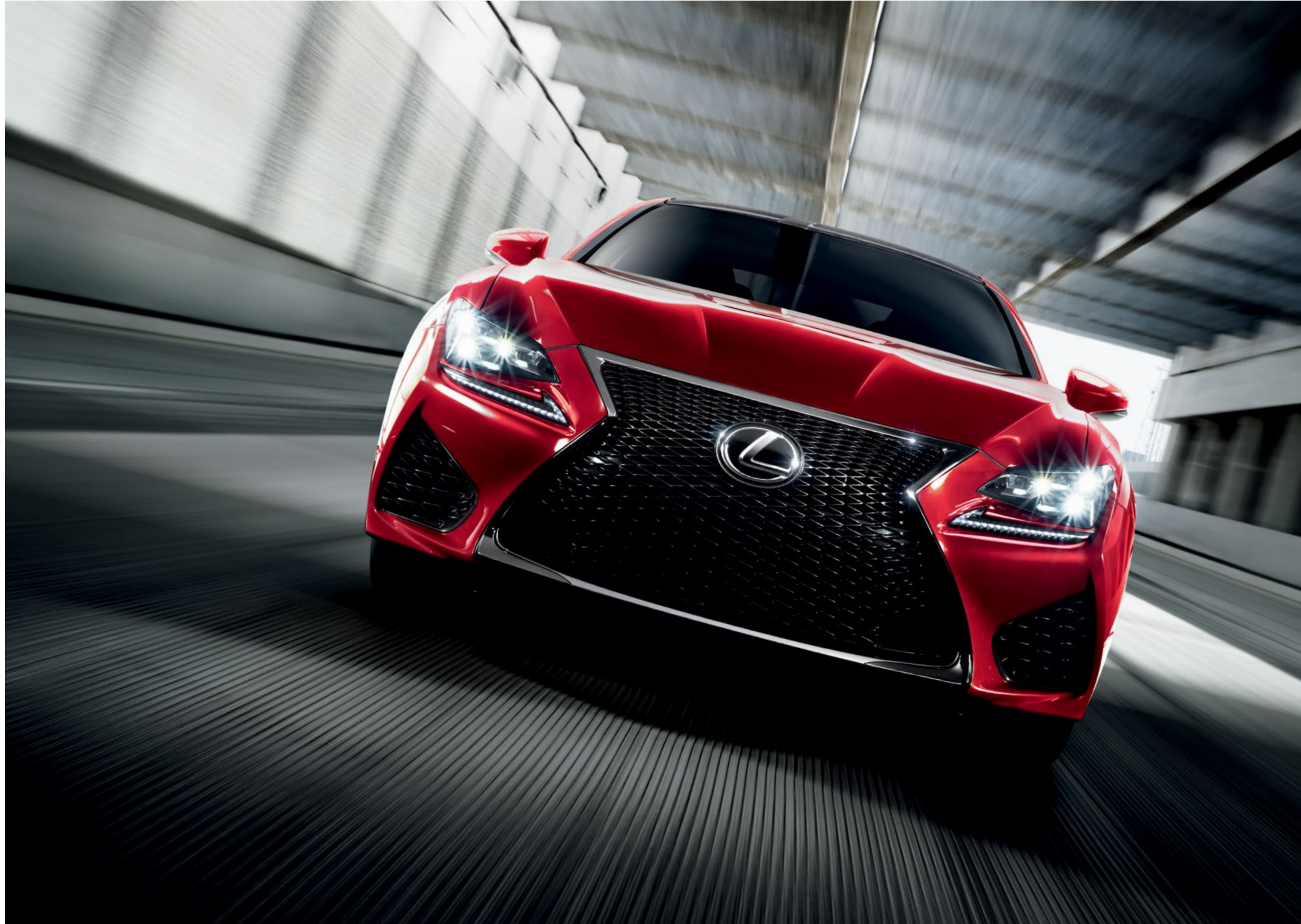
RC F shown in Infrared 3 // Options shown