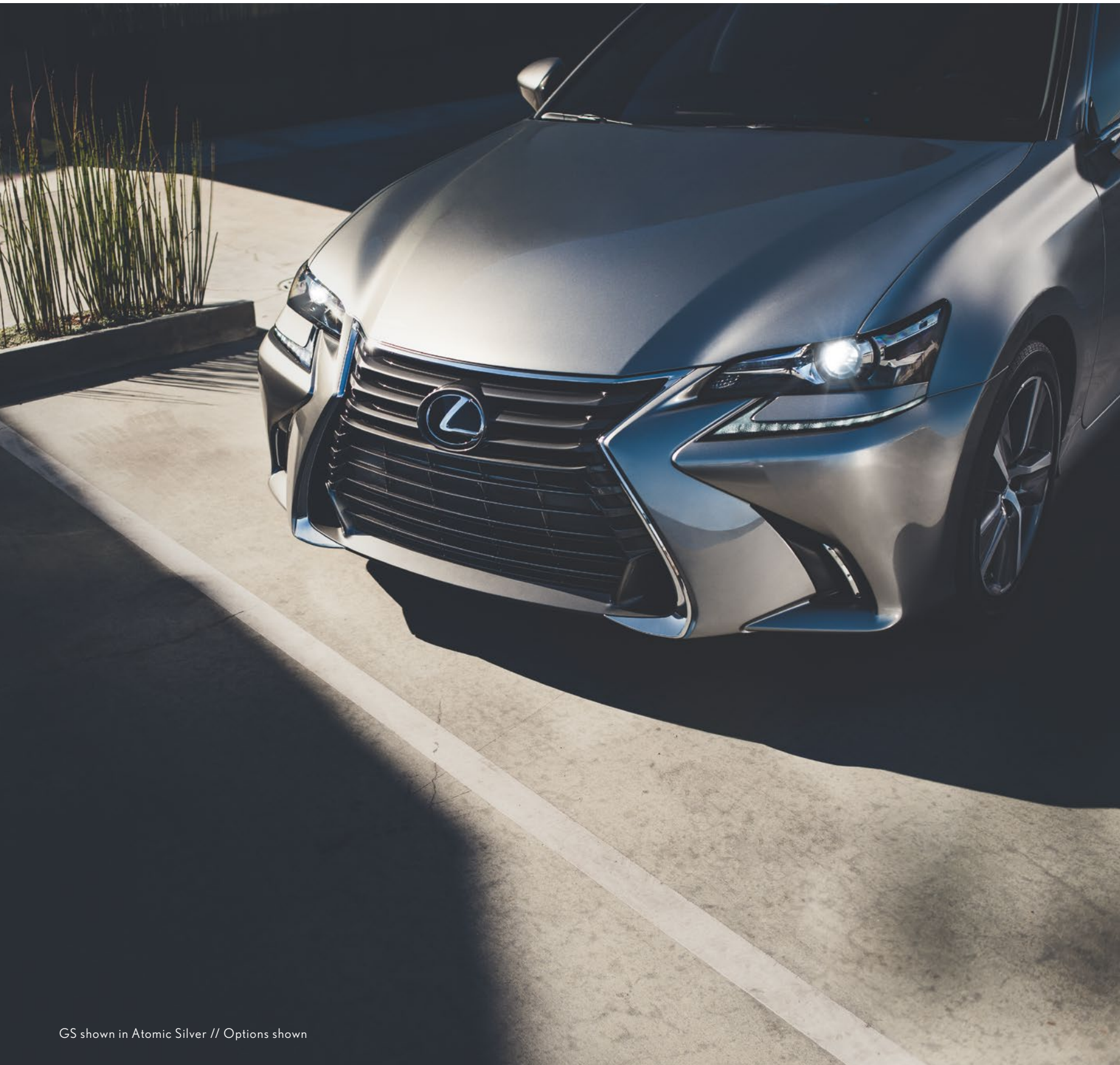
GS shown in Atomic Silver // Options shown