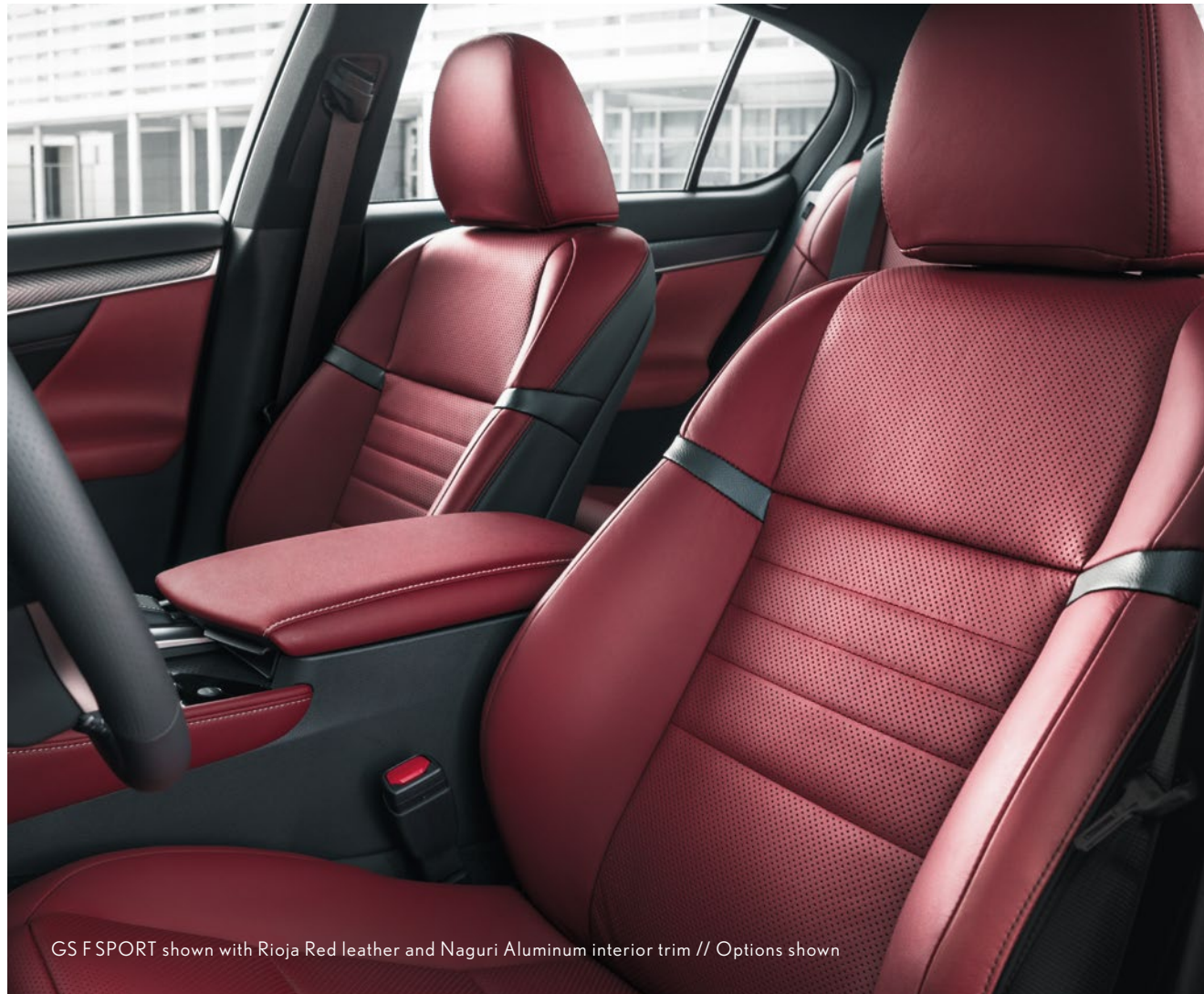
GS F SPORT shown with Rioja Red leather and Naguri Aluminum interior trim // Options shown

Open the door of the F SPORT and step into a command center with a performance pedigree. Lean into the 16-way power-adjustable driver's sport seat with power side bolsters and four-way lumbar support—all designed to grip you through every turn. A perforated leather-trimmed steering wheel, aluminum pedals and LFA-inspired instrumentation give a nod to its performance roots. And available Rioja Red leather trim with exclusive stitching and distinctive Naguri Aluminum accents answer your demand for cutting-edge design.