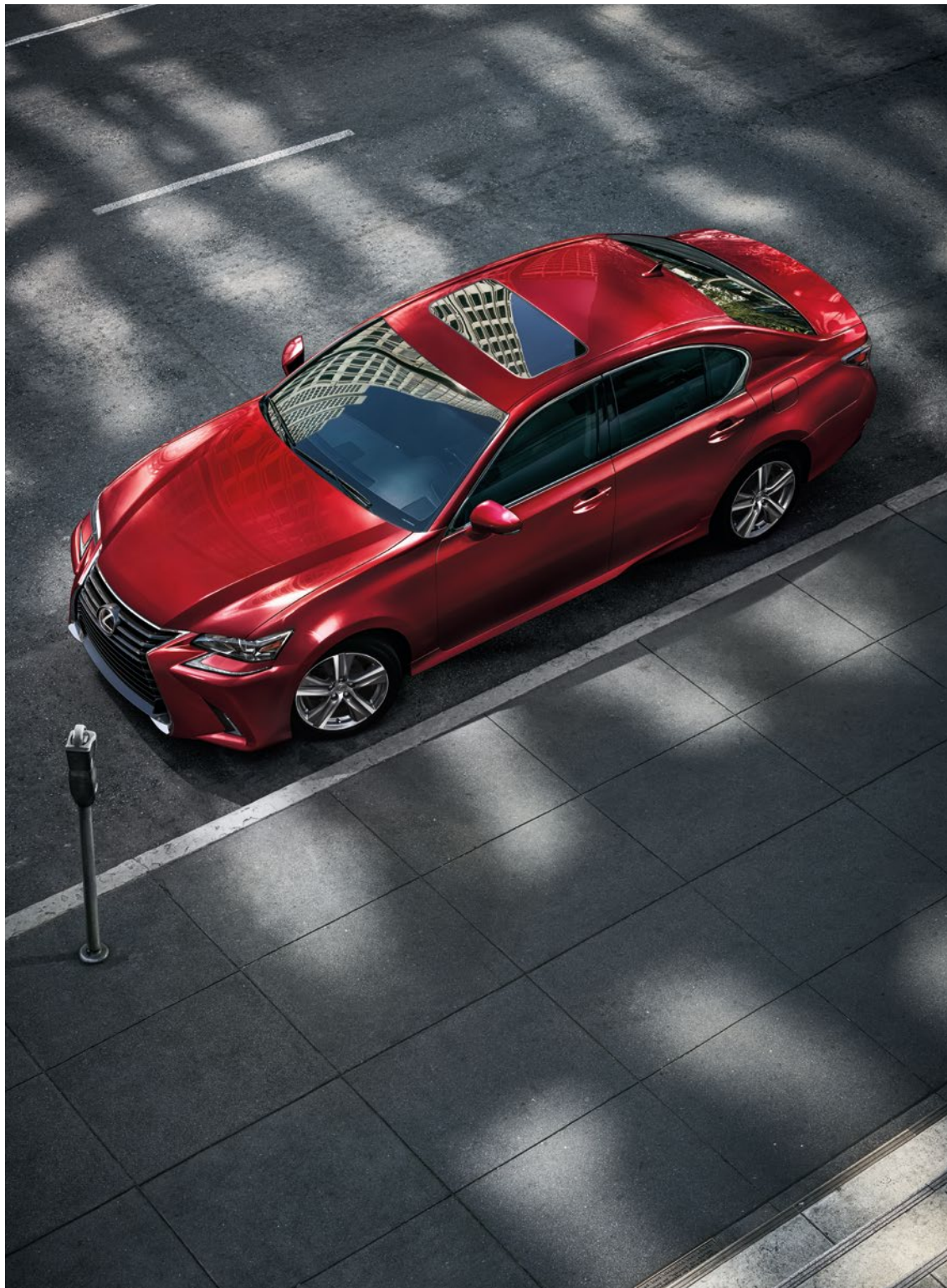
GS shown in Matador Red Mica