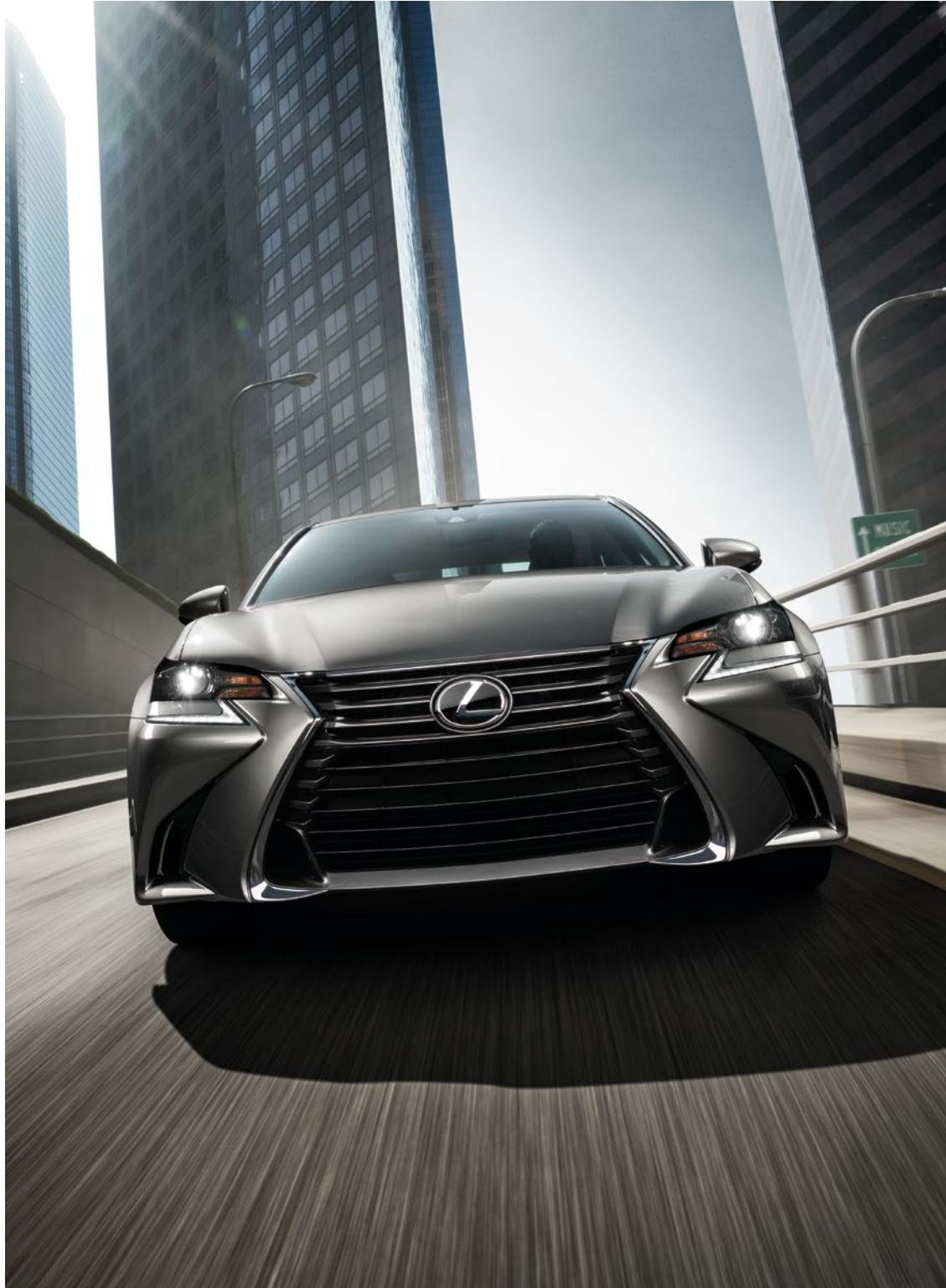
GS shown in Atomic Silver