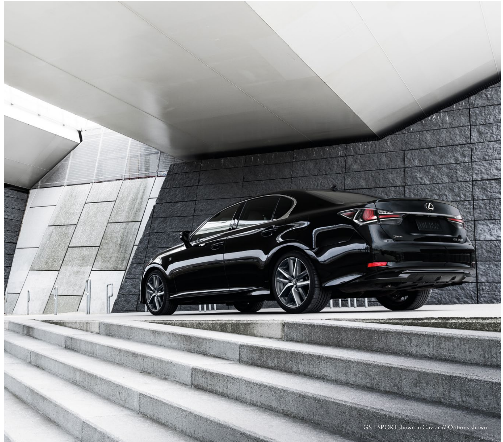
GS F SPORT shown in Caviar // Options shown

F SPORT split-nine-spoke forged alloy wheels 3,36 AVAILABLE GS F SPORT