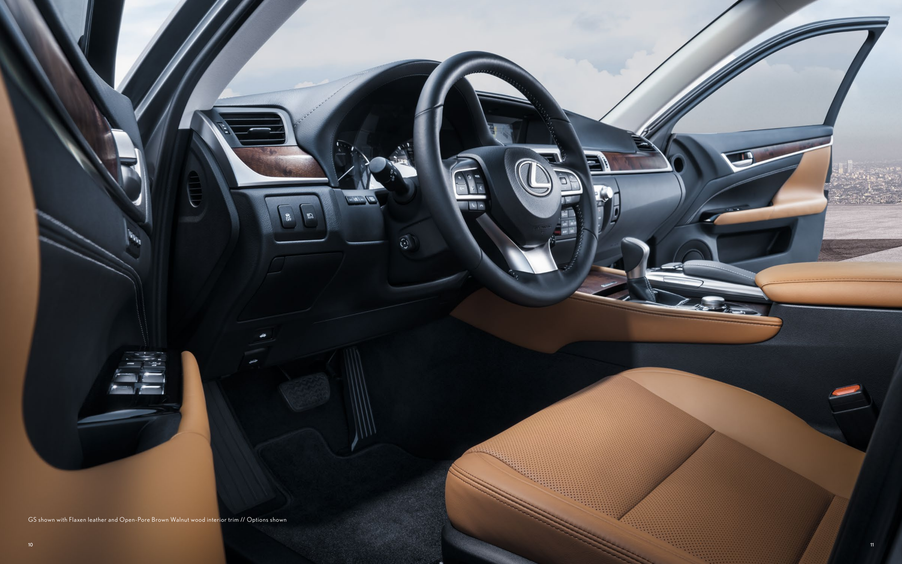
GS shown with Flaxen leather and Open-Pore Brown Walnut wood interior trim // Options shown