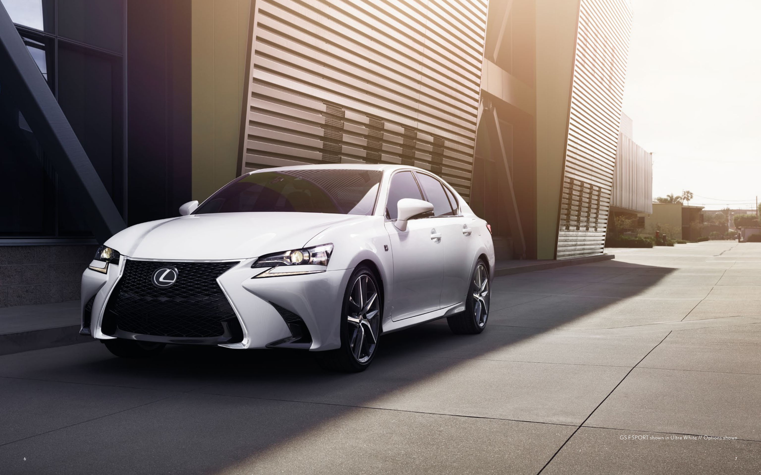
GSF SPORT shown in Ultra White // Options shown