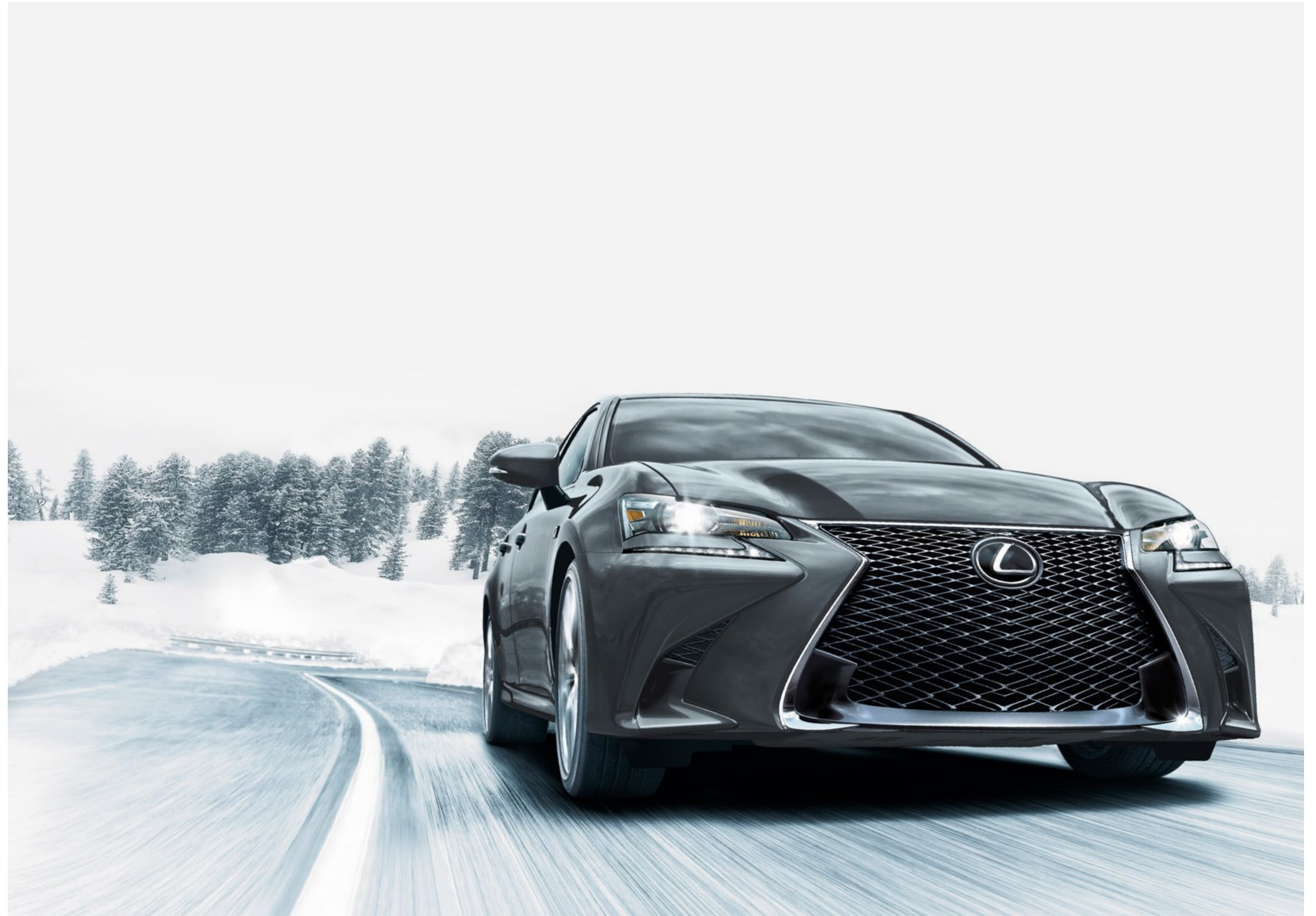
GS F SPORT shown in Smoky Granite Mica // Options shown

Available on the GS 350 and GS 350 F SPORT models, all-wheel drive (AWD) helps ensure a balanced delivery of power, even in inclement weather. By monitoring current driving conditions, AWD automatically allocates engine power between the front and rear wheels from a rear-biased 30/70 (front/rear) torque split to 50/50.