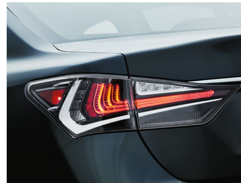
GS FSPORT shown in Obsidian // Options shown

— Muscular styling makes an aggressive statement. With an exclamation point.