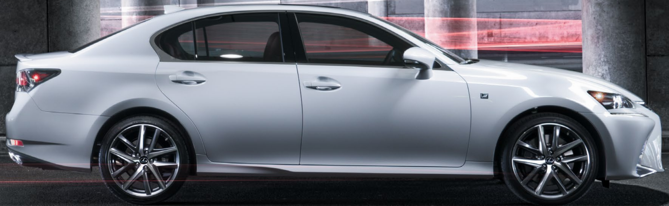
GS F SPORT shown in Ultra White // Options shown