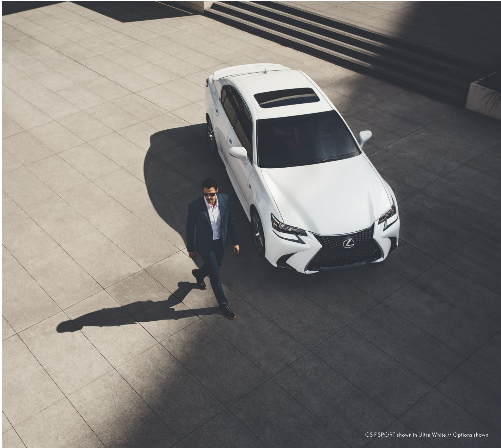
GS F SPORT shown in Ultra White // Options shown