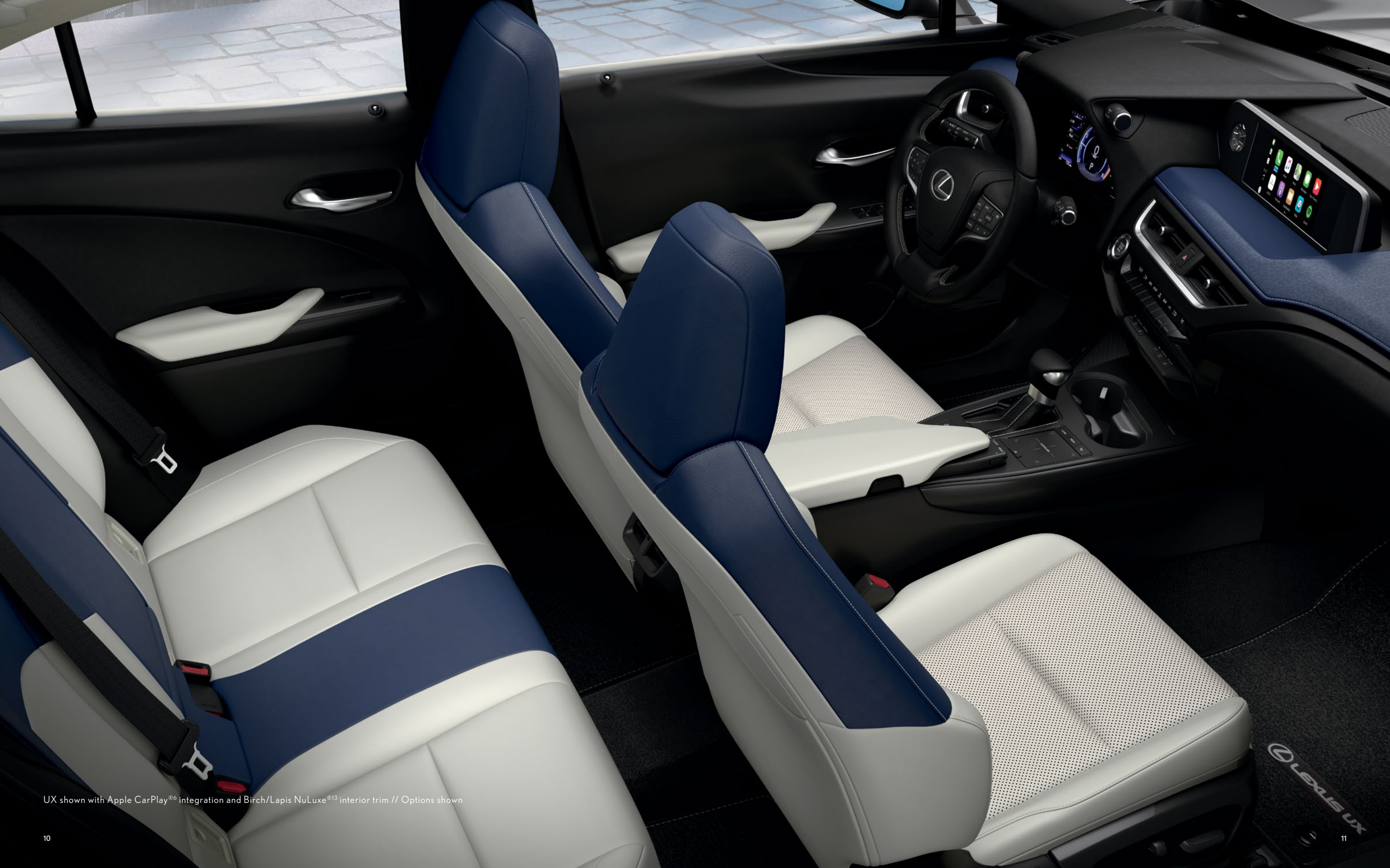
UX shown with Apple CarPlay ® integration and Birch/Lapis NuLuxe ® interior trim // Options shown