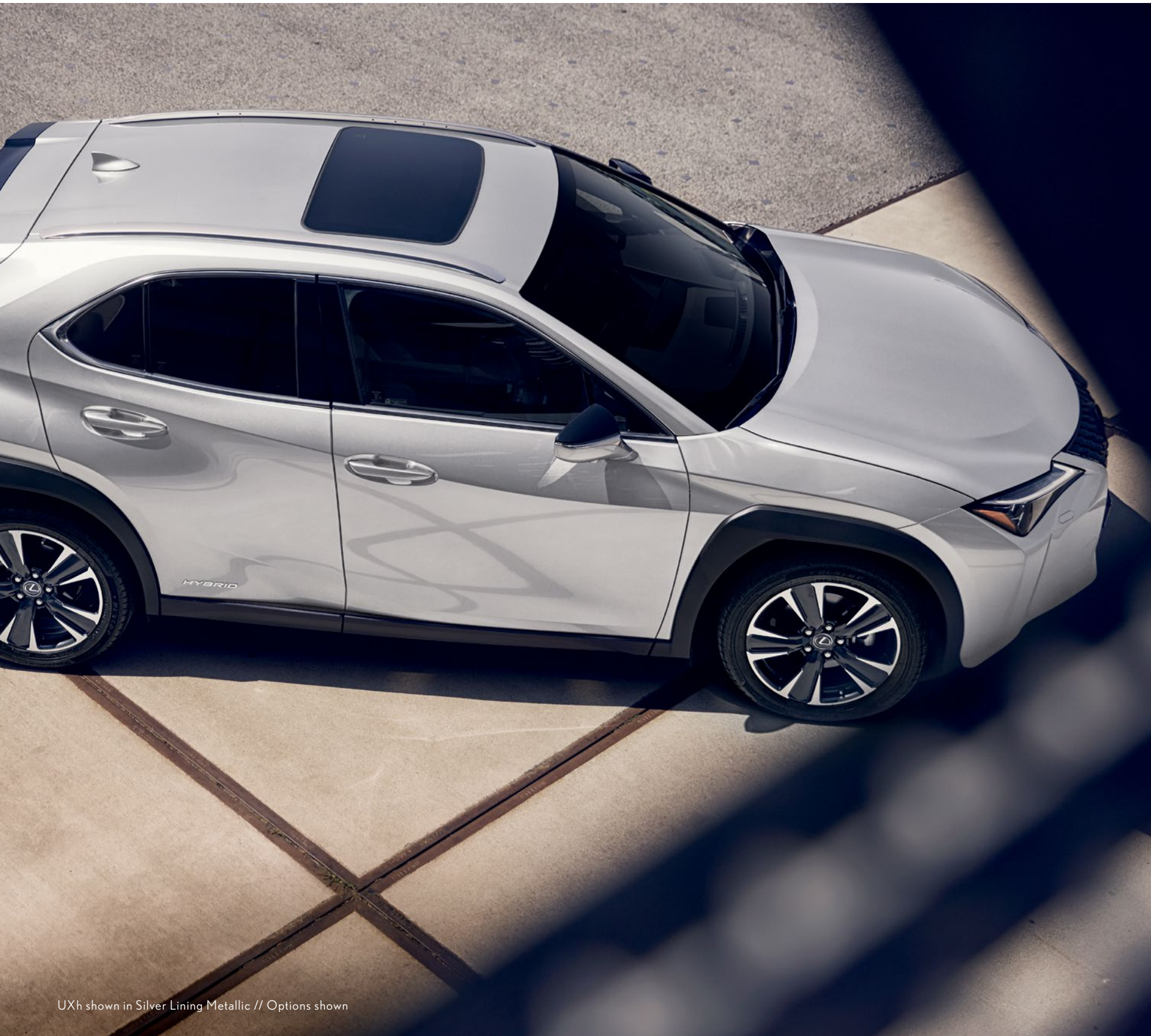
UXh shown in Silver Lining Metallic // Options shown