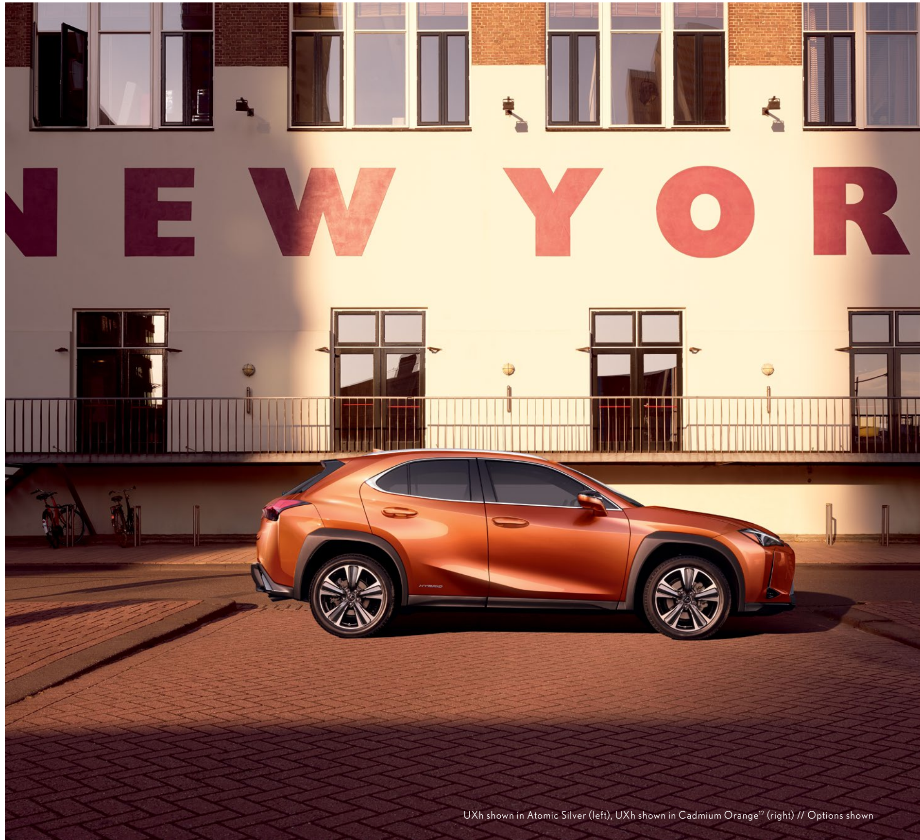
UXh shown in Atomic Silver (left), UXh shown in Cadmium Orange 12 (right) // Options shown