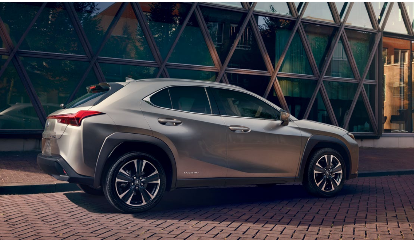
UXh shown in Atomic Silver with Glazed Caramel NuLuxe interior trim // Options shown

Featuring generous rear legroom and 60/40-split folding rear seats, the UX also offers additional compartments in the cargo area, as well as a 110V power outlet, wireless charger and four USB 17 ports throughout the cabin. This is versatility fit for the modern explorer.