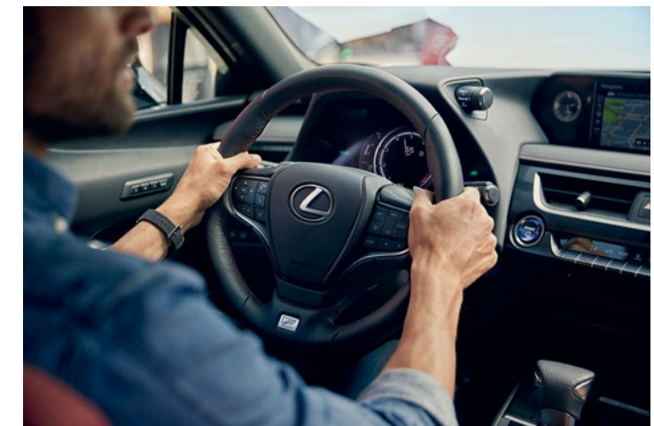
UXh F SPORT shown in Ultra White // Options shown