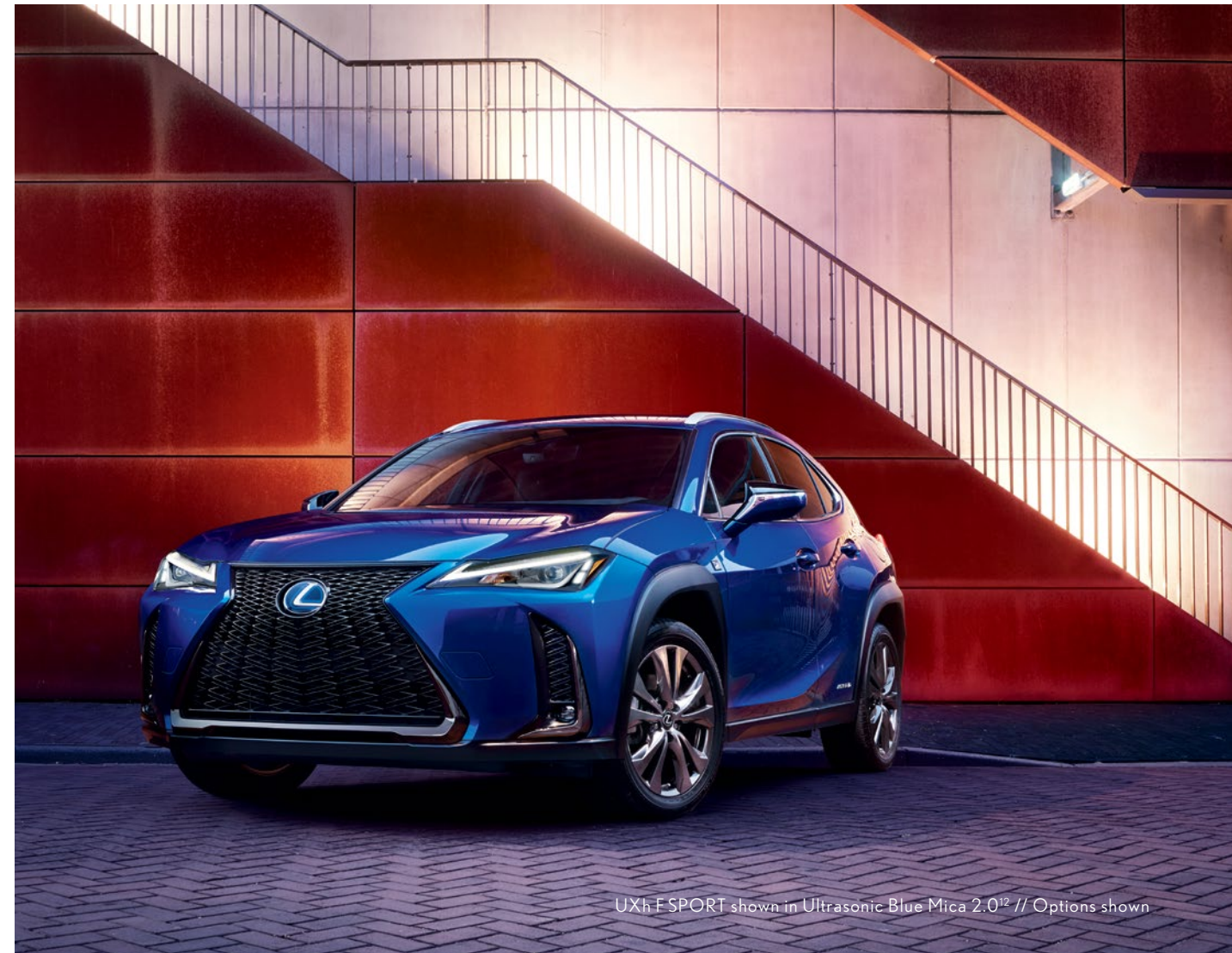
UXh F SPORT shown in Ultrasonic Blue Mica 2.0 12 // Options shown

The all-new UX 200 boasts a dynamic 2.0-liter four-cylinder engine with a new 10-speed Direct-Shift Continuously Variable Transmission. This first-of-its-kind technology 2 delivers more responsive acceleration, on-demand torque and the feel of a gear-driven transmission—all while maximizing fuel efficiency.