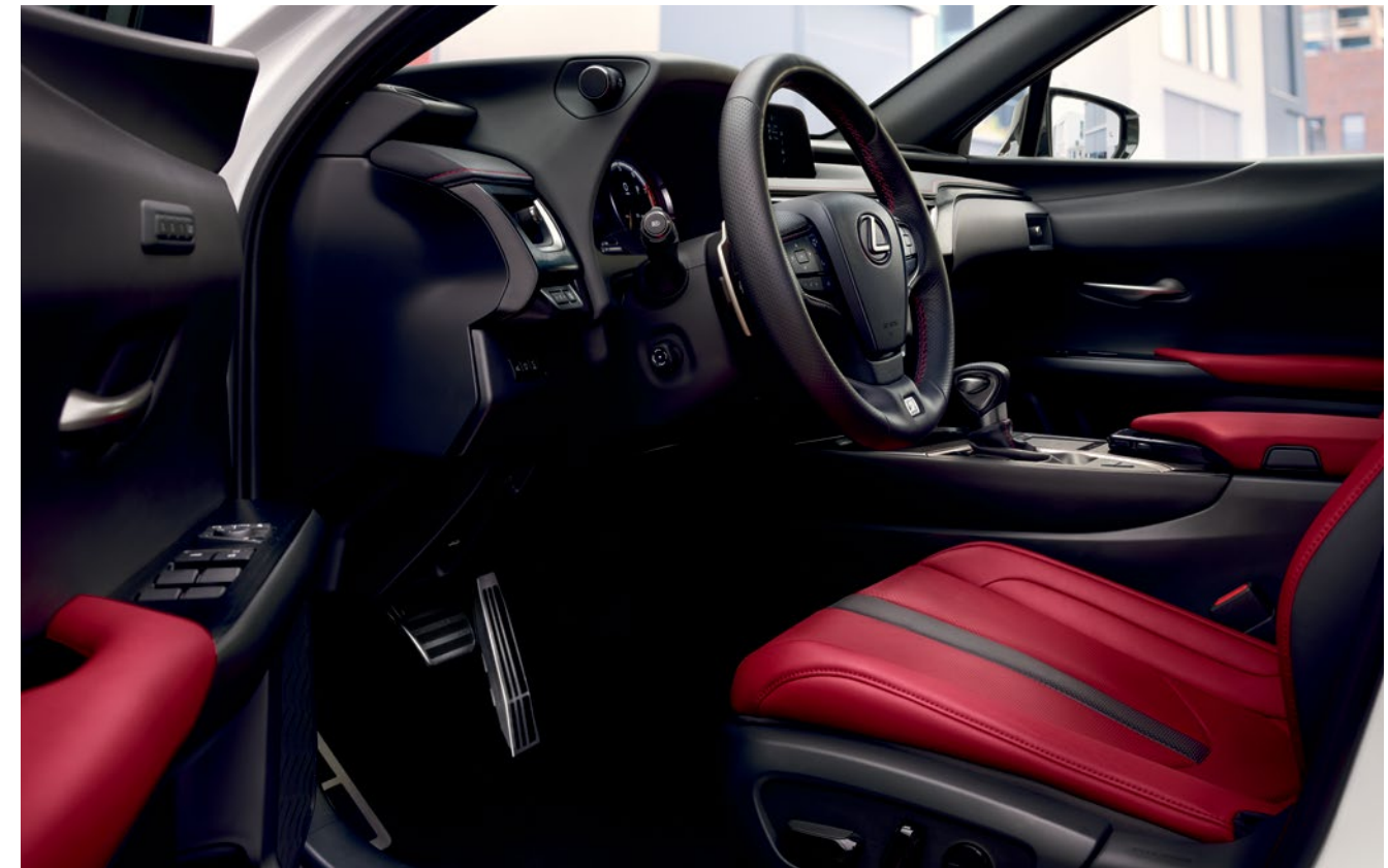
UX F SPORT shown with Circuit Red NuLuxe ®13 interior trim // Options shown