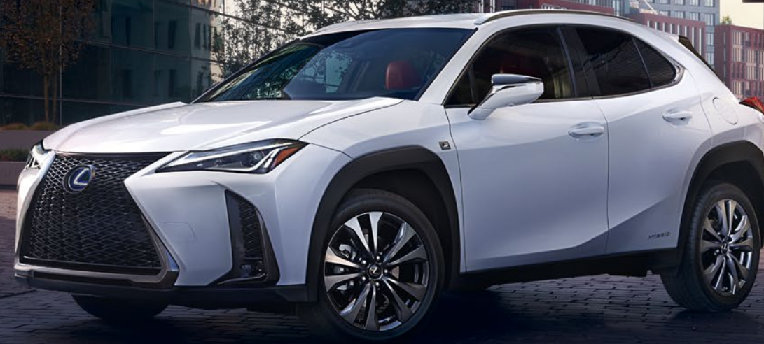
UXh shown in Nori Green Pearl (left), UX shown in Atomic Silver (middle), UXh F SPORT shown in Ultra White (right) // Options shown