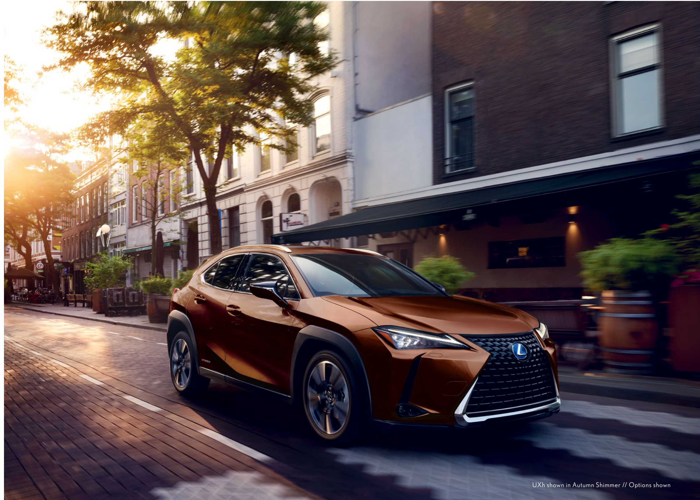
UXh shown in Autumn Shimmer // Options shown

can send up to 80% of the power to the rear wheels