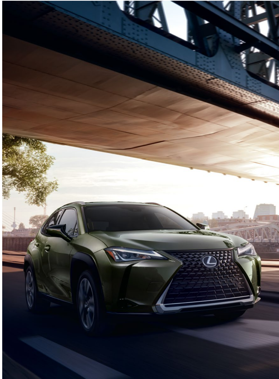
UX shown in Nori Green Pearl // Options shown

From the versatile UX 250h to the nimble F SPORT models, the UX offers numerous ways to get the most out of every mile.