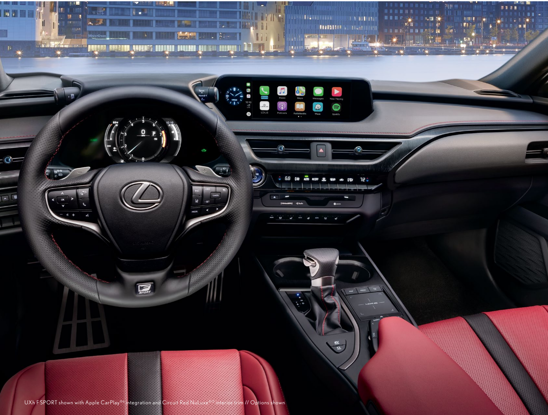
UXh F SPORT shown with Apple CarPlay ®6 integration and Circuit Red NuLuxe ®13 interior trim // Options shown