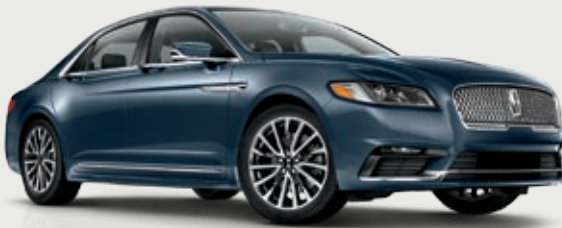
19" Premium Dark Stainless-Painted Aluminum with Chrome Inserts SELECT