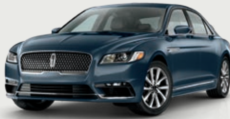
18" Premium Magnetic-Painted Aluminum BASE/PREMIERE