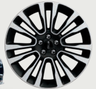
20" Polished Aluminum with Dark Tarnish-Painted Pockets SELECT/RESERVE Optional