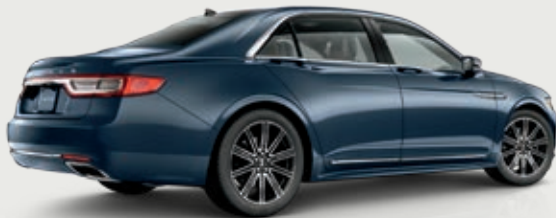
19" Polished Aluminum with Premium Ebony-Painted Pockets RESERVE with 2.7-liter