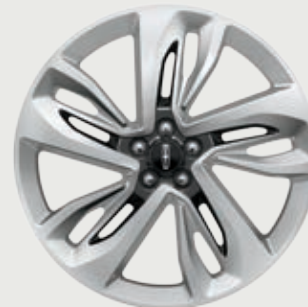
21" Polished Aluminum RESERVE Optional