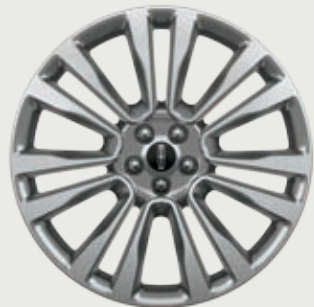
21" Premium Painted and Bright-Machined Aluminum RESERVE Optional