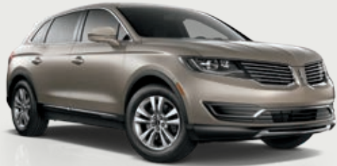
18" Painted Aluminum BASE/PREMIERE / SELECT & RESERVE 1 Available