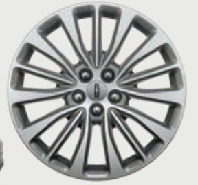
18" Premium Painted Aluminum SELECT