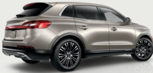
20" Premium Painted and Bright-Machined 20-Spoke Aluminum RESERVE (FWD models; AWD with 3.7-liter)