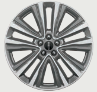
20" Premium Painted and Bright-Machined 10-Spoke Aluminum RESERVE (AWD with 2.7-liter)