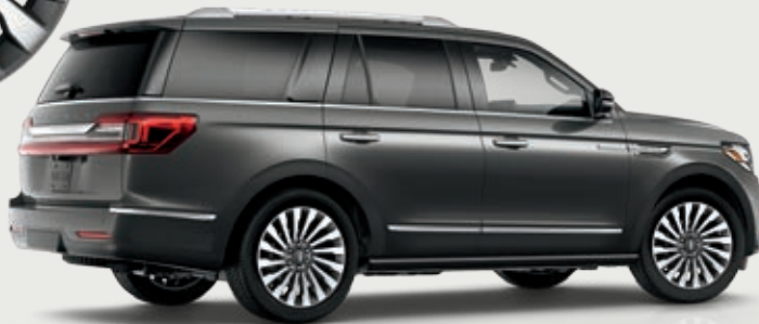
22" 16-Spoke Ultra Bright Machined Aluminum with Dark Tarnish-Painted Pockets RESERVE