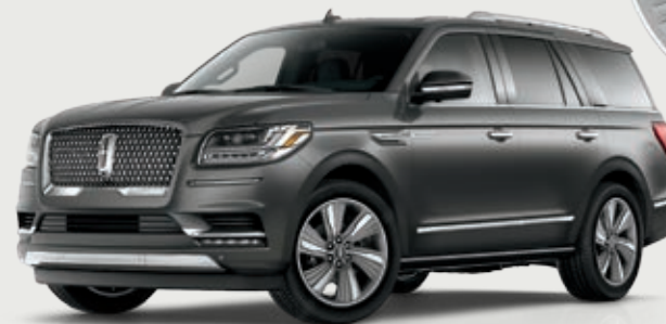
22" 6-Spoke Ultra Bright Machined Aluminum with Premium Painted Pockets and Satin Finish SELECT & RESERVE Optional