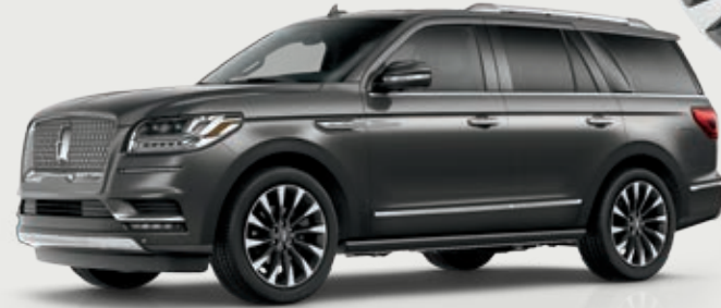
22" 12-Spoke Ultra Bright Machined Aluminum with Dark Tarnish-Painted Pockets SELECT