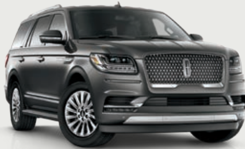
20" 14-Spoke Ultra Bright Machined Aluminum with Painted Pockets BASE/PREMIERE