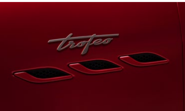
Ghibli Trofeo - Side air vents and Trofeo Badge