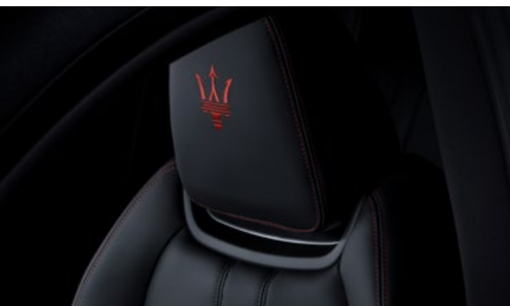
Ghibli - Headrest detail