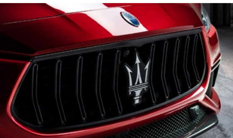
Ghibli Trofeo - Grille

Live audacious. Drive with character. Stand out in just 4 seconds with the ultimate Maserati Ghibli Trofeo. With 580 hp and a top speed of 203 mph. The Trofeo is the most powerful Ghibli ever. Your bold statement that redefines the art of possible. The striking coupé look of the Ghibli, intensified by race-inspired design elements. High-gloss Carbon fiber on the front, the rear and on side air intakes, and the sculpted Trofeo bonnet with air extractors give you just a taste of what awaits as you grab its steering wheel. That's how Ghibli Trofeo came to life. Born from race, enhanced by comfort with an innate sense for timeless beauty.