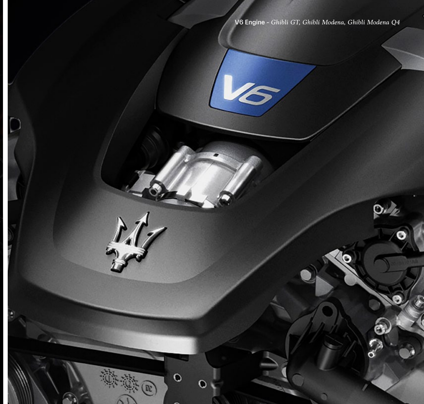
V6 Engine - Ghibli GT, Ghibli Modena, Ghibli Modena Q4