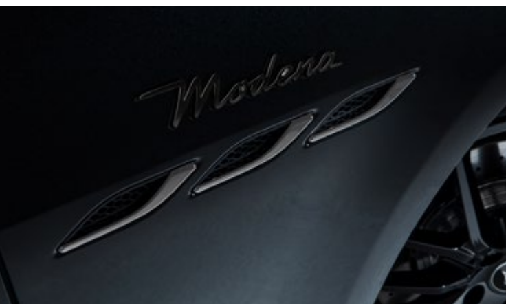
Ghibli - Side air vents and Modena Badge