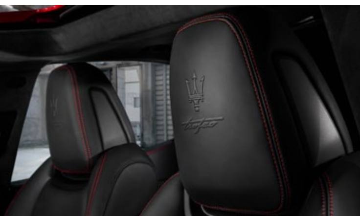
Ghibli Trofeo - Headrest detail