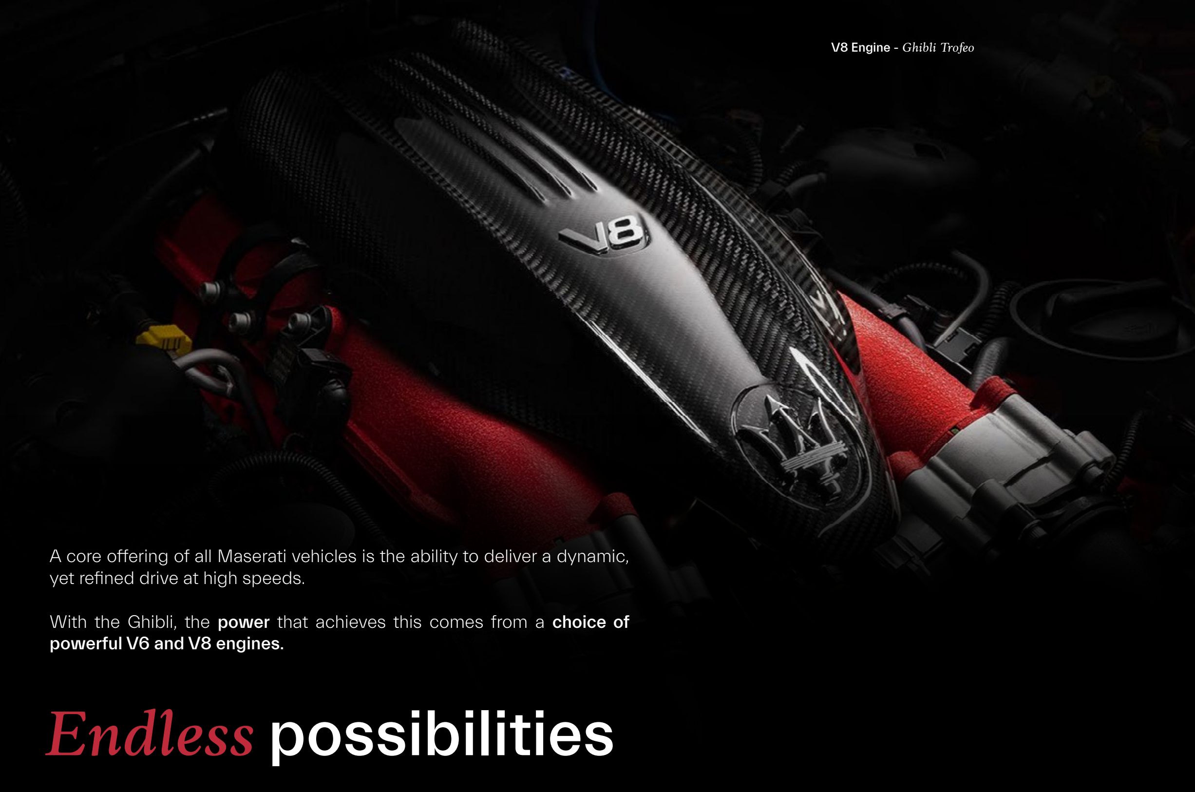
V8 Engine - Ghibli Trofeo

A core offering of all Maserati vehicles is the ability to deliver a dynamic, yet refined drive at high speeds.