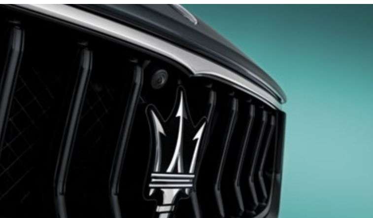
Ghibli - Grille