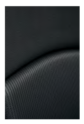
Black Cloth Sport