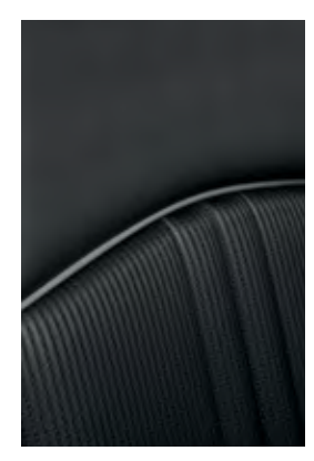
Black Leatherette with cloth inserts Touring