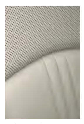
Parchment Leather Grand Touring