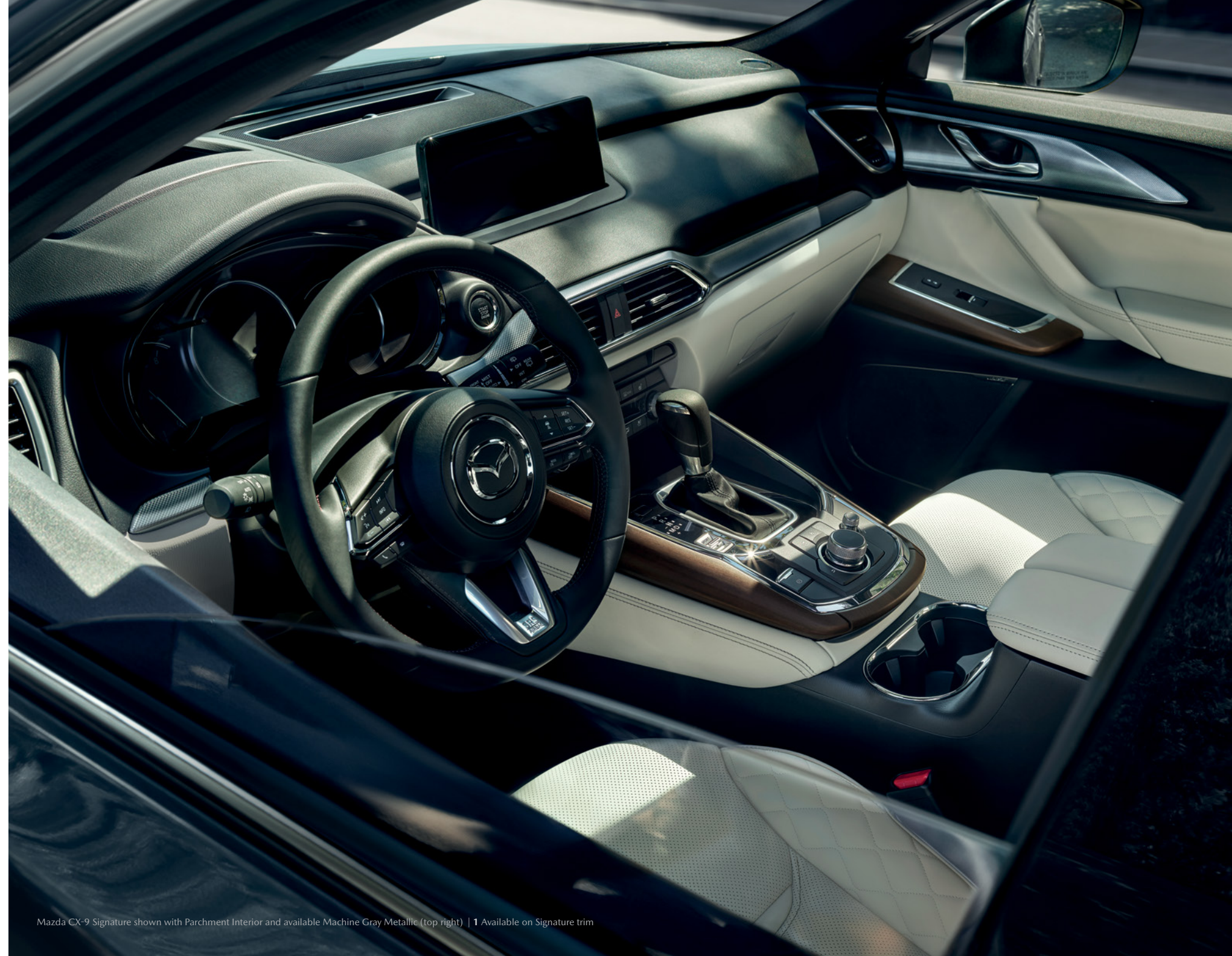
Mazda CX-9 Signature shown with Parchment Interior and available Machine Gray Metallic (top right) | 1 Available on Signature trim