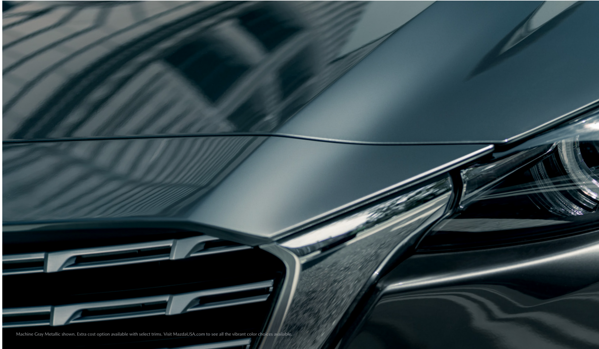
Machine Gray Metallic shown. Extra cost option available with select trims. Visit MazdaUSA.com to see all the vibrant color choices available.