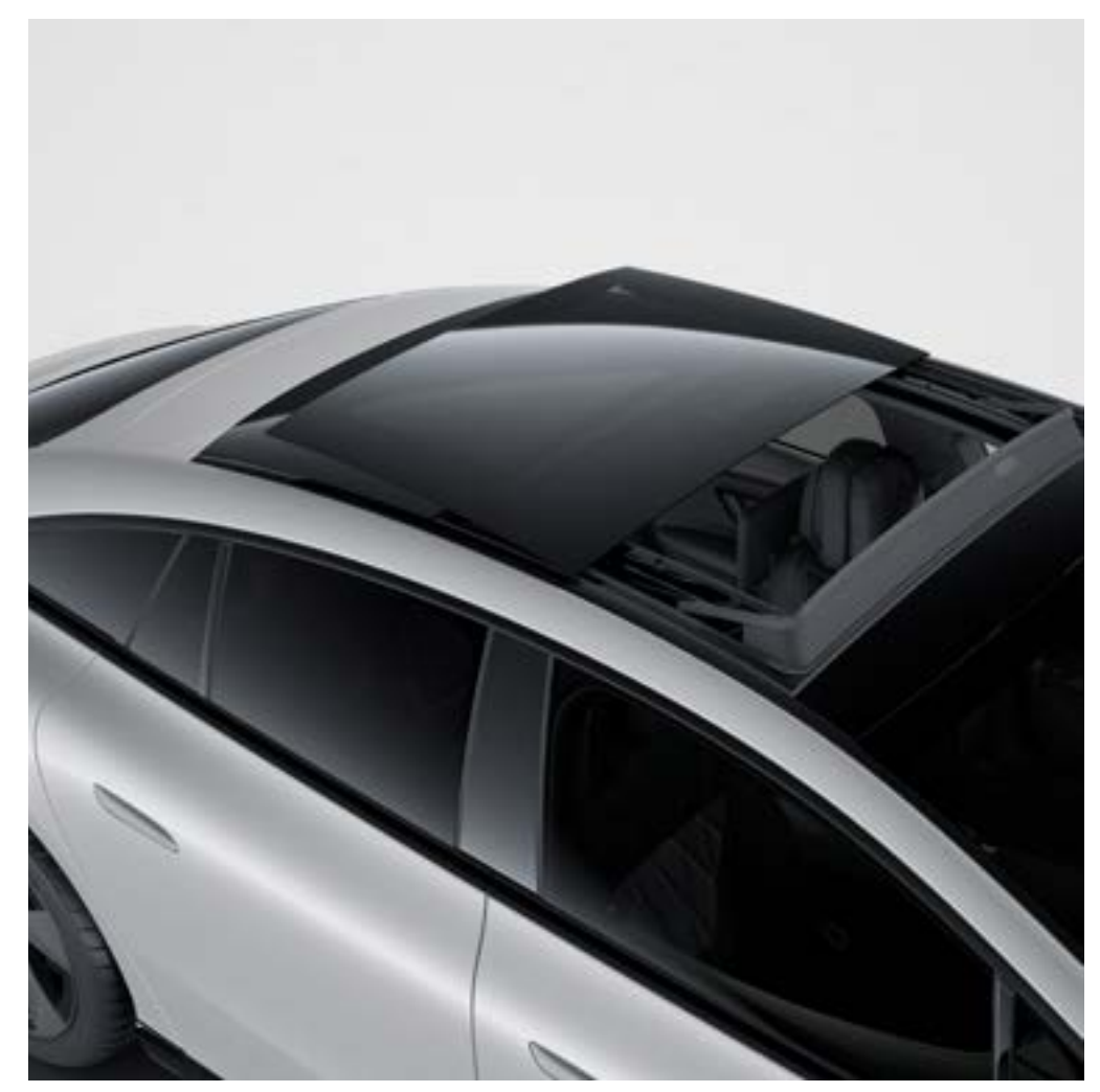
Panoramic sliding sunroof