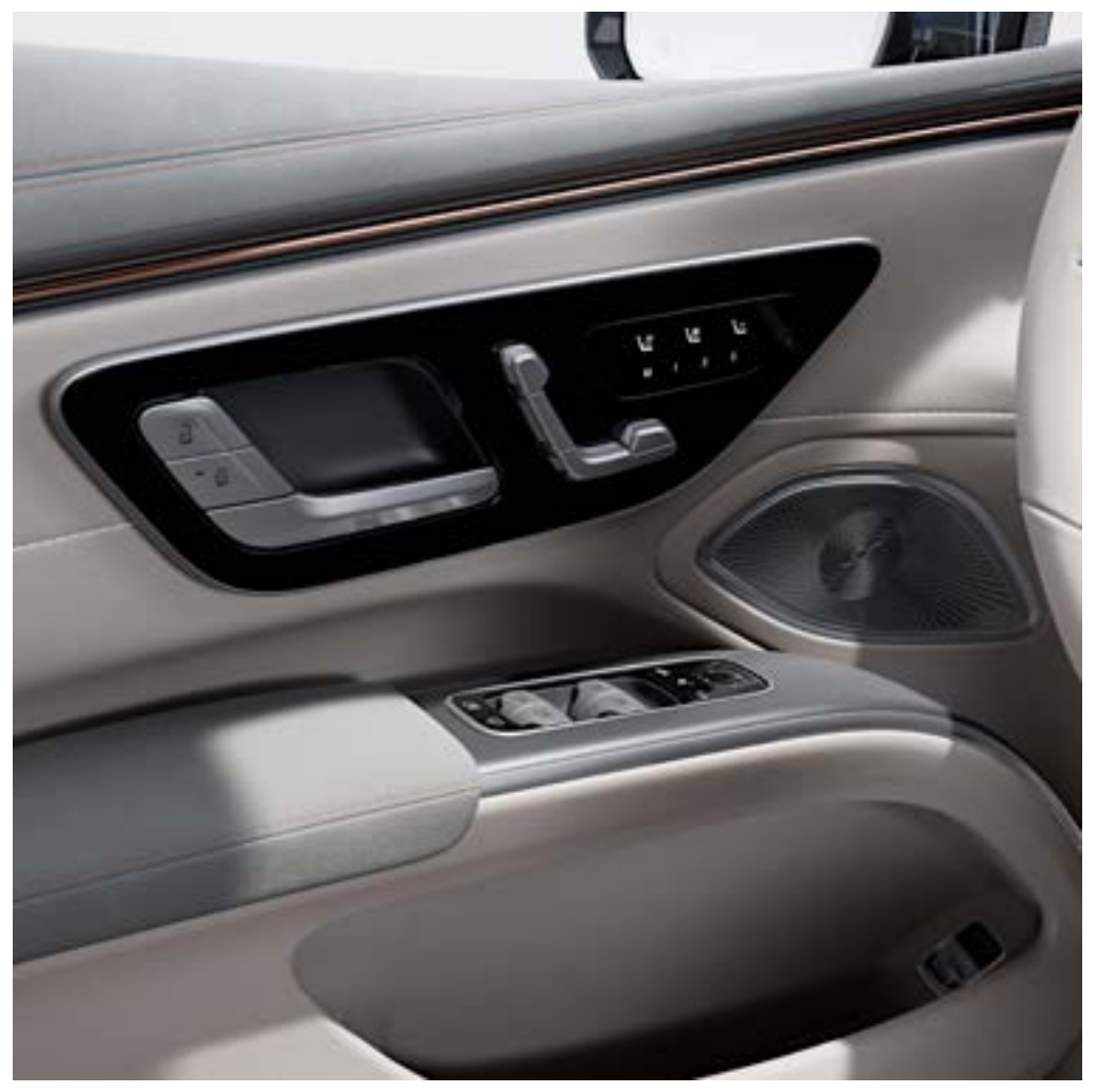
{\tt Burmester} \ensuremath{\mathbb{R}} 3D surround sound system