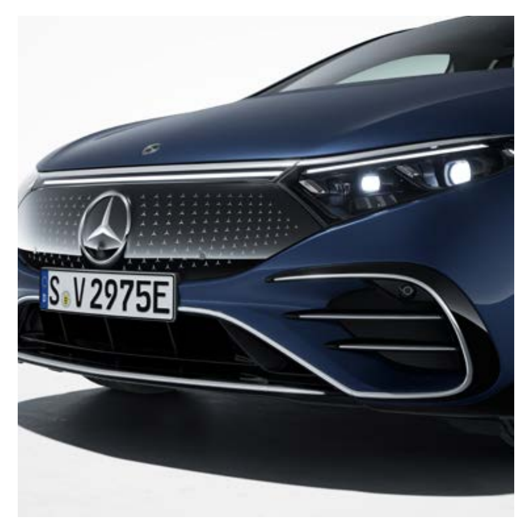
Radiator grille with Mercedes-Benz pattern