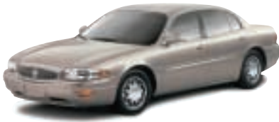
Shown: LeSabre Limited, in Light Bronzemist Metallic with some optional equipment.