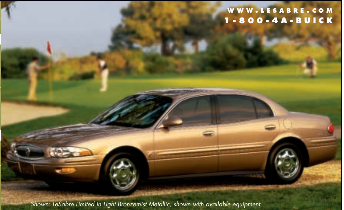
Shown: LeSabre Limited in Light Bronzemist Metallic, shown with available equipment.