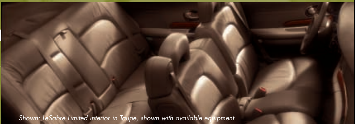
Shown: LeSabre Limited interior in Taupe, shown with available equipment.