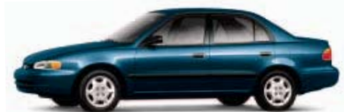
Dark Blue-Green Metallic