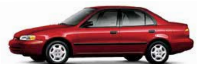
Medium Red Metallic