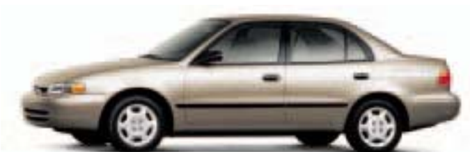
Cashmere Taupe Metallic