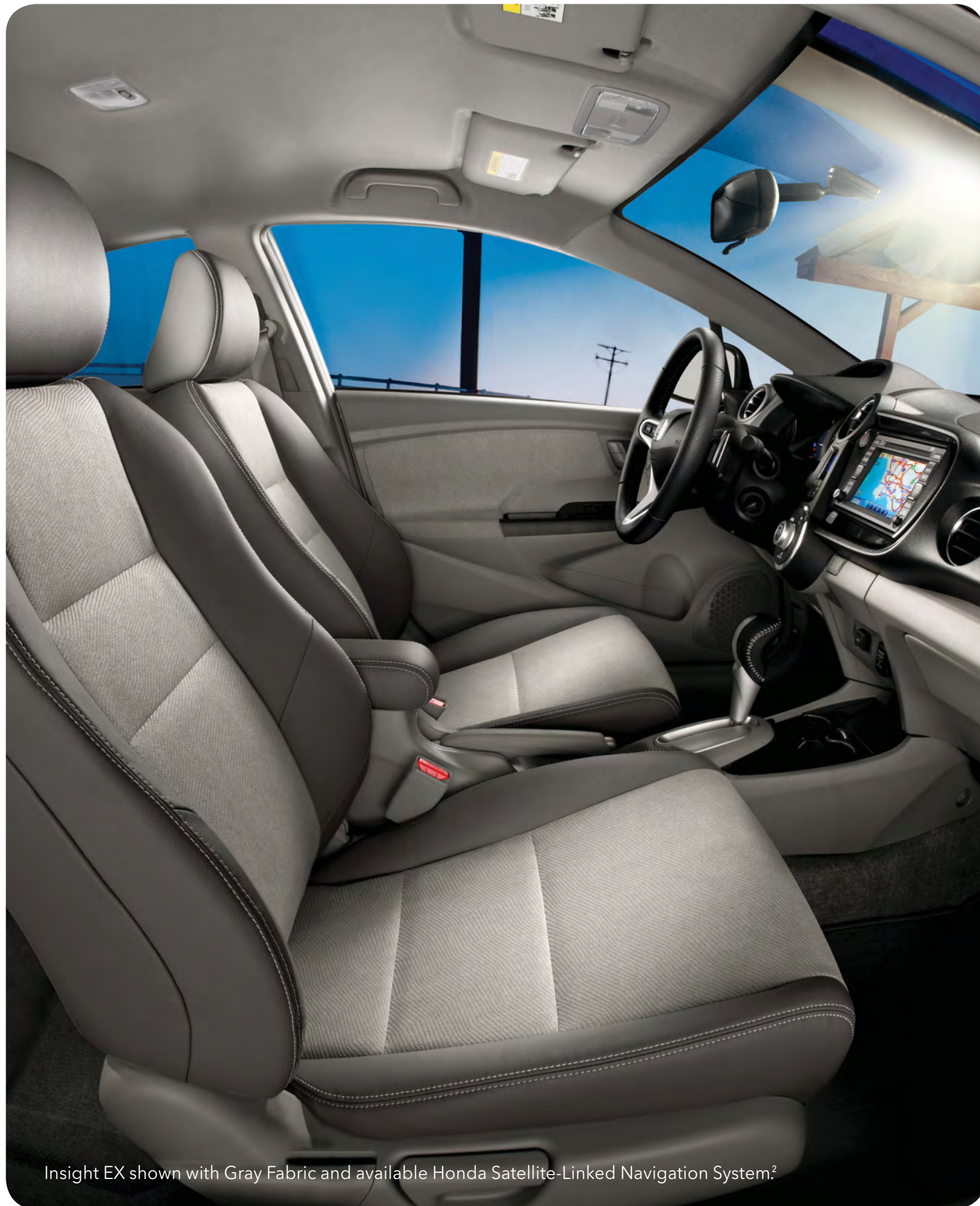
Insight EX shown with Gray Fabric and available Honda Satellite-Linked Navigation System 2