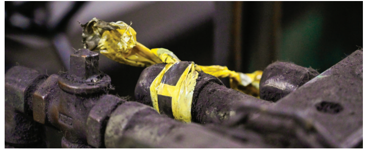
Marker identifying air leaks at the Republic Steel facility. Each repaired leak will save the company approximately $1,500 a year.