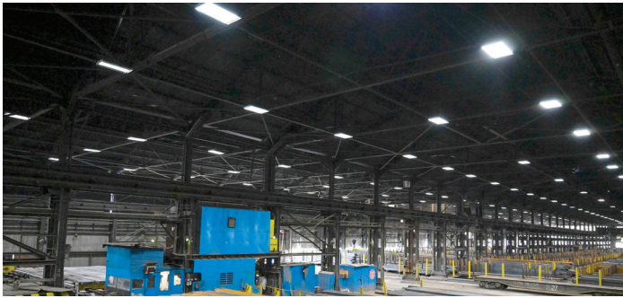
The lighting project led to many intangible benefits for Republic Steel, including improved production efficiency, reduced downtime, a two percent increase in yield and improved safety.

In the short time since the retrofit, Republic Steel has seen a two percent increase in yield—a major savings of as much as $200,000 a year.