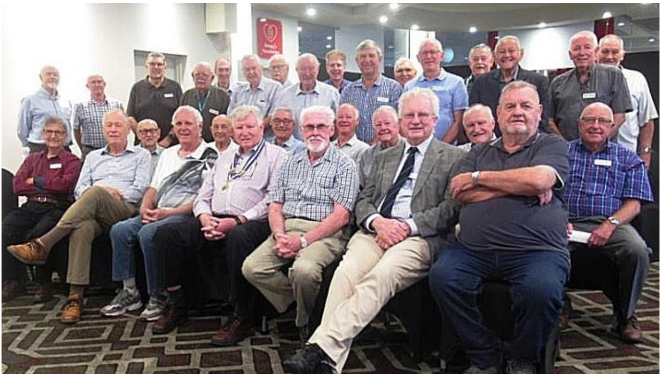
A group of distinguished handsome gentlemen at the March Annual General Meeting

The Next General Meeting of Newcastle Probus Club will be held on 28 th May 2024 at Souths Merewether