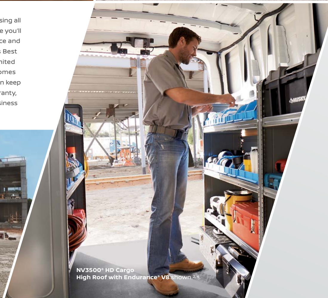
NV3500® HD Cargo High Roof with Endurance® V8 shown. 2,4