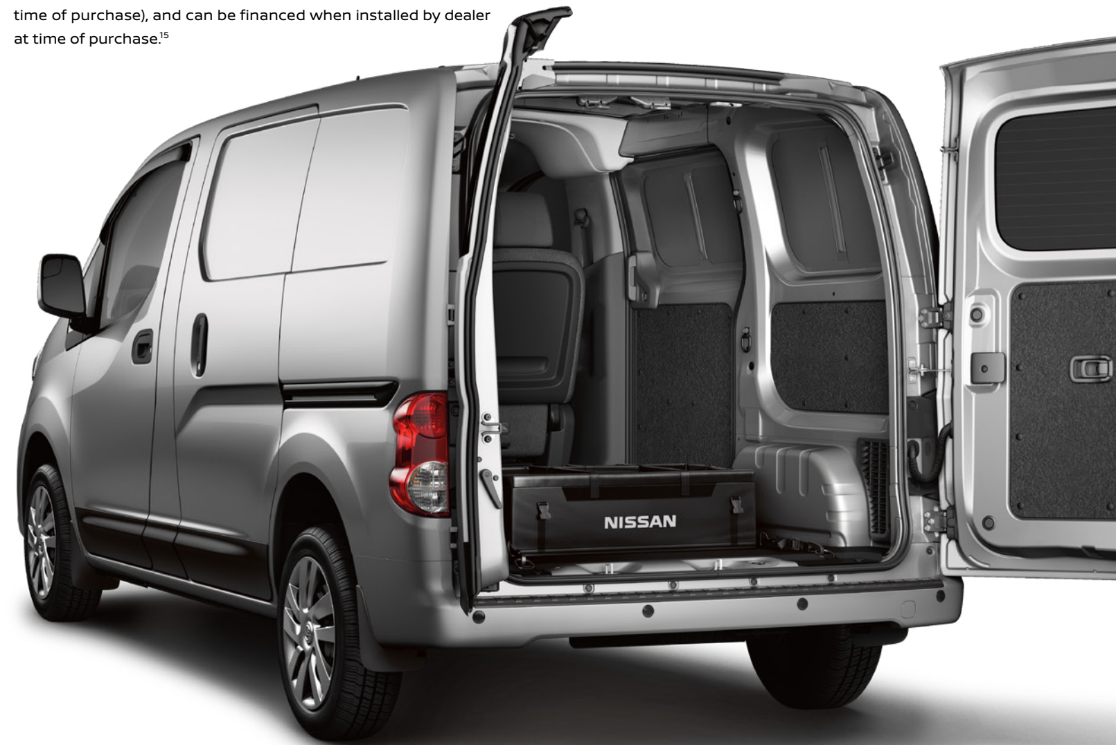
Nissan NV200 ® Compact Cargo SV shown in Brilliant Silver Metallic with Rear Door Glass Package 2, 4 Side-Window Deflectors, Body Side Moldings, Rear Bumper Protector, Splash Guards, and Portable Cargo Organizer 2

Every Genuine Nissan Accessory is custom-fit, custom-designed and durability-tested. Each one is backed by Nissan's 5-year/100,000-mile (whichever occurs first) limited warranty (if installed by dealer at the time of purchase), and can be financed when installed by dealer at time of purchase. 15