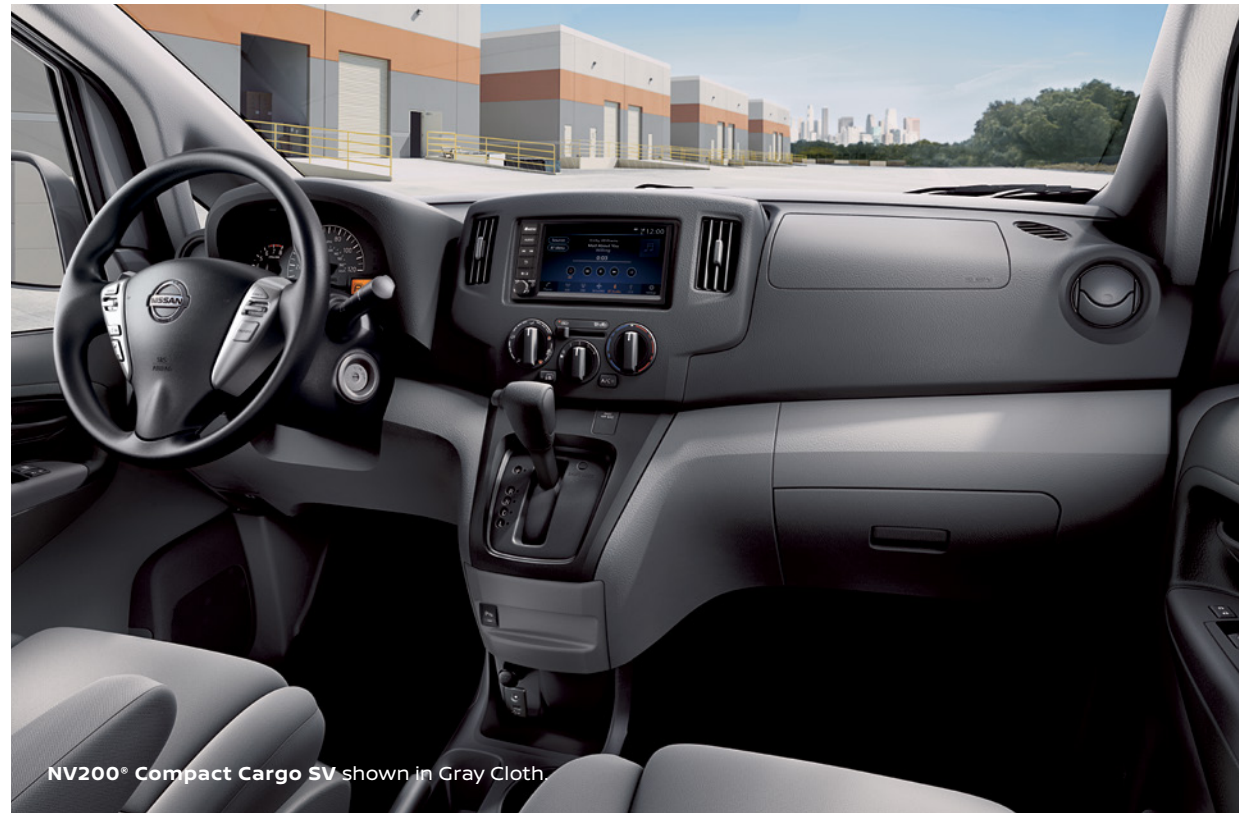
NV200® Compact Cargo SV shown in Gray Cloth.

Nissan has taken care to ensure that the digital color swatches presented here are the closest possible representation of actual vehicle colors. Swatches may vary slightly due to viewing light or screen quality. Please see the actual vehicle and colors at your dealer.