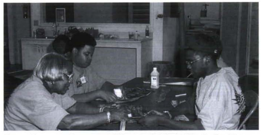
Teens and parents work on a team-building art project during "CreativeQuest," a retreat for underserved youth at Arrowmont.