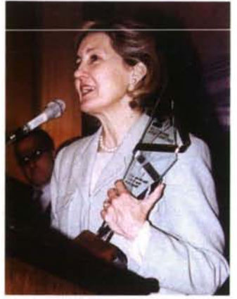
Texas Alpha and U.S. Senator Kay Bailey Hutchison accepts the North-American Interfraternity Conference's Award of Distinction

On May 23, 2002 Washington, D.C. was the gathering site of the leadership of fraternities and sororities as a group of more than 600 fraternity and sorority alumni met in the nation's capitol. The group gathered to address the issue of fire safety for the $3 billion in student housing on college campuses that house more than 250,000 students a year in 8,000 facilities.