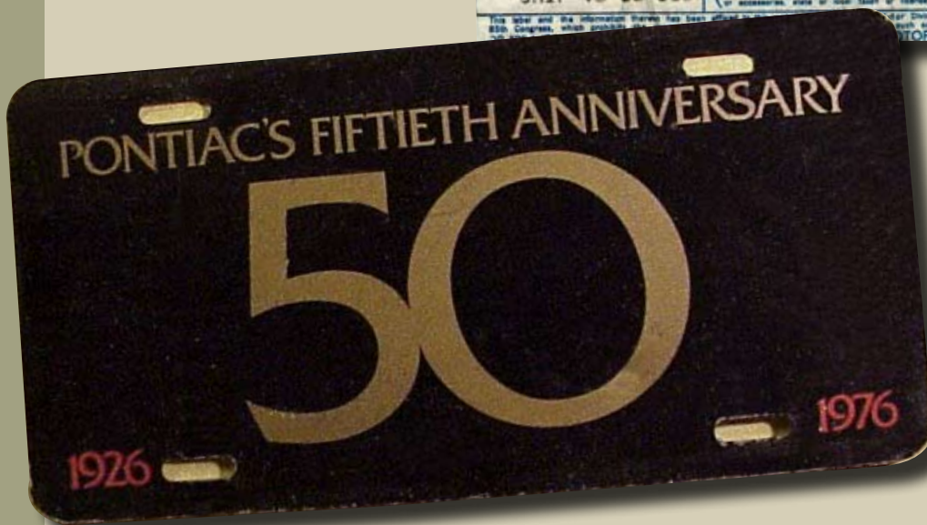
Original window sticker from a 1976 50th Anniversary Grand Prix.