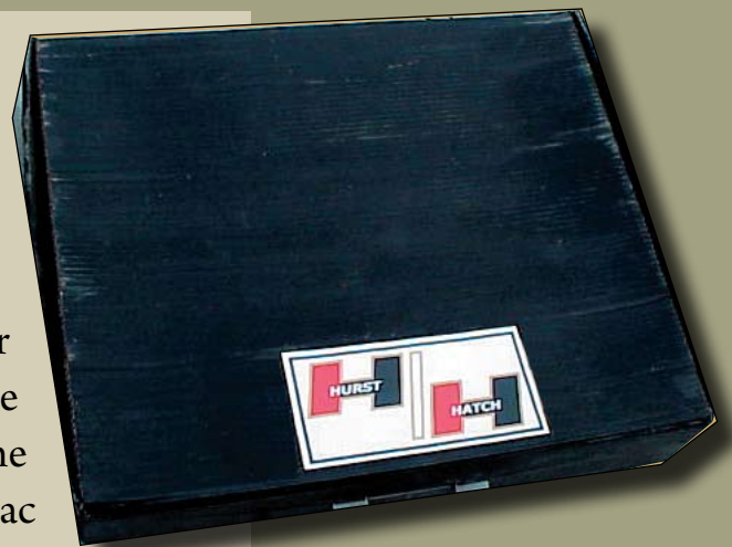
Original Hurst/Hatch storage case as described in dealer service bulletin.

Another paper item associated with this car includes a Dealer Service Bulletin dated 9/15/75. This bulletin is all about the Hurst/Hatch roof panels installed by Hurst Performance. The first sentence of the bulletin says "The Pontiac Anniversary Grand Prix (Y82 Option) includes Hurst/Hatch roof glass panels and storage case installed by Hurst Performance, Inc." It went on to state that all the Hurst items had a 12 months or 12,000 mile warranty and it gave contact information. On the back was a list of parts and the cost. Attached to this was a Hurst/Hatch warranty and maintenance brochure just for the 50th Anniversary Grand Prix. Maybe someone can fill me in, but the 50th Anniversary GP I looked at had an option code of "Y83" not "Y82"?