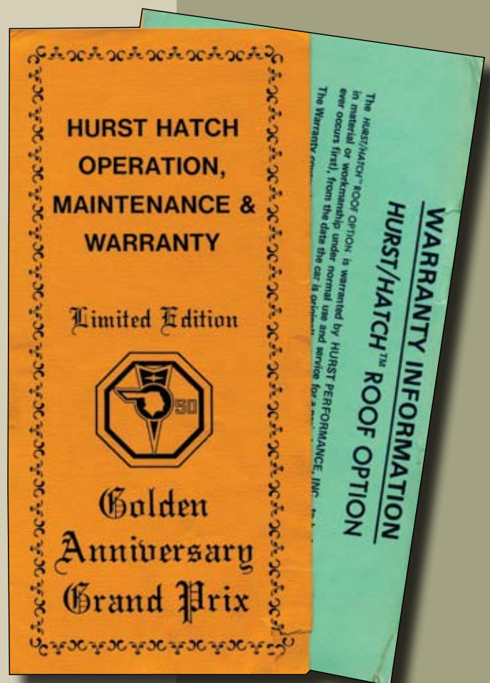
Hurst/Hatch warranty papers.