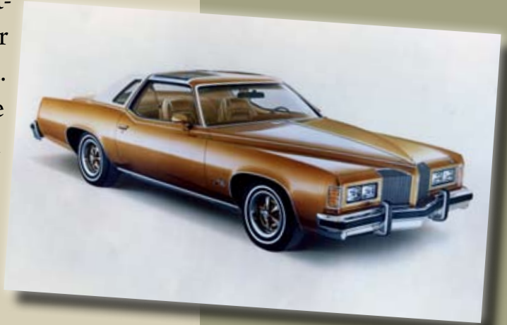
Photo of the 1976 Pontiac Golden Anniversary Grand Prix attached to memo sent to Pontiac zone managers.

This brings up an interesting point about the debut of this special car. POCI member Chuck Cochren provided some pictures from the 1975 POCI national convention held in Pontiac, Michigan August 22-24. It was