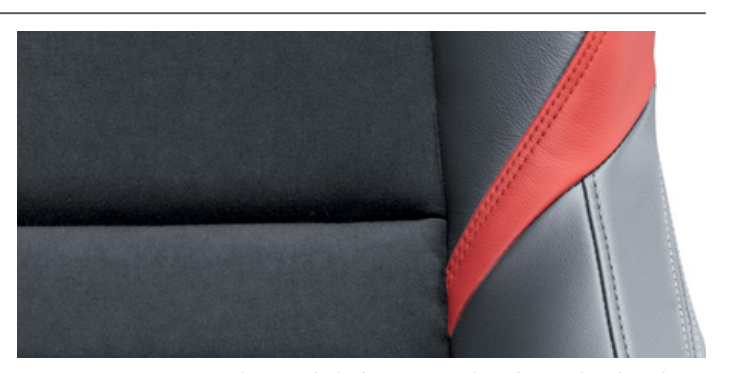
Anthracite Black Alcantara®/Red Leather (with red stitching)