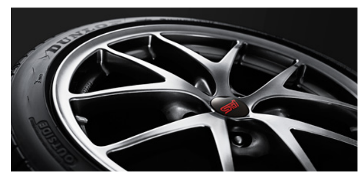
18-inch BBS forged aluminum alloy with high-lustre finish with STI centre caps (WRX STI Sport-tech Package)