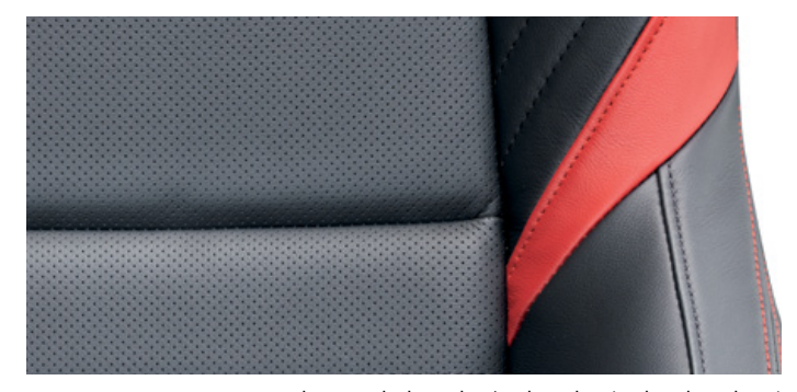
Anthracite Black Leather/Red Leather (with red stitching)