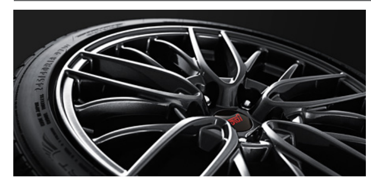
18-inch cast aluminum alloy with STI centre caps (WRX STI, WRX STI Sport Package)