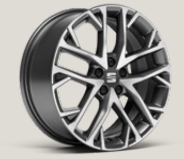
DYNAMIC 17" NUCLEAR GREY MACHINED ALLOY WHEELS