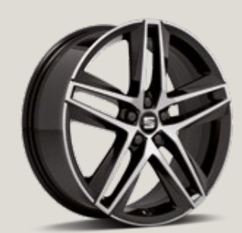
PERFORMANCE 18" GLOSSY BLACK MACHINED ALLOY WHEELS