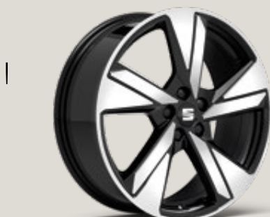
PERFORMANCE 18" BLACK MACHINED ALLOY WHEELS S1 XC