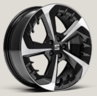
PERFORMANCE 18" BLACK R MACHINED ALLOY WHEELS