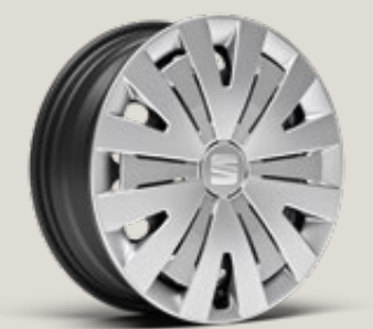
URBAN 15" Steel Wheels