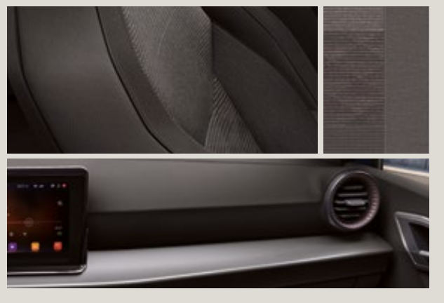
NAO CLOTH COMFORT SEATS