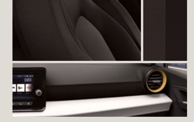
ACERO CLOTH COMFORT SEATS