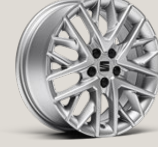
DESIGN 16" BRILLIANT SILVER ALLOY WHEELS