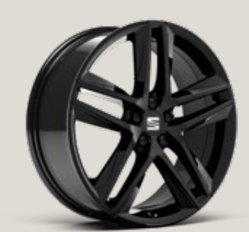
PERFORMANCE 18" GLOSSY BLACK MACHINED ALLOY WHEELS