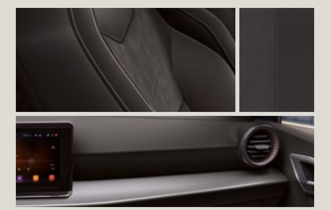
DINAMICA® BLACK SPORT SEATS