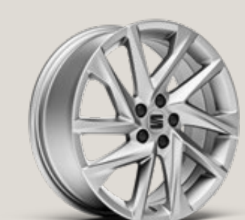
DYNAMIC 17" BRILLIANT SILVER ALLOY WHEELS