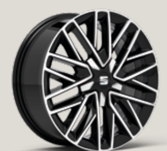
DYNAMIC 17" BLACK MACHINED ALLOY WHEELS St XC