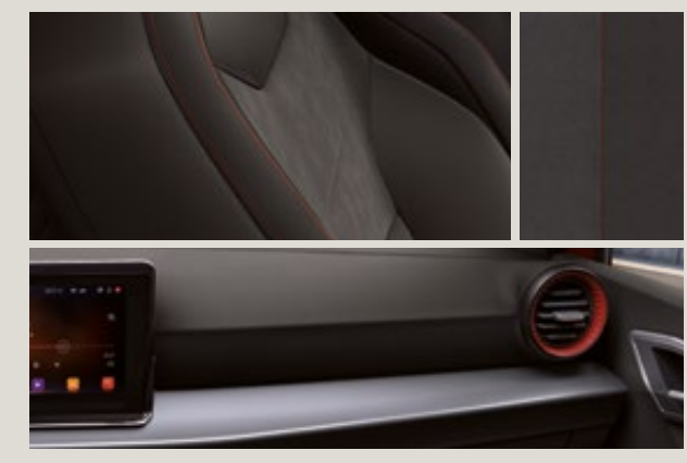
DINAMICA® BLACK SPORT SEATS