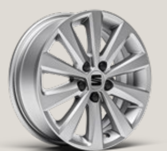
ENJOY 15" BRILLIANT SILVER ALLOY WHEELS S S