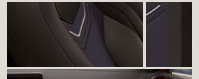
LE MANS CLOTH SPORT SEATS