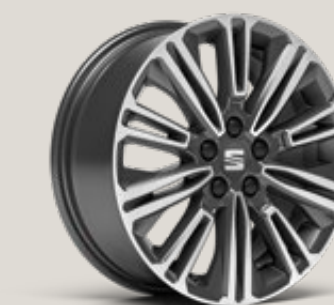
DESIGN 16" NUCLEAR GREY MACHINED ALLOY WHEELS