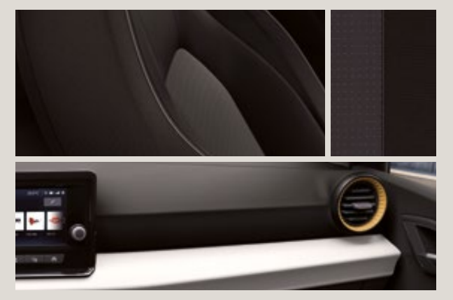
COMO CLOTH COMFORT SEATS