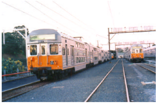
LEFT: Later this year, the Mark 1 Comeng motor-cars will celebrate 30 years of revenue service. Blue-striped C3840, with its relocated headlight, leads set R31 into Cheltenham on a down Hornsby service at 12:47pm on Sunday 8 April 2001 RIGHT: C39 78 and set R31 (again!) are stabled in Hornsby M.C. yard with a few K-sets and Tangaras in this early evening scene taken during Easter 2000