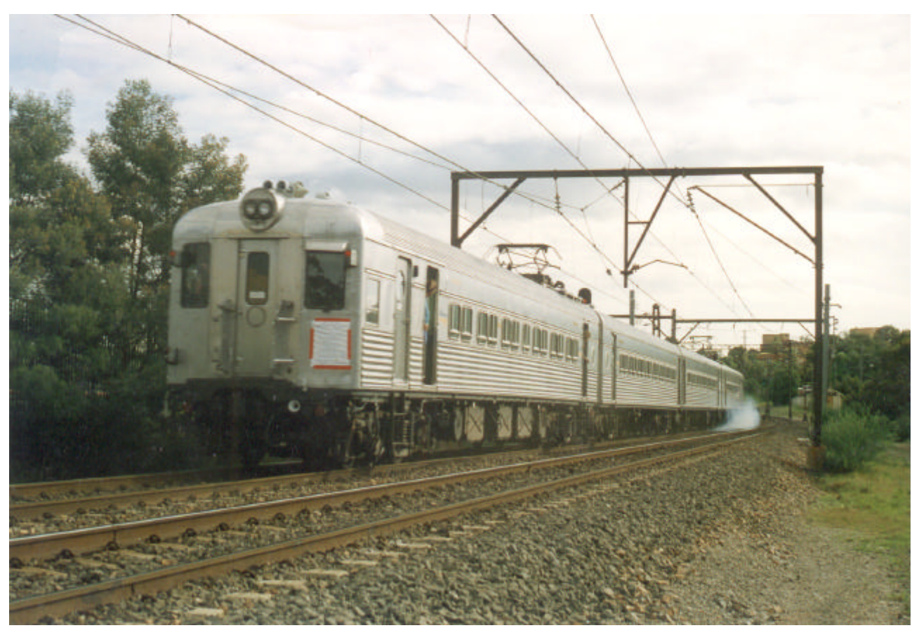
ABOVE: The last single-deck intercity service from the short north goes out with a bang as it runs over a detonator whilst passing Hornsby Maintenance Centre for the last time on Friday 1 November 1996 BELOW: A few days later, everyone on the Society's U-boat farewell tour of Sunday 3 November 1996 was all smiles as they relished their last opportunity to ride these stainless-steel veterans in revenue service. Photographers head towards the photoline at Tempe on the return run from Macarthur