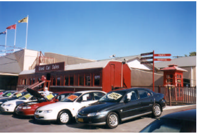
The site of the former Camden railway station, which is now a used-car yard The FR second-class car, which has been restored inside & out, is positioned adjacent to the former station platform (Paul Vonwiller)

a spectacular sandstone and wrought iron viaduct. We spent a couple of hours looking around, and there was the option to ride the narrow gauge steam engine with two bogie carnages, plus a tractor pulling one carriage with re-used seats originally from a single-deck suburban car. Also at the museum is single deck trailer car T4357, which was built in 1928 and withdrawn from service in 1989. It is now used as a kiosk with tables & chairs. with administration office.