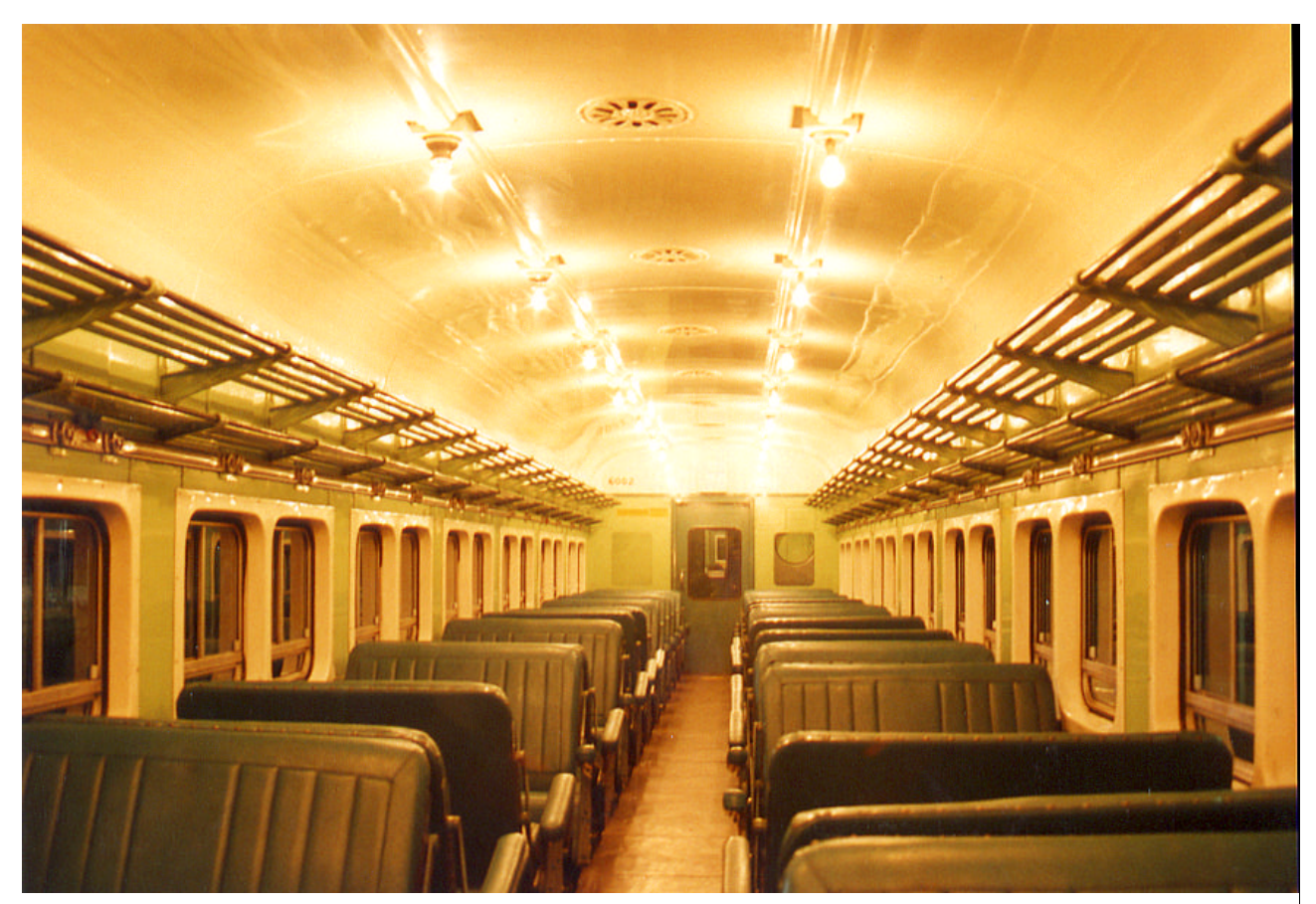
ABOVE: The main saloon of TF6002 at Thirroul on the evening of Wednesday 20 July 1994. The pale green roof and signwritten car number indicates a late-1970's Elcar overhaul, but the later-type seat backs have been fitted throughout. Note the absence of light shades and that the saloon fans have been removed. This car is now preserved by Richmond Vale Railway. BELOW: The main saloon of TF6005 during the U-boat Farewell Tour of 3 November 1996. Once again, the pale green ceiling and signwritten car numbers indicate a 1970's overhaul. This car is now preserved by Glenreagh Mountain Railway (Roy Howarth)