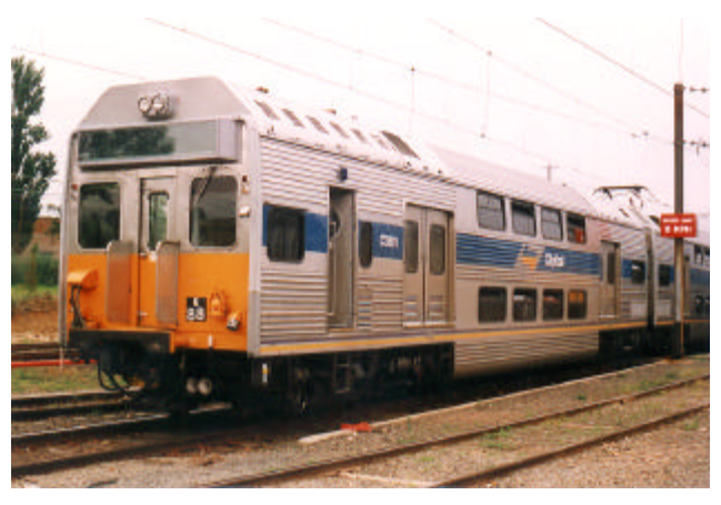
EARLY CITYDECKERS. With the release of CityRail's latest corporate liveries for the electric fleet, it's timely to look at two examples of CityRail's earlier, and unsuccessful, attempts at a uniform corporate image. LEFT: C3957 leads four-car set S14 at Jannali on Sunday 22 November 1998. This set was refitted at Elcar and received the small destination indicator and the thick blue CityRail stripe along the sides. Public address speakers were fitted adjacent to the exterior doors, but they were never used RIGHT: Freshly-painted C3511 on set K88 at Hornsby M.C. on 2 December 1995. This is the second version of the CityRail blue stripe livery. It seems that the blue and gold paint was applied without primer, as this paint peeled off several cars like tape. The opened hopper windows show that they were yet to be retrofitted with air-conditioning at that stage