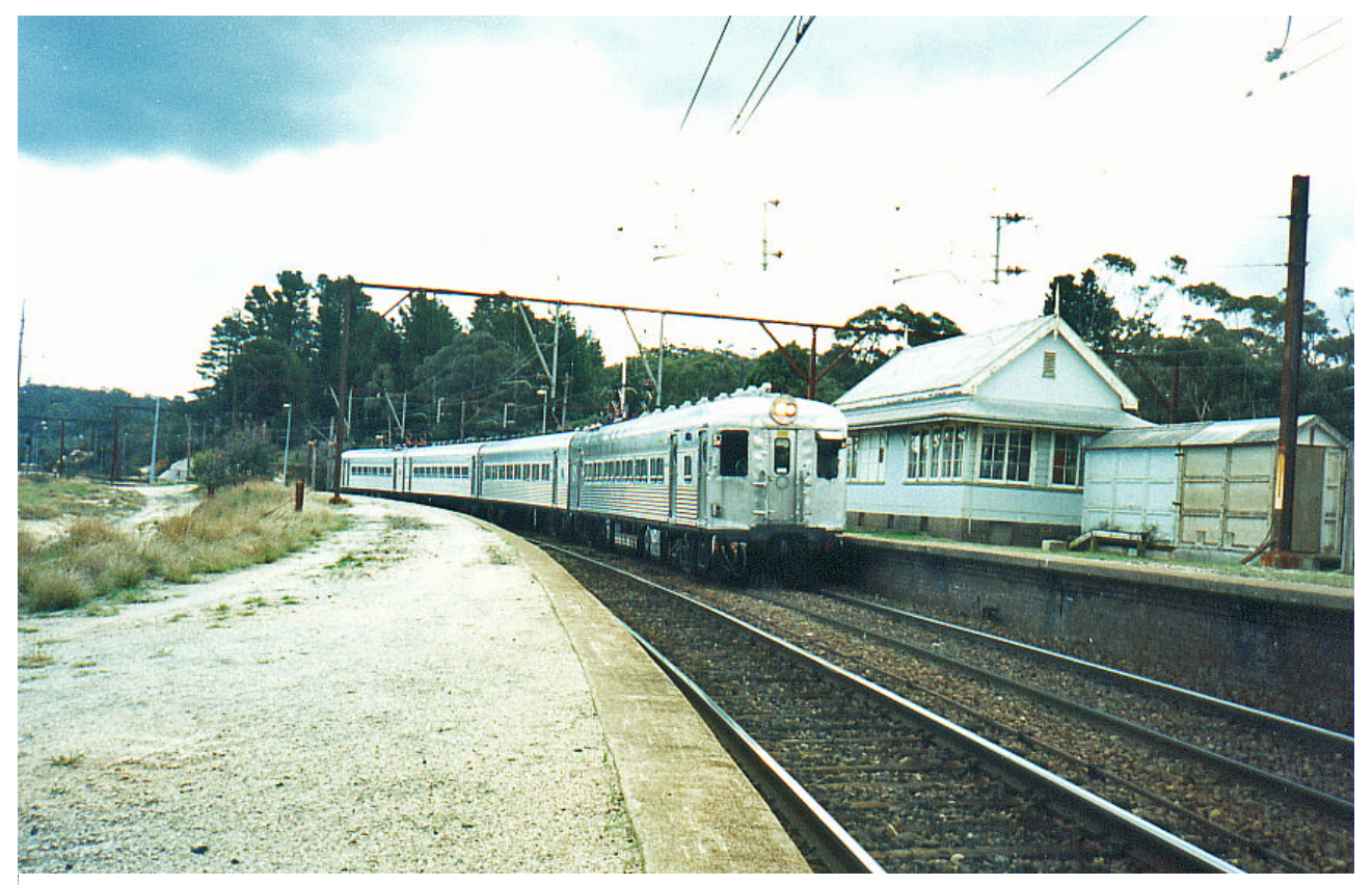
ABOVE: A four-car intercity set speeds through the former station of Newnes Junction on an up service during 1996. The ornate signal box (which also serves Clarence Colliery) is the only reason these platforms are still standing, where as the platforms at Hartley Vale and Clarence were demolished soon after closure in 1974 BELOW: CF5008 leads eight-car black-targetted set U8 past Eveleigh Carriage Works towards Sydney Terminal on 14 May 1982. Twenty years after this photo was taken, 5008 now stands derelict within the former long-closed workshops awaiting disposal. How things have changed!