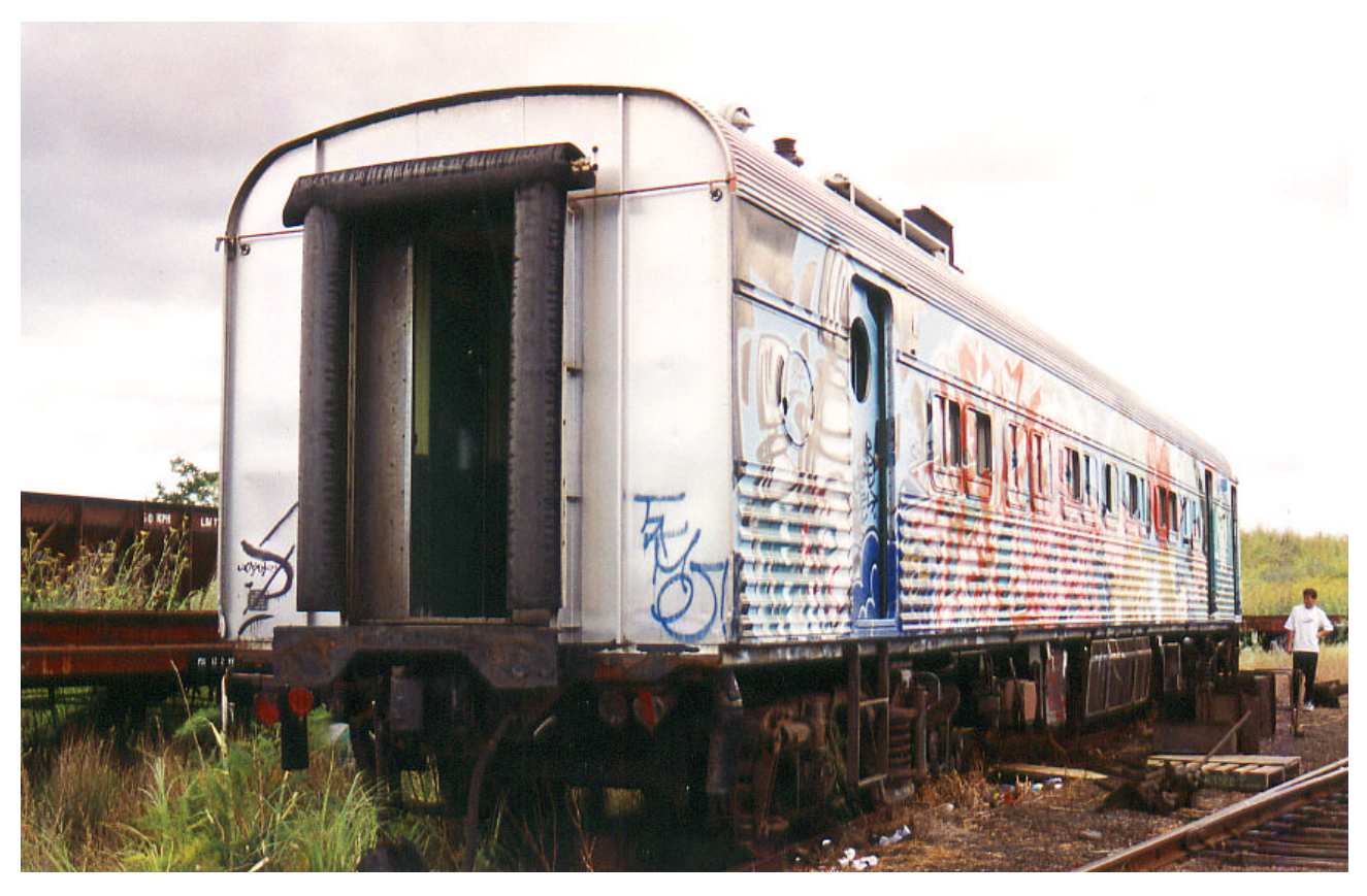
ABOVE: CF5039 at the back of Clyde Yards in late-1998 when removal of the undergear by Society members was underway. BELOW: TF6006 as it appeared at Heathcote when it was obtained for preservation during 1999. It was gratified before it left Eveleigh and its Beclawat windows were damaged whilst it was stored on this site. TF6006 now looks better with all but six of its windows restored, and this vandalism is now just a bad memory.