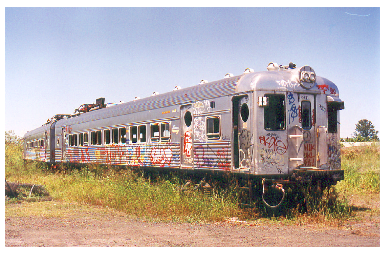
DERELICT U-BOAT CARS. Not very pleasant photos, but still relevant to the history of the U-boats during the disposal process. ABOVE: Clyde Down Yards was the worst possible place to stow these cars as vandalism was rampant from the day they arrived there. CF5026 (foreground) awaits relocation to Londonderry for resale, whilst 5021 behind it awaits transfer to Goulburn Roundhouse. BELOW: CF5019 was a source of sundry parts for the Society's cars, and after a brief spell at Londonderry, it now resides at The Oaks. (Roy Howarth)