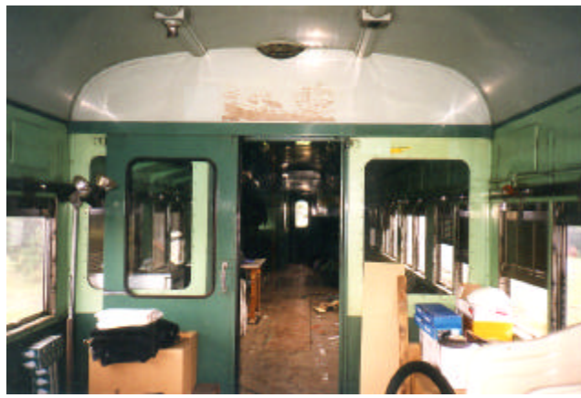
LEFT: The driver's end of CF5029 was extensively rebuilt after the 1973 fire at Gosford that destroyed cars CF5034 & ETB6033. Close inspection will see the separation marks on the letterboard and the roof. The original-window four-car set behind it had been used on a railfan tour a few days before this photo was taken in 1991 RIGHT: One minor internal difference amongst the ETB trailers is the position of the roof vents in relation to the centre bulkhead. In this photo of ETB6028 taken from the former non-smoking compartment, one vent is directly above the bulkhead, hence the small opening for it at the top. Later ETB cars (possibly from 6030 onwards) don't have this feature as the vents are positioned on each side of this bulkhead. The large windows on this bulkhead are non-standard features unique to the ETB cars