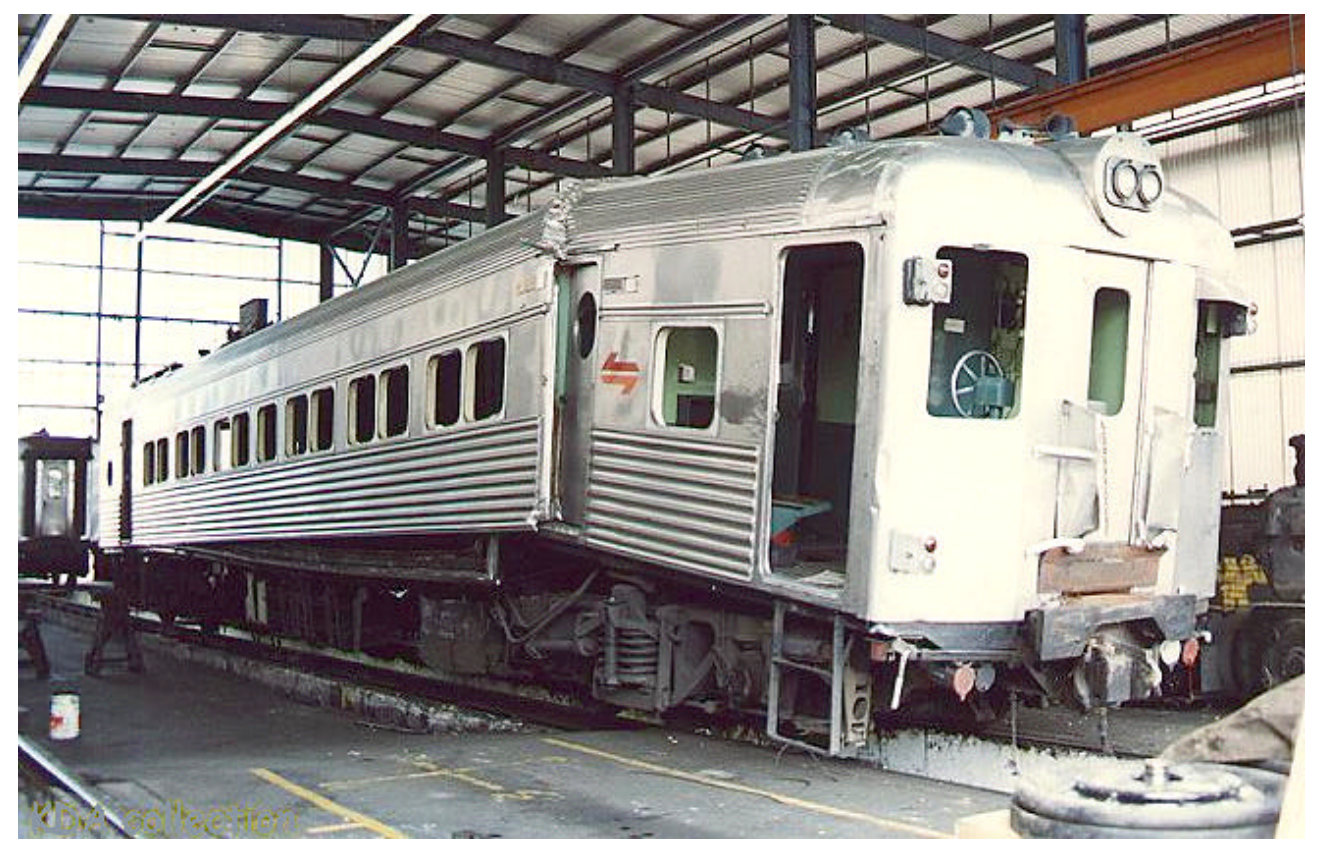
ABOVE: Christmas Day 1989 will stand out in U-boat history for the premature demise of CF5009. Greg Oates, who was working at Flemington Car Sheds on the day of the accident, recalled that after its collision, its pantograph was still raised and its lights and compressor were still working, but it was clear that its running days were over. With its fate sealed, a stripped 5009 awaits the scrapper's torch inside Flemington Car Sheds on 2 January 1990 (Kim Andronicus) BELOW: CF5040 sits alongside an ex-SRA MHO guard's van at its first resting place near Charlton, Victoria. The main north line to Albury is on the left.