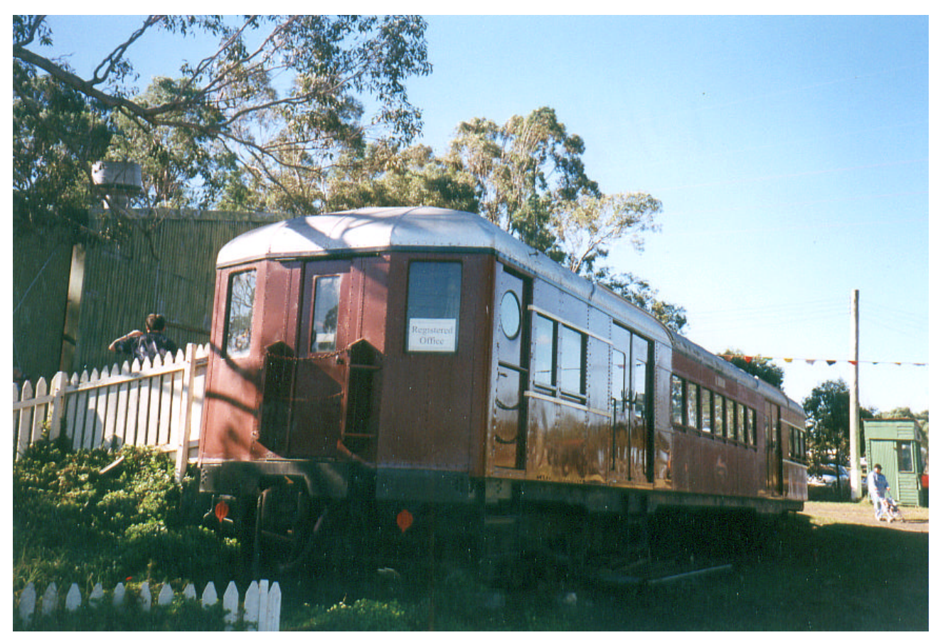
ABOVE: Walsh Island trailer-car T4357 is the main office and canteen at the Campbelltown Steam Museum. The car is currently undergoing an Indian red repaint, complete with buff lining. BELOW: The platform of the former Camden railway station is now totally unrecognisable from the steam era. To complement the FR car, some interesting touches on the site include a couple of wooden platform benches and a once-familiar red telephone booth, which certainly needs a coat of paint! (Paul Vonwiller)