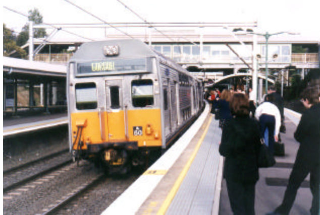
SECTOR 3 K-SETS. LEFT: C3520 (a number once used by a Tulloch single-deck motor-car from set F39) leads set K83 into Thornleigh at 8:07am on Sunday 10 October 1999 RIGHT: Set K60 slows to a stop at Westmead on an up service to Gordon via Central during October 1999. Should the K-sets and C-sets really be classed in the same league as the early Comeng & Tulloch double-deckers as part of the second generation?