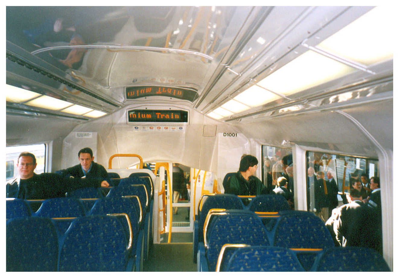
THE INTERIOR. ABOVE: The upper-deck of D1001 looking towards the No.1 (pantograph) end. Features to note are the electronic display (which has a security camera to the right of the display screen), the fabric seats with chrome seat handles and the roof contour BELOW: The lower-deck of D1001 at Circular Quay on 5 July 2002. Unlike all previous double-deck cars, the lower-deck roof contour isn't flat, but slightly curved