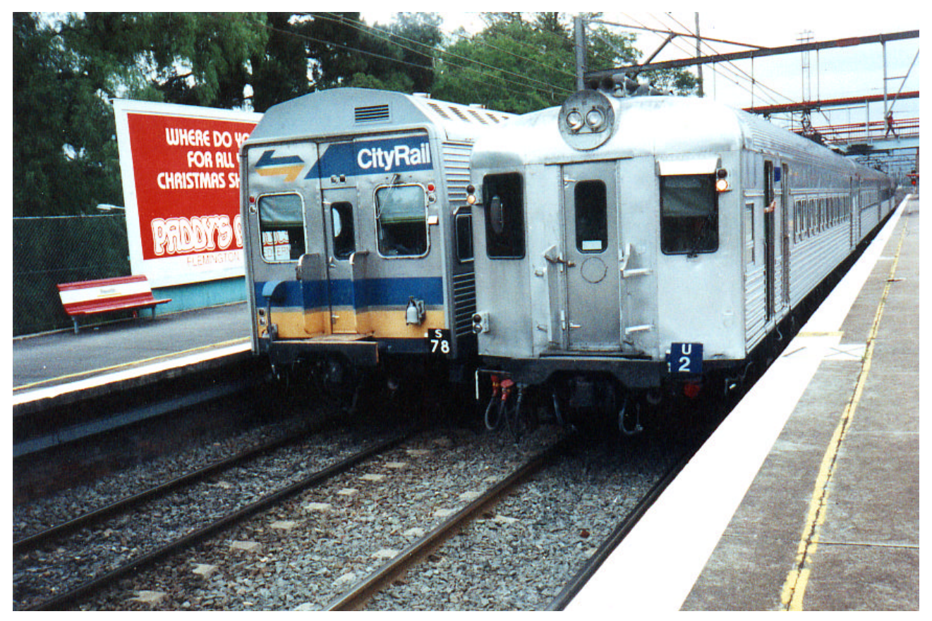
ABOVE: Four-car set U2 and experimental Citydecker double-deck S78 at Penrith in 1991. This refurbishment of this set was done at Elcar. Note the target of S78 is yet be siliconed onto the front of the car RIGHT. One of the IHO vans converted from EHO's for use with the U-boats. The modifications included auto-couplers, buffing plates and the guard's bell. IHO1285 is shown in Carriage Works yard in 1982. It was withdrawn from service in 1986 and is now preserved at Dorrigo