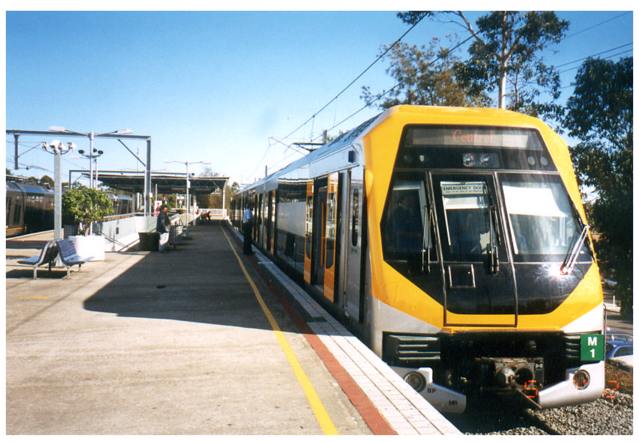
ABOVE: Green-targetted set M1 awaits departure for the city at East Hills while a Tangara passes on a down Campbelltown service on 5 July 2002. BELOW: After a few weeks on sector 2, set M1 was rostered on sector 3 for three weeks during July. Set M1 awaits departure from Berowra on a city service via the north shore on 27 July 2002. It shouldn't come as a surprise that, as well as being popular with passengers and railfans, set M1 was equally popular with various politicians wanting that sought-after photo opportunity! (Paul Vonwiller)