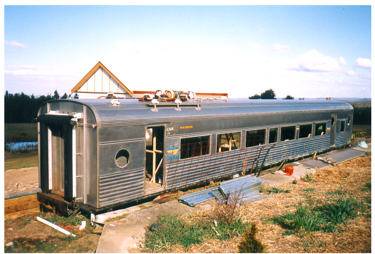
ABOVE: With the graffiti removed by the SETS team as a fundraising exercise, the unaltered side of 5020 looks splendid, and it now resembles an original-window car! Note that the roof vents have been removed and bundled in the former pantograph area. BELOW: A later view of the altered side with construction more advanced and again after removal of the grafitti. CF 5020 undergoes a radical transformation to its new role as a residence for its new owner. Note the large opening cut into the side and the station-like wooden building on the right (John Horne)