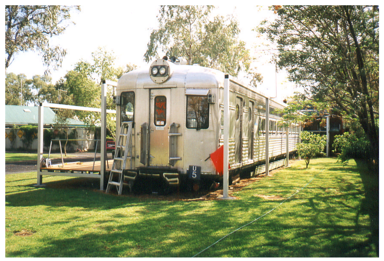
U-BOATS ON PROPERTIES. ABOVE: CF5007, complete with target plate U5, at Tandarra Caravan Park in Trangie, NSW. Sputnik trailer T4787, which was repainted Tuscan-red with a brown & cream interior and renumbered 4737 whilst at Northern Suburbs Cemetery, is another permanent resident BELOW: Many miles from its former stamping grounds, CF5039 rests in its new home in Nimmitabel in the far south of the state