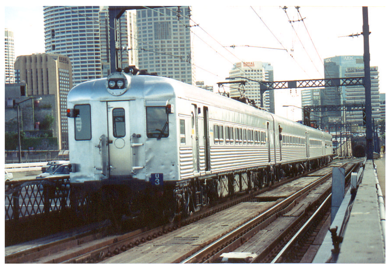
ABOVE: No, not an enthusiast's tour (although it may as well have been!), set U3 was diverted via the up shore owing to trackwork on the main north during January 1994. Set U3 descends the southern approach of the Harbour Bridge on its way to Central. The front cover of the May/June 1994 UTW has another photo of this set. BELOW: The first time a U-boat was used on a SETS tour was the Dapto to Bondl Tour of Saturday 20 February 1993, which consisted of CF5027, ETB6039, TF6017 & CF5017. From Bondi Junction., the train reversed at Erskineville and proceeded to North Sydney. Set U9 is shown at a photostop on the Up Illawarra at Redfern playform 9 (Roy Howarth)