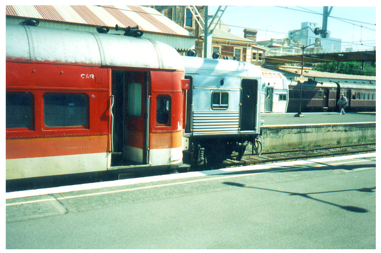
ABOVE: Four generations of rolling stock come together at Newcastle during the early-1990's, in the form of a 'candy-stripe' 620-class railcar, U-boat, chopper-control V-set and loco-hauled Waddington N-type cars on a 3801 Limited tour (Andrew Coble) BELOW: CF5025 as it appeared in revenue service, prior to its alteration (or disfigurement if you prefer!) for the big-screen, at Morrisett awaiting departure for Newcastle on a local service on 6 December 1994. Note the unusual jumper receptacle and bracket on the left apron (Roy Howarth)