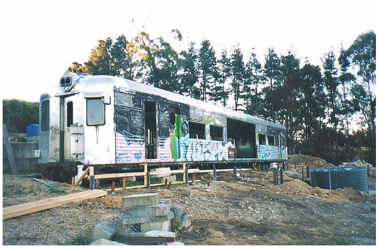
5020 AT BILPIN. This car has been stripped and converted into holiday accommodation. To increase the area and provide all facilities, a mock station building was also constructed next to the car. ABOVE: The first stage of the transformation of this car prior to the removal of the graffiti. BELOW: An innovative solution to the problem of attempting to fit furniture through the narrow doorways of 5020 was this walk-in main saloon! In the foreground is the timber bracing for the wooden building's platform and awning. (John Horne)