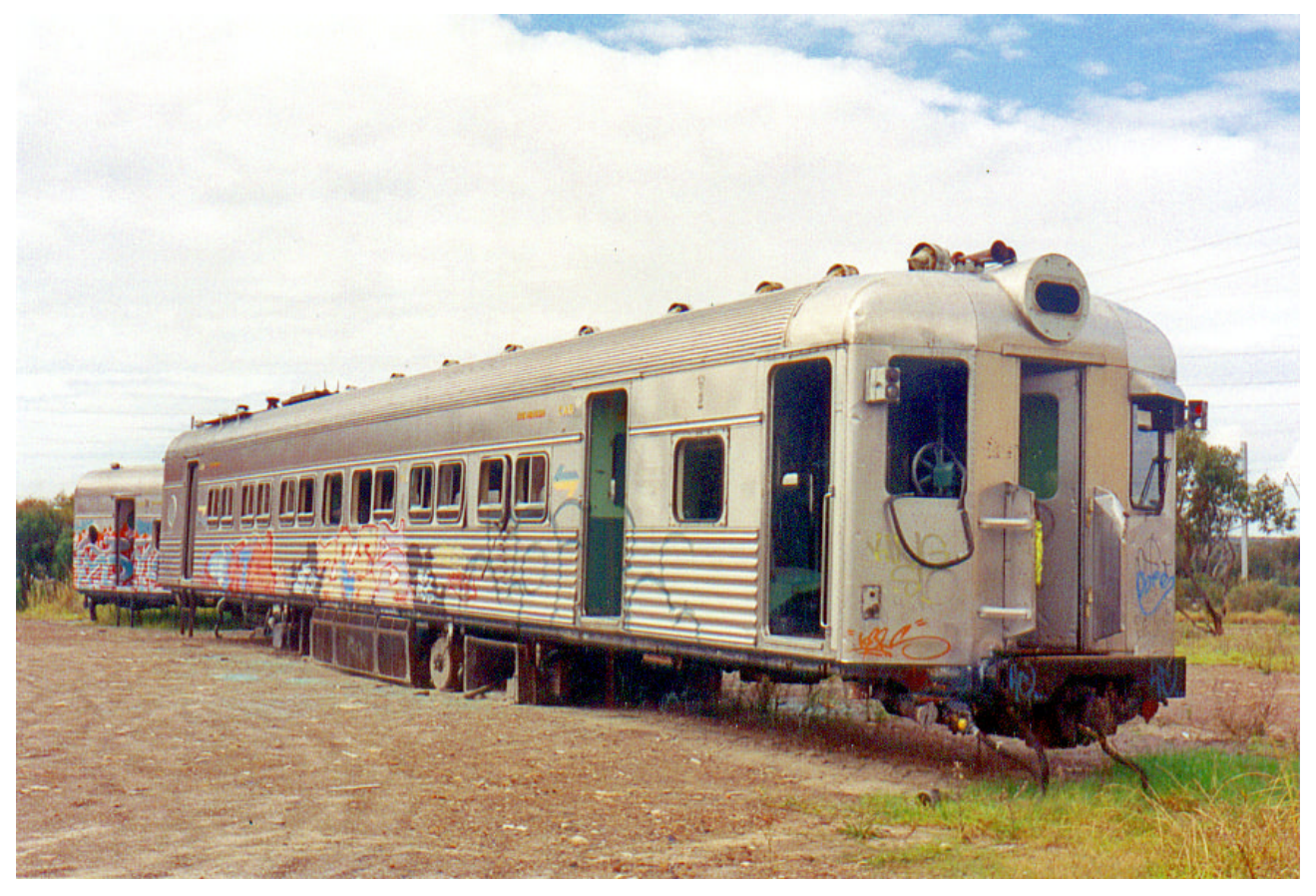
ABOVE: During 2000, much mention was made in UTW of ill-fated motor-car CF5028, which was burnt-out by vandals near Heathcote and subsequently stripped of its remaining useable parts by SETS before being cut-up. We can now show how the car looked just before its untimely demise. BELOW: Nothing in the main saloon survived the fire, and this was the first section of the car to be cut-up. The remains of 5028 were recently removed as the block of land it was on is currently up for sale