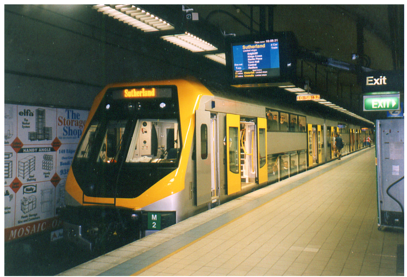
ABOVE: Once the most modern suburban line in Sydney, the 1970's architecture of the ESR now look quite dated alongside the Millenium Trains! D1004 and set M2 await departure at Bondi Junction for Sutherland on 8 August 2002 BELOW: The plug-type doors, showing some of the internal grab-rails, on N1501 at Campbelitown on 5 July 2002. Note that these doors do not appear to be as heavy as the Tangara's plug-type doors, which tend to sag when open