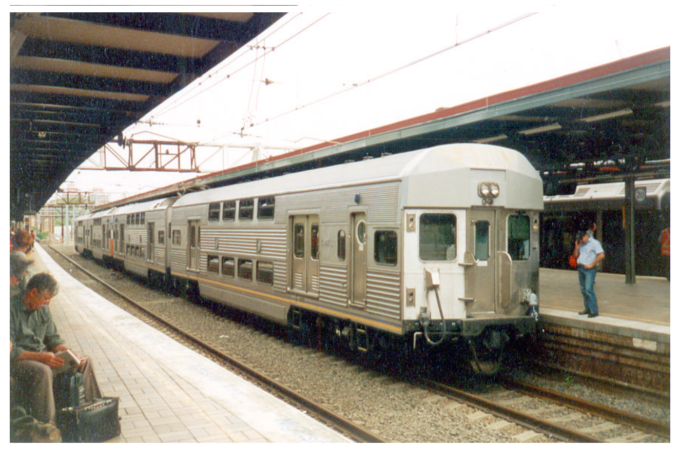
PAST GENERATIONS OF DOUBLE-DECKERS. With the arrival of the fourth-generation suburbans, we must acknowledge the sterling service provided by the previous generations of double-deck suburban sets over the past three decades. ABOVE. Several years ago, it was common to see Comeng driving-trailers on the outer-ends of double-deck sets, but now it's a very rare sight. D4001 leads C3747 (L12) and another L-set with cars C3757 and D4009 at Central platform 21 on a City Circle service on New Year's Day 2001 BELOW: Sets K92/K93 speed a Richmond-bound service uphill between Lideombe and Auburn on the down main western line on Thursday 24 December 1999