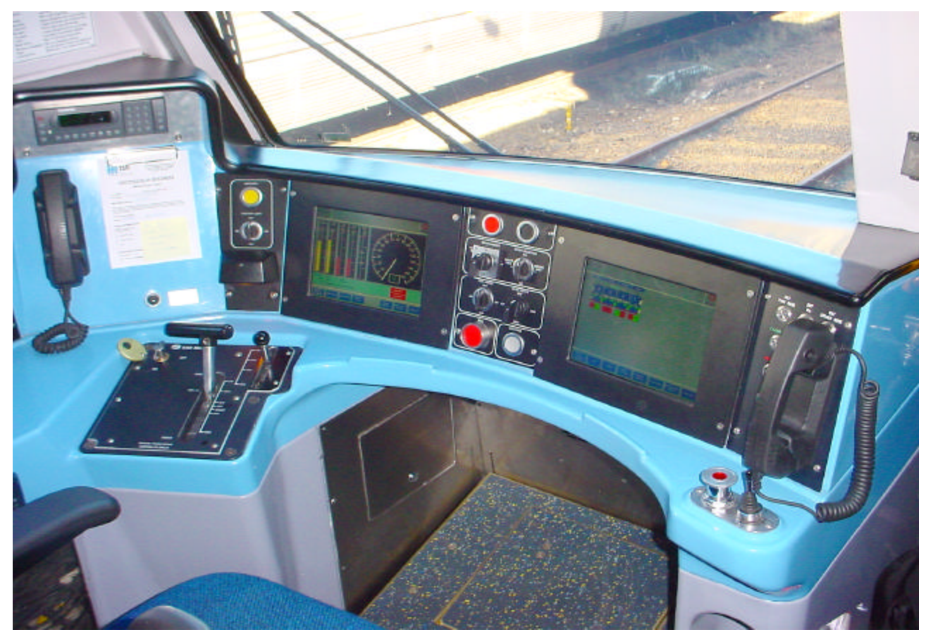
ABOVE: The driving controls in D1001 during the launch at Sydney Terminal. The desk-console layout of the controls shares some similarities with the Tangara's controls, but with a number of new features BELOW: Set M2 picks up passengers at Rockdale on a Bondi Junction all-stations service on 8 August 2002. This station is currently undergoing a major upgrade