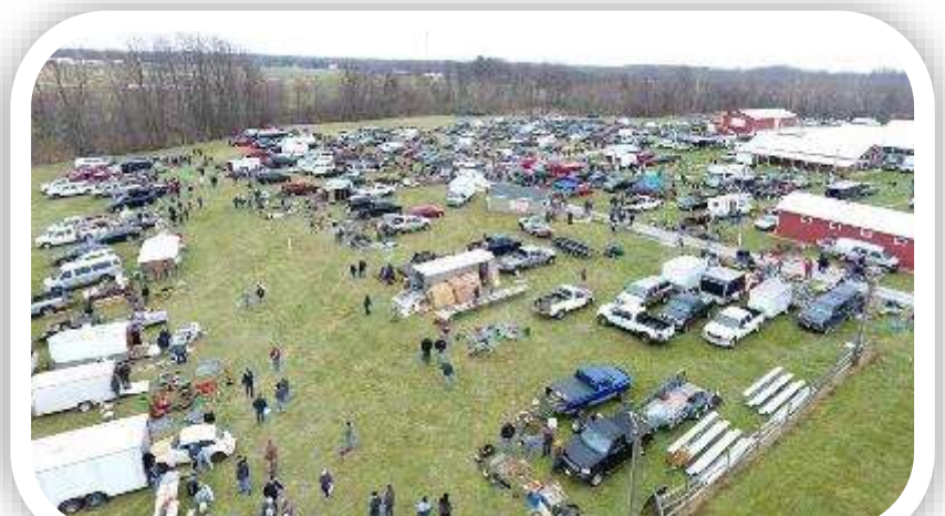
Tailgate section was very well attended, as it is every year.