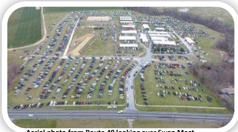
Aerial photo from Route 40 looking over Swap Meet