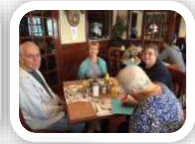
Our Members & Friends at Breakfast