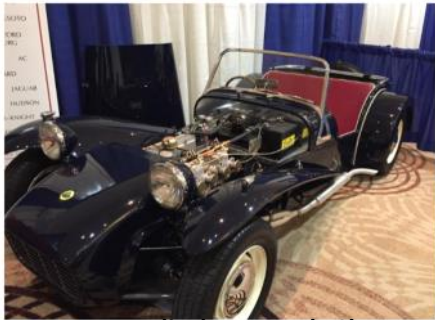
Lotus on display at Trade Show