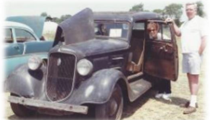
Valerie & Bill 1991 Gloucester Co. College Car Show

The all steel body of the 1934 Plymouth cured the swelling and sagging of the doors. The roof insert was made with wood frame, chicken wire and padding. It was topped with a water-proof material.