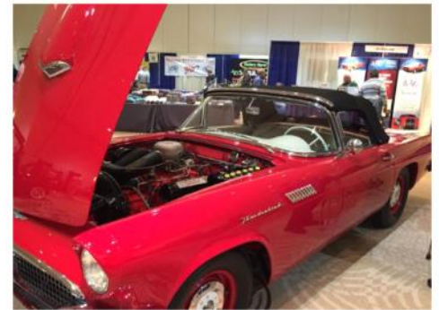
1956 Thunderbird on Display