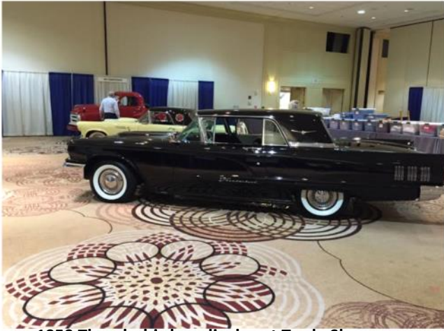
1959 Thunderbird on display at Trade Show