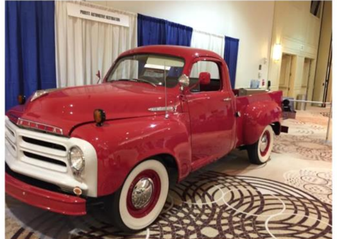
1956 Studebaker V-8 Truck on display at Trade Show