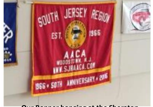
Our Banner hanging at the Sheraton

Each year in February our National organization hosts the Annual Meeting in Philadelphia. Philadelphia was chosen because our club originally started in that city in 1935 so it's like a homecoming. This year attracted over 1,000 members and the itinerary includes meetings, a judging school, seminars and a great trade show. Also each year some members are asked to display cars as a theme and this year's theme was Thunderbirds. Some vendors who are restoration shops also display cars.