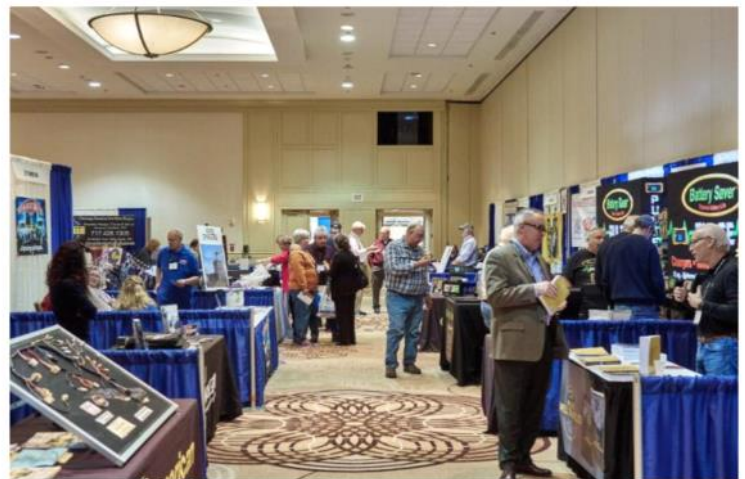
Some of the Trade Show vendors at the Sheraton.

Thank you to AACA Speedster for allowing us to use some of their photos of the National Meeting.