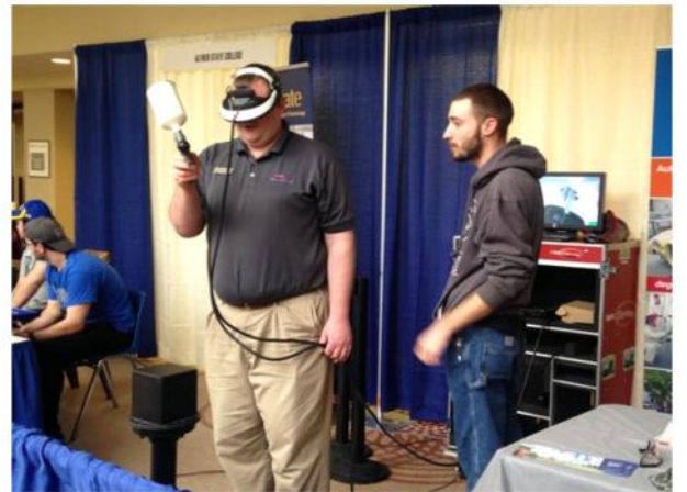
Penn College of Technology demonstrating their Virtual Spray Booth at the Trade Show

The Annual Meeting concluded with the awards banquet which is the Oscars of the old car world. Awards are distributed for quality restorations, touring, judging, newsletters and many more. So if you've never attended this event, think about it for next year.