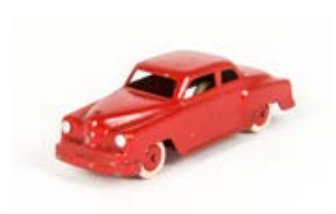
189. A Mercury No.6 Studebaker, red body and hubs, white tyres, G £60-80