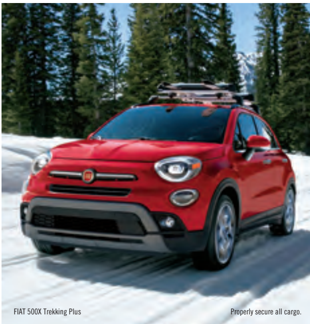
FIAT 500X Trekking Plus