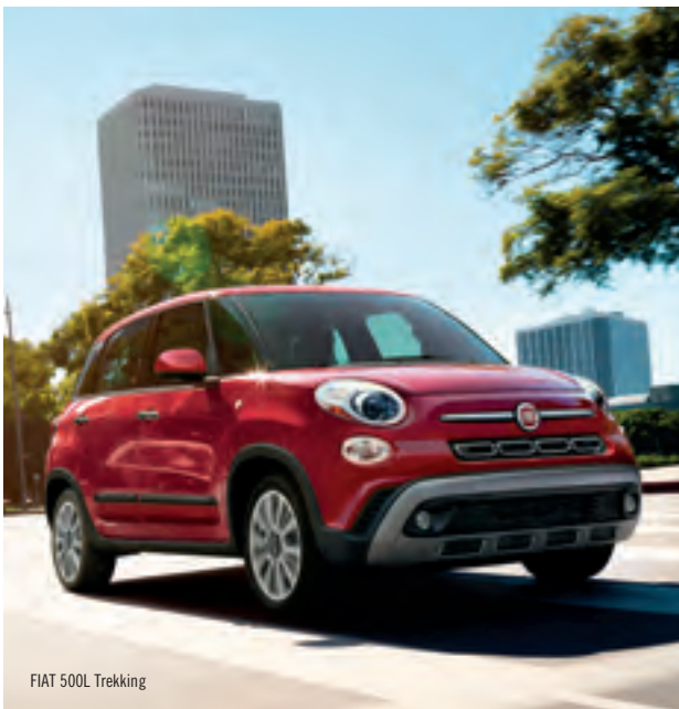
FIAT 500L Trekking