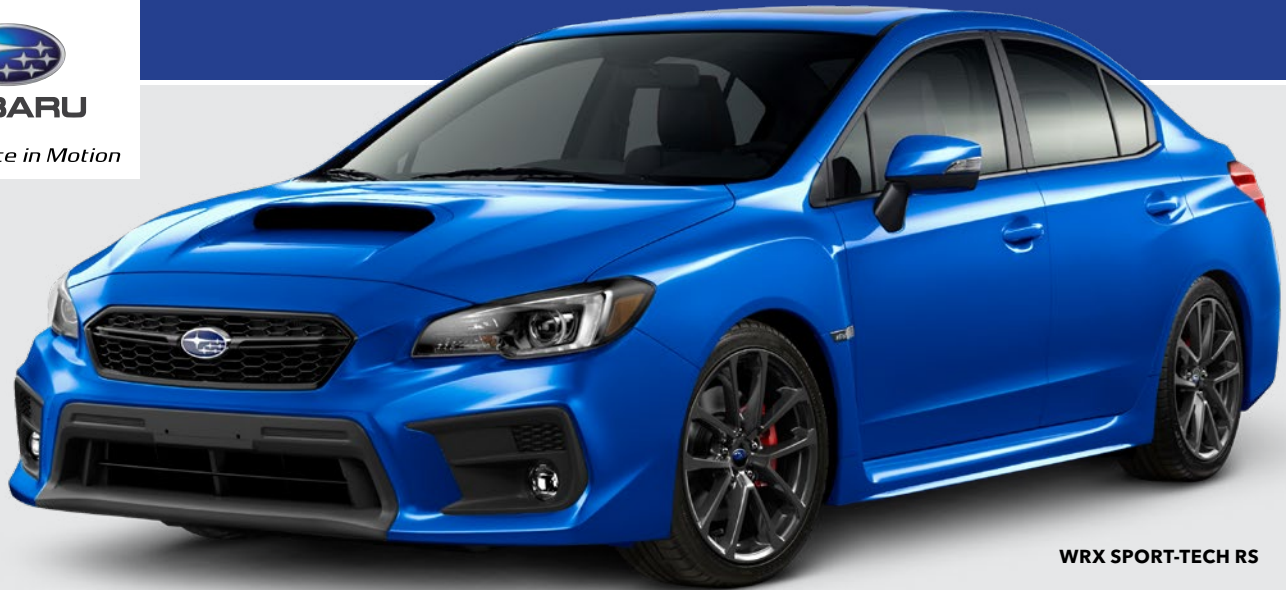
WRX SPORT-TECH RS

Subaru's performance sedan for the true enthusiast offers refined styling yet still delivers a powerful message. For 2019 the WRX includes Subaru's latest infotainment system, featuring the choice of 6.5- or 7-inch touchscreens with Apple CarPlay and Android Auto smartphone compatibility. Better still, the 2019 WRX delivers the same outstanding value that it's long been known for – and one that's helped it secure the ALG Canadian Residual Value Award for Best Sports Car for the seventh time in 10 years.