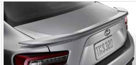
Rear lip spoiler