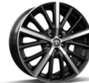
18-in. split-spoke alloy wheel 2