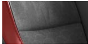
Black Granlux ®8 with Red leather trim