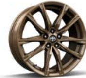
17-in. bronze-colored twisted-spoke alloy wheel 2