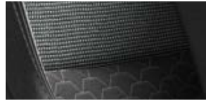
Black fabric with Granlux ®8 trim