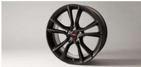
TRD 18-in. black alloy wheel 2