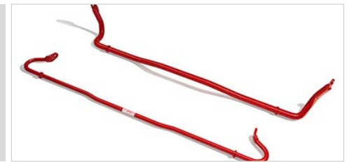
TRD sway bars