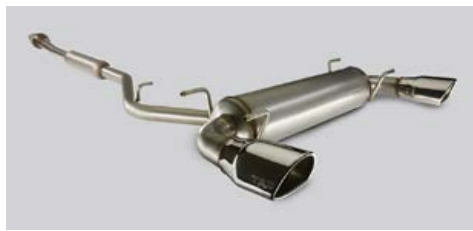
TRD performance dual exhaust