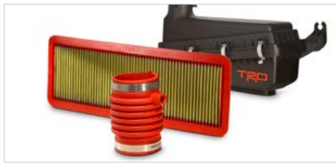
TRD air intake system

TRD performance dual exhaust TRD quick shifter TRD sway bar kit TRD sway bars Universal tablet holder 27