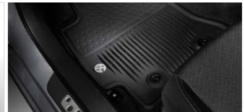
All-weather floor mats 10