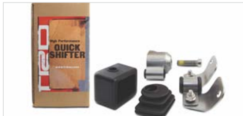
TRD quick shifter