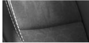
Black Granlux ®8 with leather trim