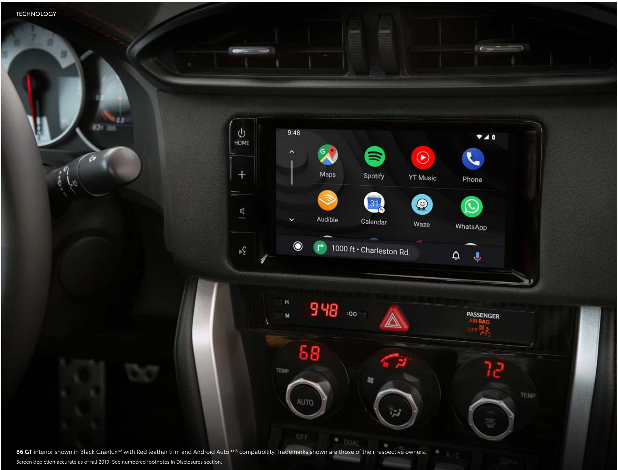
86 GT interior shown in Black Granlux ® with Red leather trim and Android Auto ™ compatibility. Trademarks shown are those of their respective owners.

Screen depiction accurate as of fall 2019. See numbered footnotes in Disclosures section.