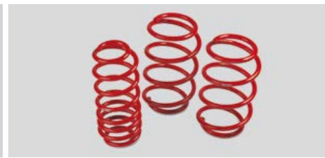
TRD lowering springs