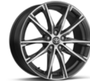
17-in. twisted-spoke alloy wheel 2