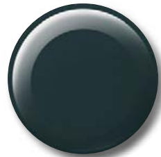
Cosmic Gray Mica