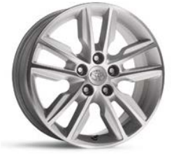
XLE and XLE Premium alloy wheel