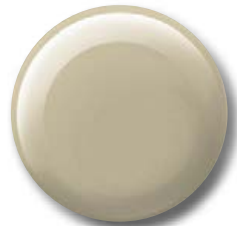
Crème Brulee Mica