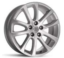
Limited alloy wheel

Plush leather options shown — Avalon offers several choices including Limited and Hybrid Limited with premium perforated leather trim.