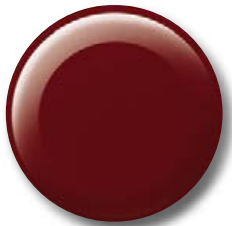
Ooh La La Rouge Mica