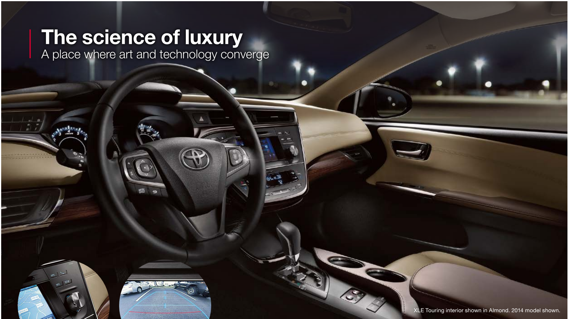
XLE Touring interior shown in Almond. 2014 model shown.

A place where art and technology converge