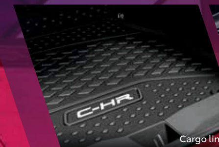
Cargo liner 17