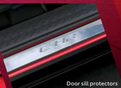
Door sill protectors