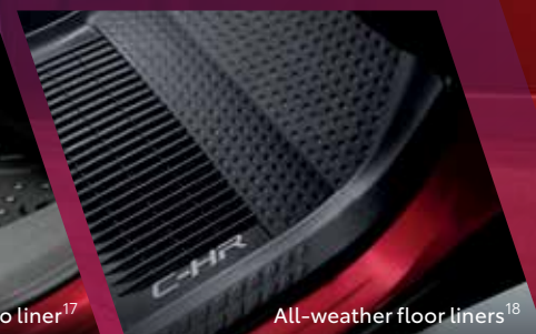
All-weather floor liners 18