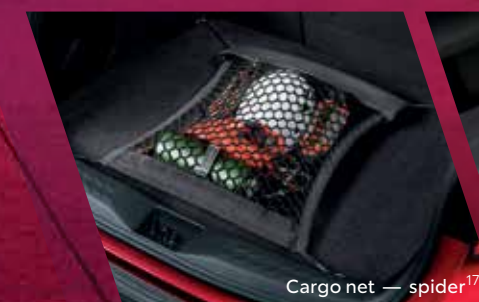
Cargo net — spider 17