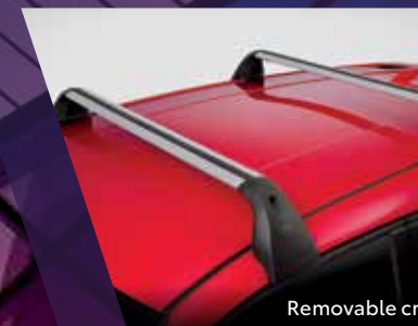
Removable cross bars 16

Add a personal touch to your C-HR with Genuine Toyota Accessories.