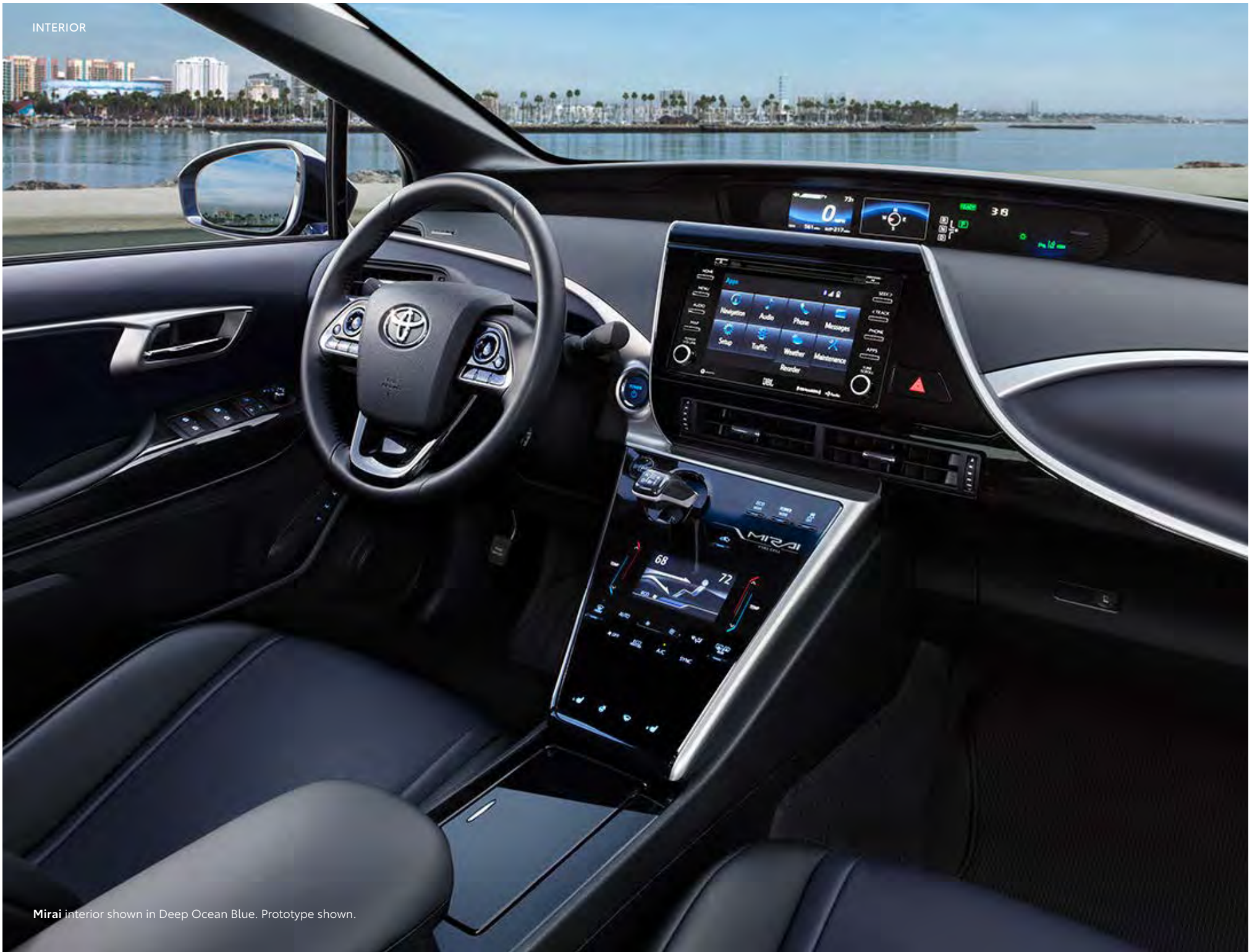
Mirai interior shown in Deep Ocean Blue. Prototype shown.