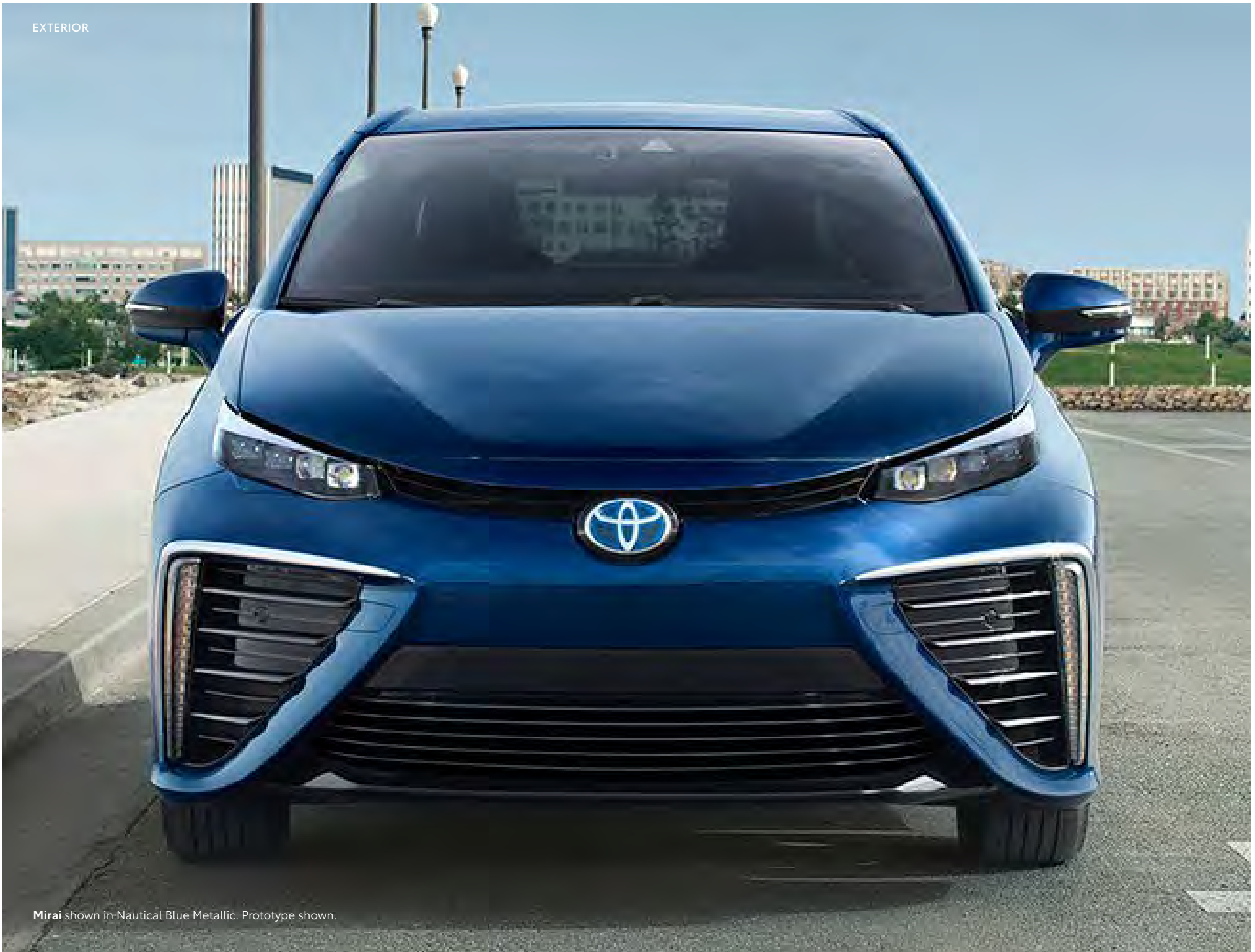
Mirai shown in Nautical Blue Metallic. Prototype shown.