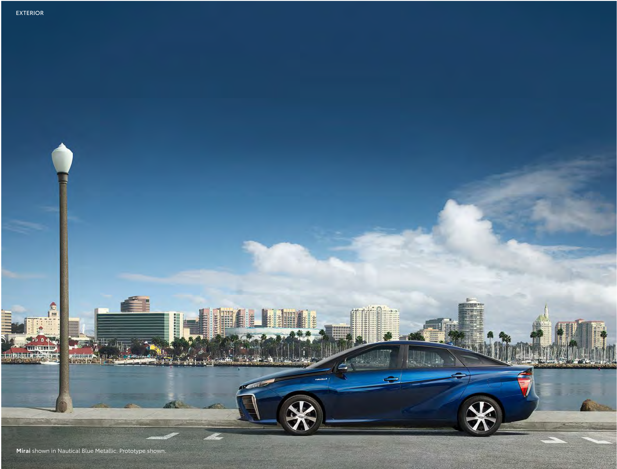
Mirai shown in Nautical Blue Metallic. Prototype shown.