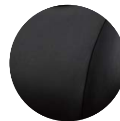
SofTex® shown in Black