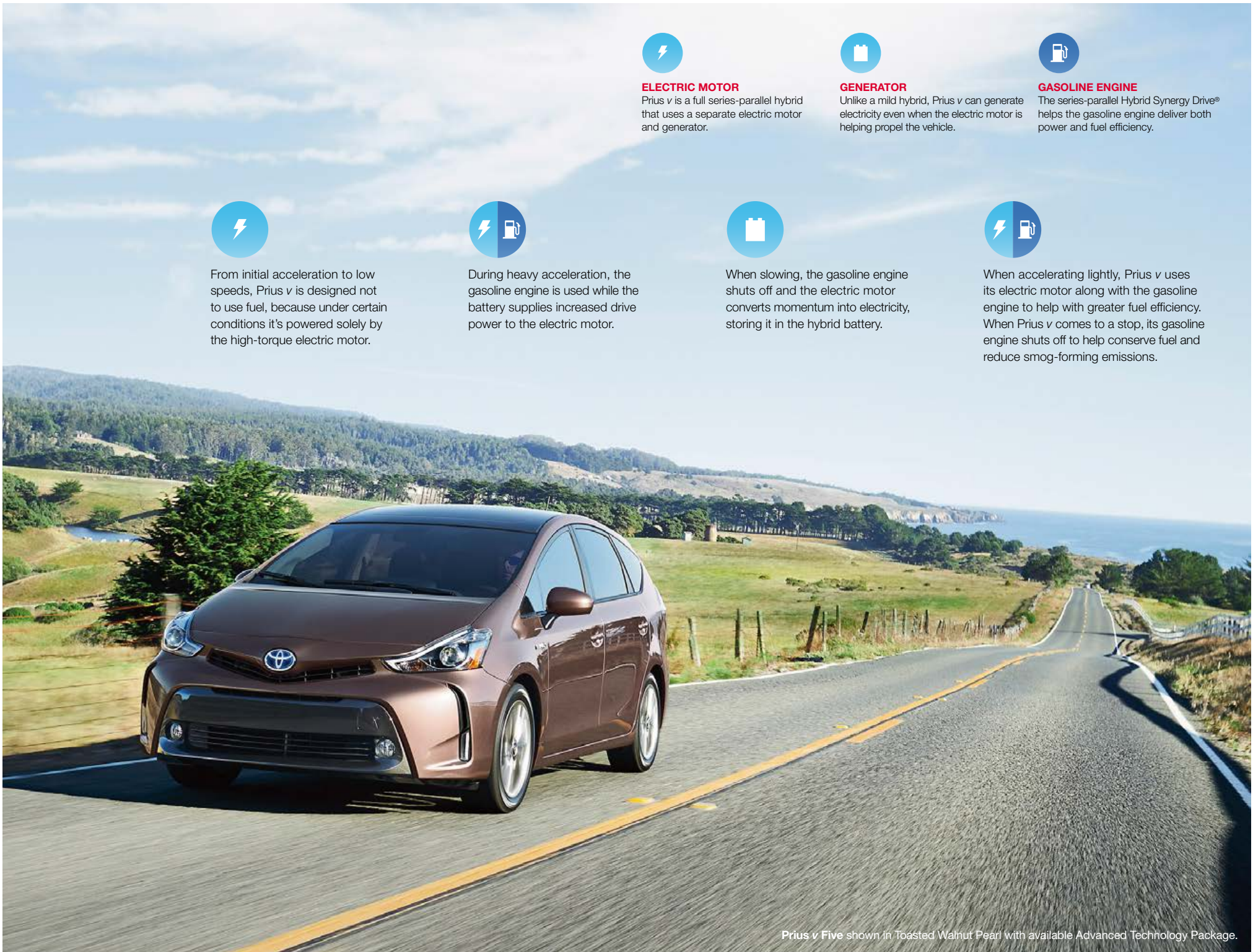
Prius v Five shown in Toasted Walnut Pearl with available Advanced Technology Package.

The series-parallel Hybrid Synergy Drive® helps the gasoline engine deliver both power and fuel efficiency.