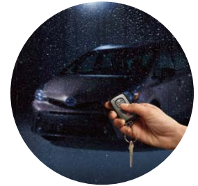
Remote Engine Starter