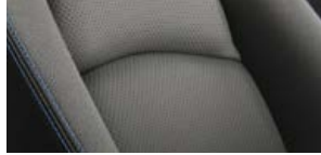
XLE leatherette trim shown in Black