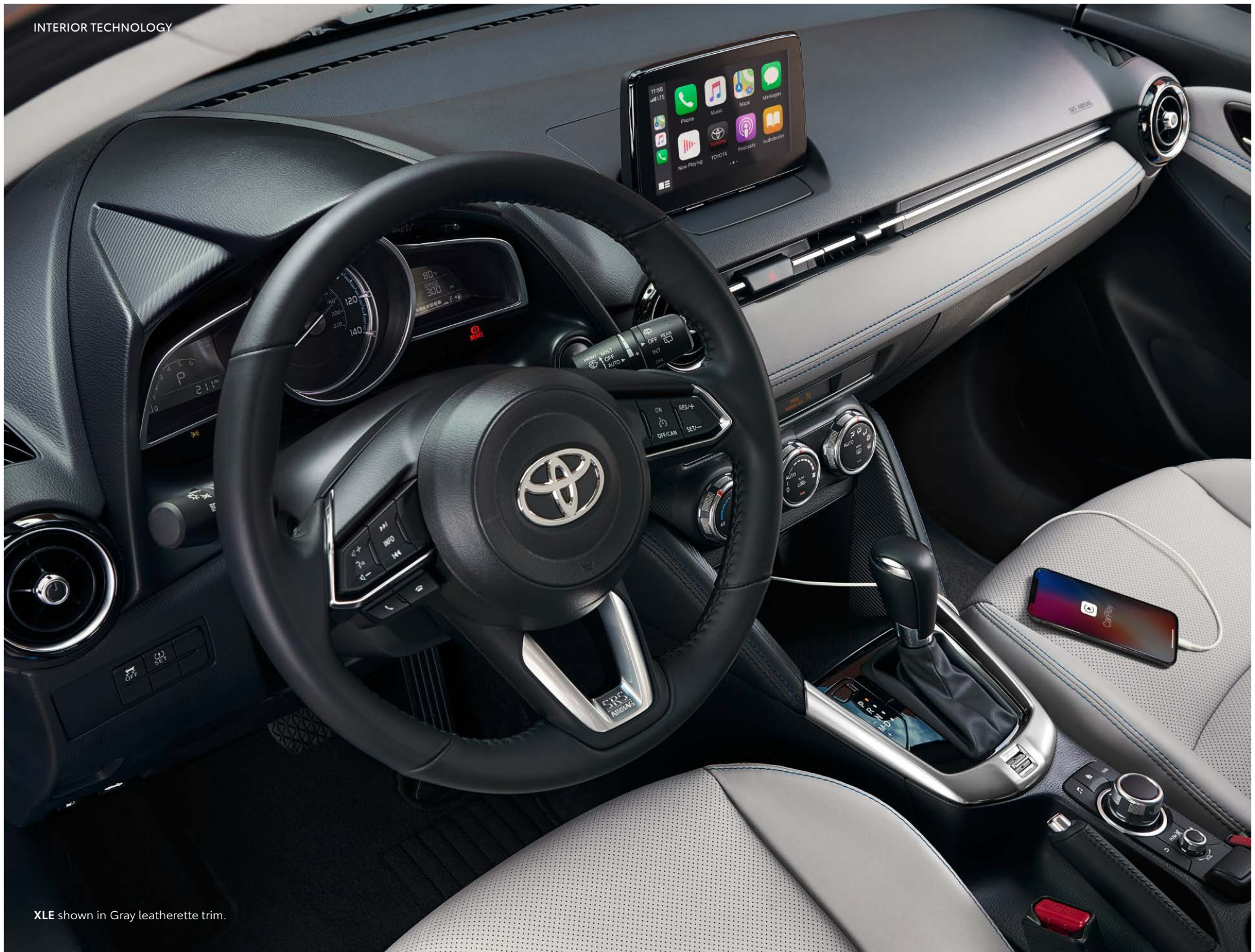
XLE shown in Gray leatherette trim.