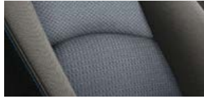
LE fabric shown in Blue Black