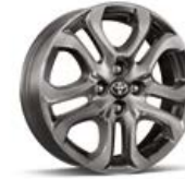
LE and XLE 16-in. Dark Gray split-spoke alloy wheel