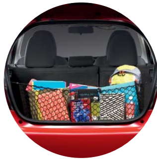
Cargo net — envelope 1