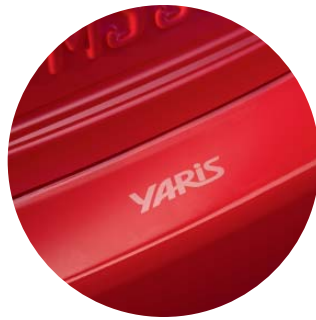
Paint protection film 3