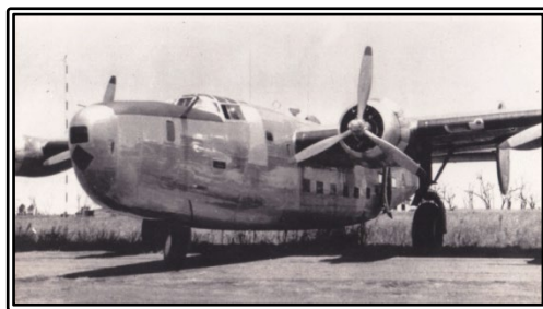
Figure 11: Consairways LB-30/B-24 pioneered air routes from California to the South Pacific.

the Pacific using their fleet of 13 converted LB-30/B-24 "Liberator" bombers. The first host unit for the base was the 23rd Ferrying Group. At the end of WWII, the primary mission became the airlift of troops and supplies to occupied Japan and Korea, and the processing of war-weary returning GIs. On June 1, 1948, the Military Air Transport Service (MATS) assumed jurisdiction. In July, two of the base's air transport C-54 squadrons left for Europe to assist in the Berlin Airlift.