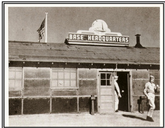
Figure 10: The First Base Headquarters on Fairfield-Suisun AAB c. 1943.

attack on Pearl Harbor as a home for medium bombers and fighters assigned to defend the West Coast. The first runway and temporary buildings were constructed by the Army Corps of Engineers in the summer of 1942. They were used initially by Army and Navy fighter planes for takeoff and landing practice. For a few months, the outline of an aircraft carrier's deck was painted on the runway to help newly-commissioned Navy pilots practice landings. The strong local prevailing winds nearly duplicated those at sea.