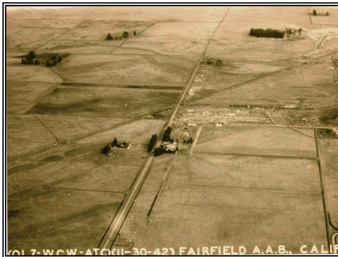
Figure 8. Early construction at Fairfield-Suisun Army Air Base in November 1942 looking east. The road in the center is today's Travis Avenue.

On April 22, 1942, the Office of the Chief of Engineers, Washington DC, authorized spending $998,000 for construction of two runways and a few temporary buildings on 945 acres. The project received a top wartime priority, and construction began in the summer of 1942. On May 17, 1943, the Air Transport Command officially activated Fairfield-Suisun Army Air Base, named after the two cities that the base was located between.