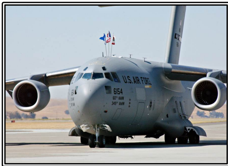
Figure 7: The first C-17 assigned to the 60AMW, "The Spirit of Solano," arrived Aug 8, 2006.

As missions in Air Mobility Command continued to evolve, the 60th led the way to