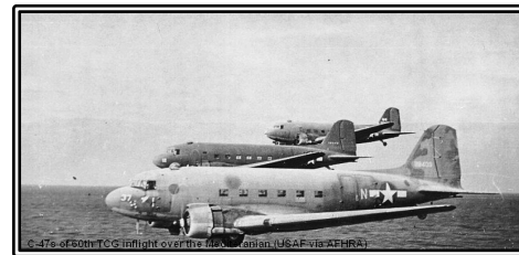
Figure 1: 60 th TCG C-47 "Skytrains" over the Mediterranean in WWII.

While stationed in North Africa, the 60th also participated in the battle for Tunisia, dropping paratroopers near the combat area on two occasions. The unit also trained with gliders and in June 1943, towed gliders to Syracuse and dropped paratroopers behind enemy lines at Catania when the allies invaded Sicily in July 1943. When not engaged in airborne operations, the group transported men and supplies and evacuated wounded personnel. The 60th flew to northern Italy in October 1943 to drop supplies to men who had escaped from prisoner-of-war camps and dropped paratroopers at Megara during the airborne invasion of Greece in October 1944. During World War II, the 60th operated from bases in Algeria, Tunisia, Sicily, and Italy until after V-E Day. The unit's C-47 "Skytrain" aircraft played an integral role in transporting troops, supplies and equipment during the Allied Invasion of Europe. On July 31, 1945 the 60 TCG was formally inactivated as the war in Europe ended.