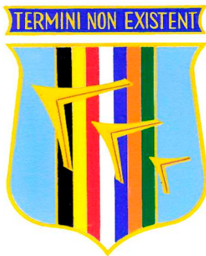
Figure 4. Original emblem from the 60th Troop Carrier Wing - 1955.

On August 1, 1955 the wing was assigned to the 322nd Air Division and moved to Dreux Air Base in France. Later that month, the 62nd Troop Carrier Squadron, a Tactical Air Command rotational unit from Stewart Air Force Base, Tennessee, arrived and entered attached status with the 60th. From March 22 thru June 2, 1956, the 309th Troop Carrier Group, Assault (Fixed Wing), from Ardmore Air Force Base, Oklahoma deployed to Dreux. Initially, attached to the 60th for logistical support and operational control, the 309th was officially assigned to the wing on August 8, 1956. The 309th introduced the C-123 "Provider" to the European theater. (It is noteworthy to mention, the unit emblem used today was created from its time while assigned at Dreux AB)