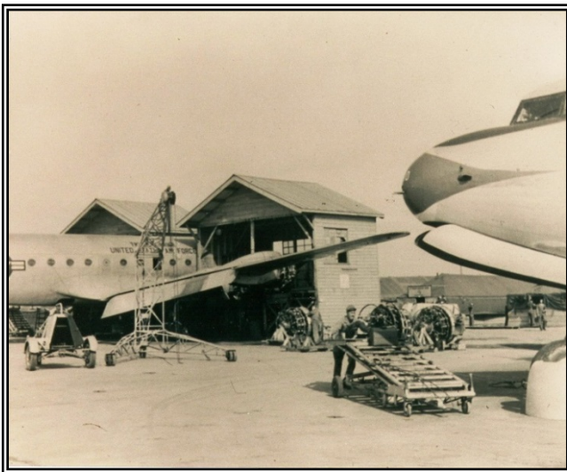
Figure 13. A C-54 “Skymaster” being worked on in the Nose Dock at Fairfield-Suisun AFB.

Military Airlift Command and Strategic Air Command tankers were fused into a single team.