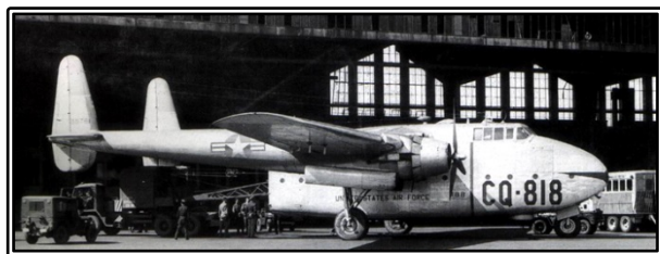
Figure 2: 60 TCG Fairchild C-82 "Packet" at Tempelhof Air Port during the Berlin Airlift

the 60th Troop Carrier Wing (TCW) was activated on July 1, 1948 at Kaufbeuren Air Base Germany flying the C-54 "Skymaster". Initially flying the C-47, the 60th converted to the C-54 "Skymaster" and the unit was re-designated as the 60th Troop Carrier Wing (Heavy) on November 5, 1948. At the time that the 60th became a subordinate unit assigned to the wing, it managed three flying squadrons: the 10th, 11th, and 12th Troop Carrier Squadrons. The 60 TCW operated C-54s and a few C-82 "Packet" aircraft during the Berlin Airlift.