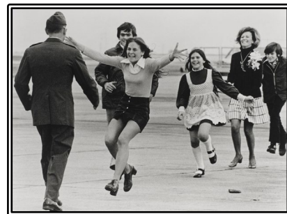
Figure 5. A former POW returns to his family on the Travis AFB flightline in February 1973 as part of Operation HOMECOMING.

In October 1974, the 60th began supporting Operation DEEP FREEZE missions, the annual resupply of scientific research teams in the Antarctic. Flying from Christchurch, New Zealand, the wing had logged a near perfect record for reliability. On October 4, 1989, a 60th Military Airlift Wing C-5 became the first "Galaxy" to land