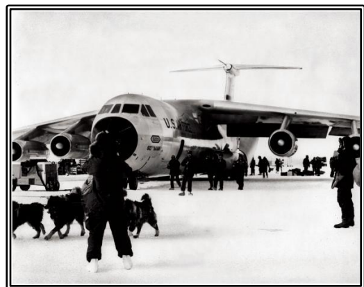
Figure 6. On 14 November 1966, the 60 MAW landed the first C-141 "Starlifter" at McMurdo Station, Antarctica as part of Operation DEEP FREEZE.