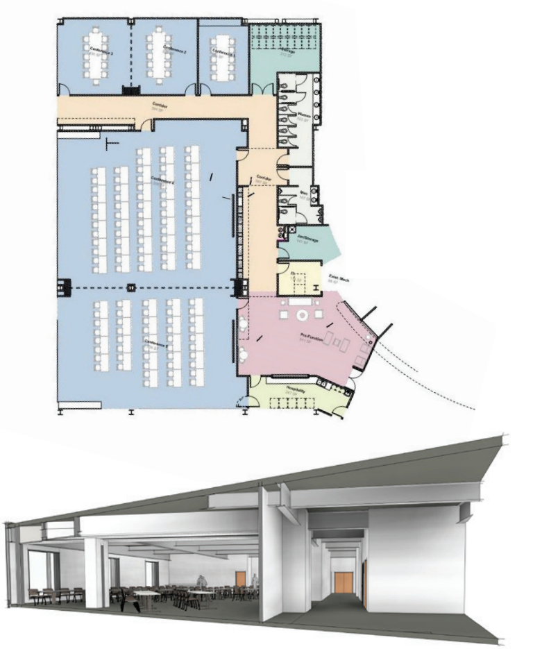
Architectural view into the Roger W. Spoelman Conference & Learning Center