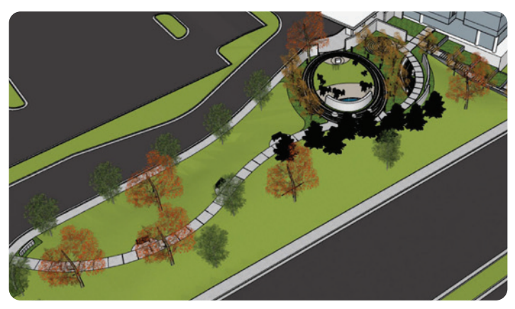
Architectural rendering of the Healing Garden

The restorative power of nature is well recognized, yet it is often not easily accessible in the hospital setting. There are significant findings strongly suggesting well-designed hospital gardens help reduce stress, improve clinical outcomes and heighten patient and family satisfaction.