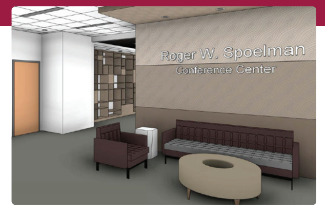
Architectural rendering of the entrance into the Roger W. Spoelman Conference & Learning Center