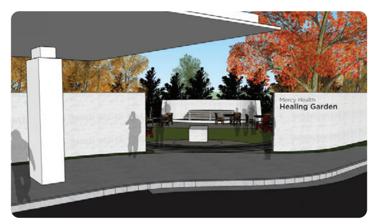
Architectural rendering of the Healing Garden entrance