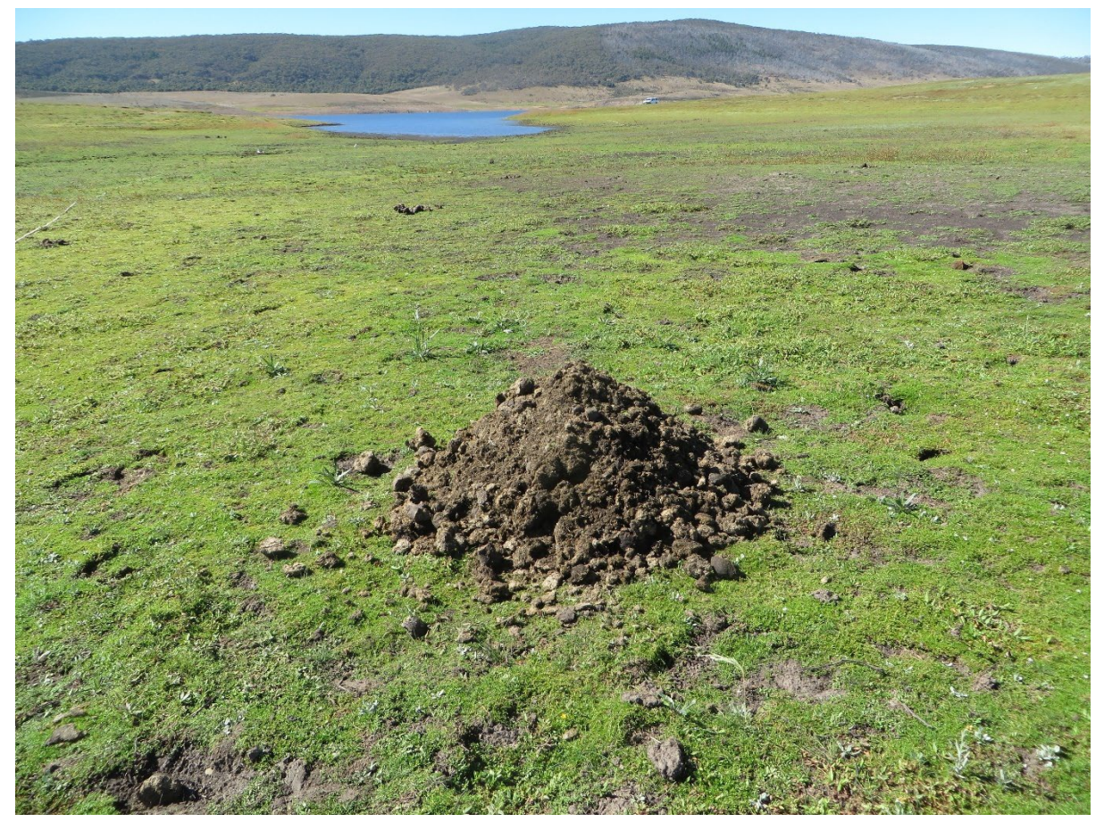
Wild horse dung heaps are serious vectors for the spreading of weeds in Kosciuszko National Park.

Further damage to plants and vegetation can occur when horses trample and rub against vegetation, browse the growing tips, and compact soils with their hard hooves, causing disturbance and increasing erosion (Schott 2005). Much of the research on impacts of feral horses over the past quarter century has focused on vegetation impacts, with long-term legacy effects of brumby activity in both the Victorian and NSW alpine and sub-alpine communities. There is extensive scientific literature documenting wild horse impacts on plant community structure and composition (Venn and Williams, 2018; Eldridge et al., 2019), with strong focus on terrestrial systems (Prober and Thiele, 2007). Brumbies do this damage by feeding on grasses and sedges, and also bark and roots, but also their physical impact with their weight and hard hooves, impacting vegetation and compacting soil. High densities of wild horses negatively impact many alpine plant species, including the anemone buttercup Ranunculus anemoneus (Doherty et al., 2015). They also change the structure of the habitat, affecting specialist alpine mammals such as the broad-toothed rat Mastacomys fuscus (O'Brien et al., 2008; Schulz and Green, 2018; Cherubin et al., 2019; Eldridge et al., 2019; Schulz et al., 2019) and mountain pygmy-possum Burramys parvus .