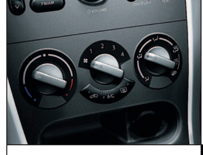
Air conditioning. For chilled air on hot days, faster demisting when it's damp outside, and a more pleasant driving atmosphere throughout the year, air conditioning is a brilliant addition to any car interior. It's standard on Agila SE and optional on S.