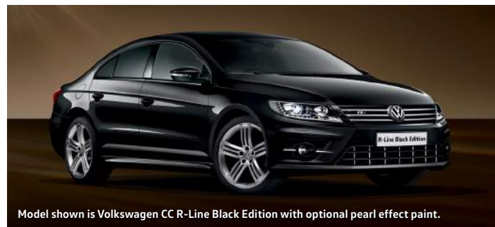
Model shown is Volkswagen CC R-Line Black Edition with optional pearl effect paint.

– Upholstery – 'Nappa' leather 2 seat centre section and 'Carbon optic' design side bolsters