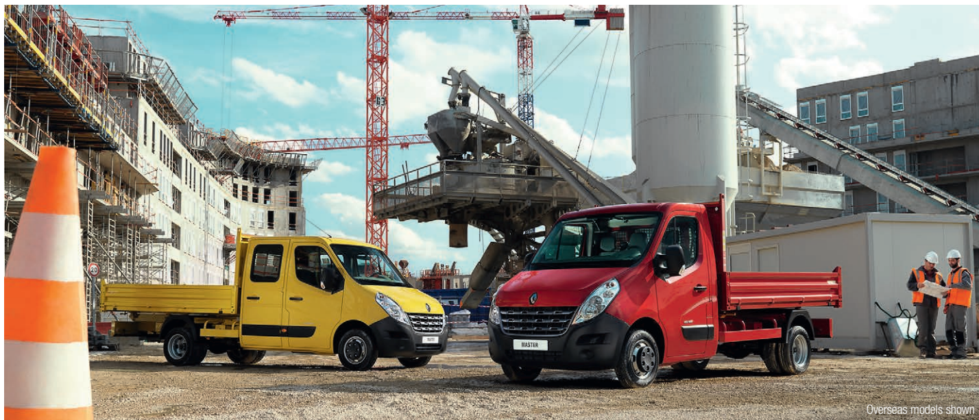
Overseas models shown